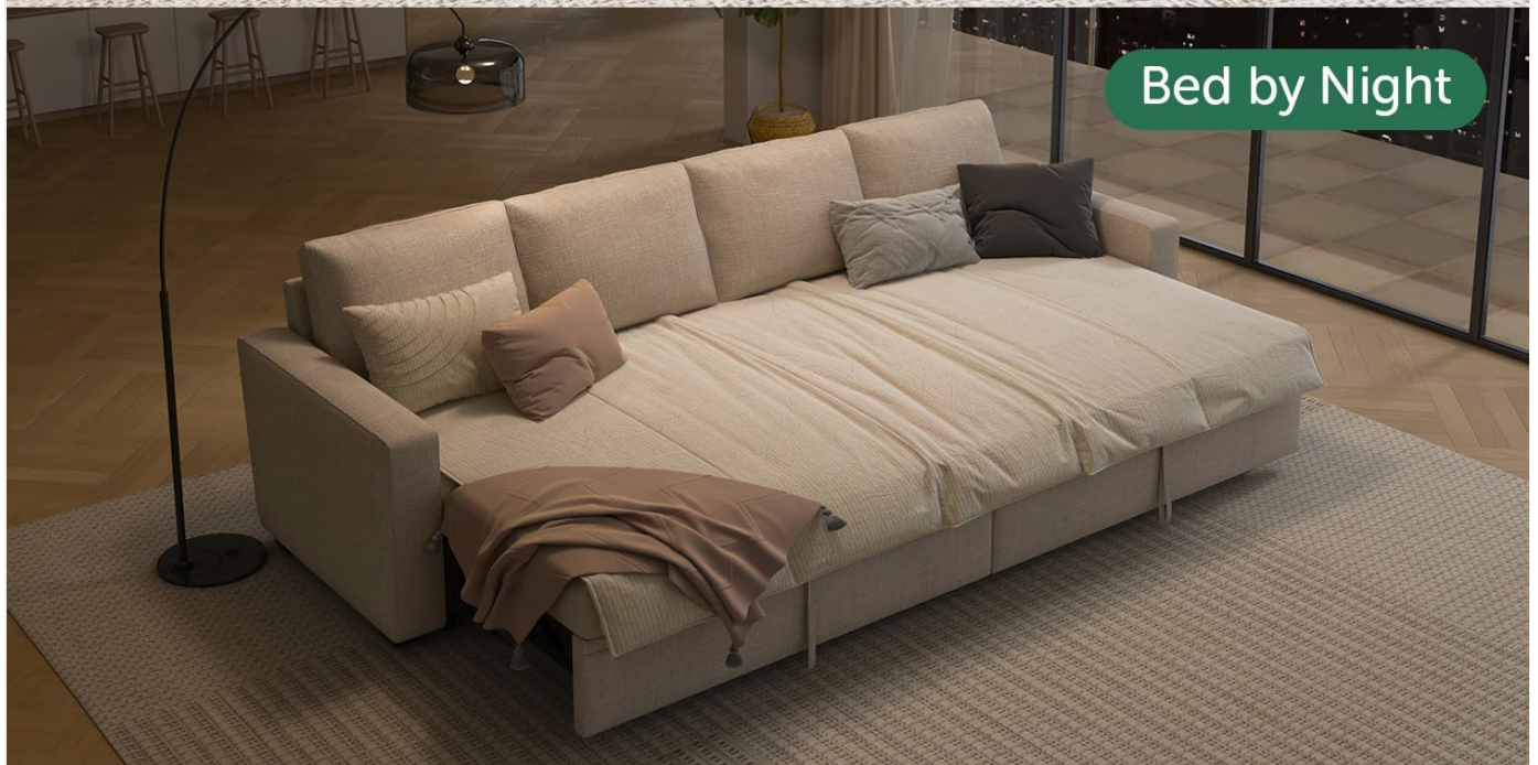
Image: Comparison of the sofa in its standard configuration (day) and converted into a bed (night).