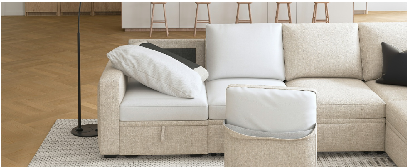
Image: A close-up view of a sofa cushion with its removable cover partially unzipped, demonstrating the washable feature.