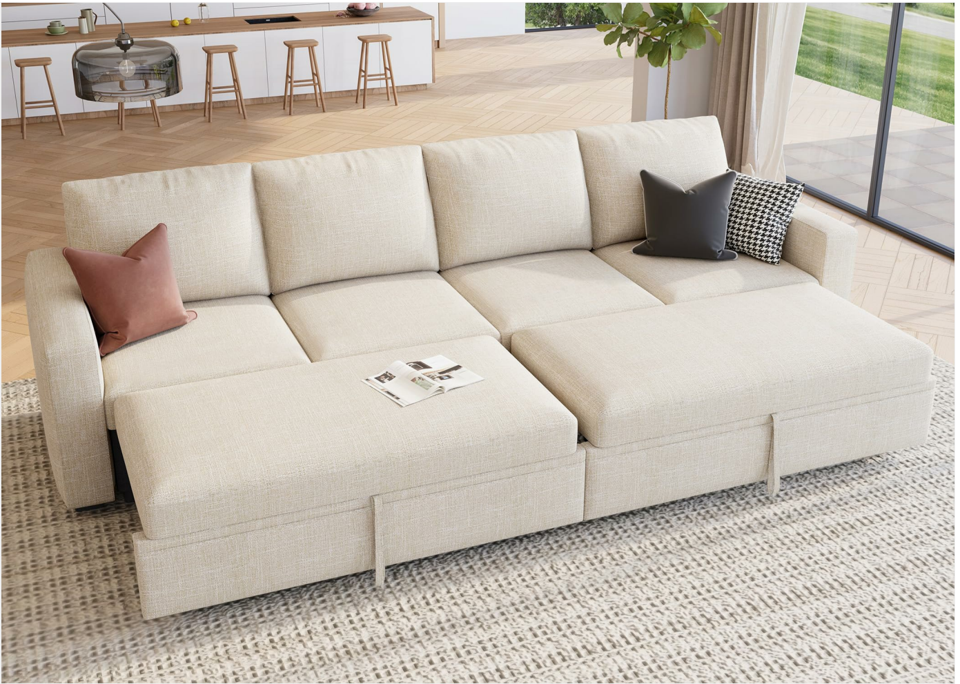
Image: The HONBAY Modular Sectional Sleeper Sofa Bed in beige, showcasing its full configuration.