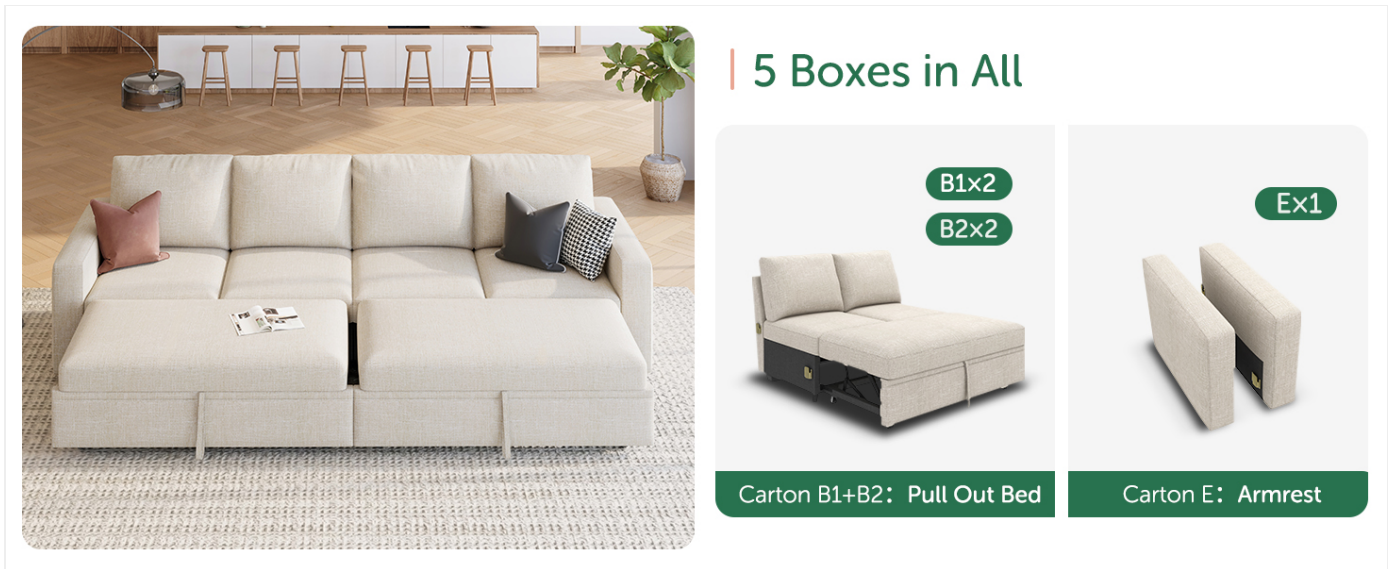
Image: Illustration of the sofa components distributed across five packages, including pull-out bed and armrest cartons.