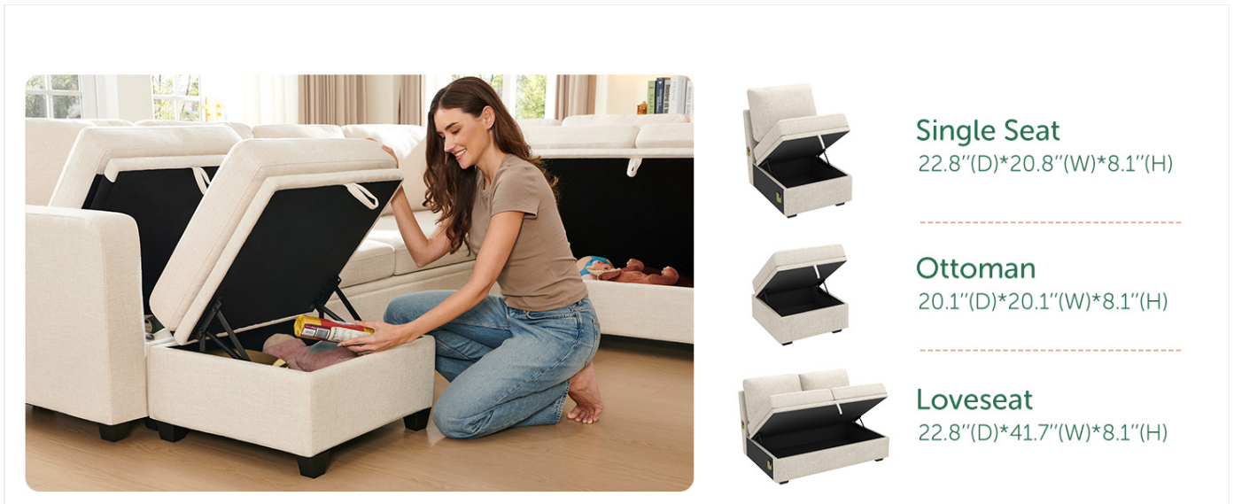
Image: A person lifting a seat cushion to reveal the integrated storage space within the sofa module.