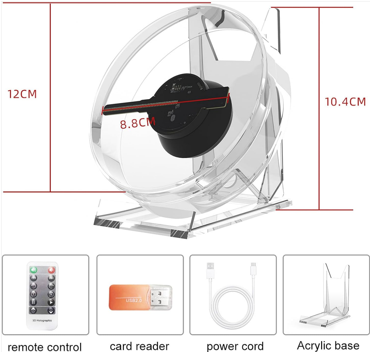
Figure 1: Included accessories: remote control, card reader, power cord, and acrylic base.