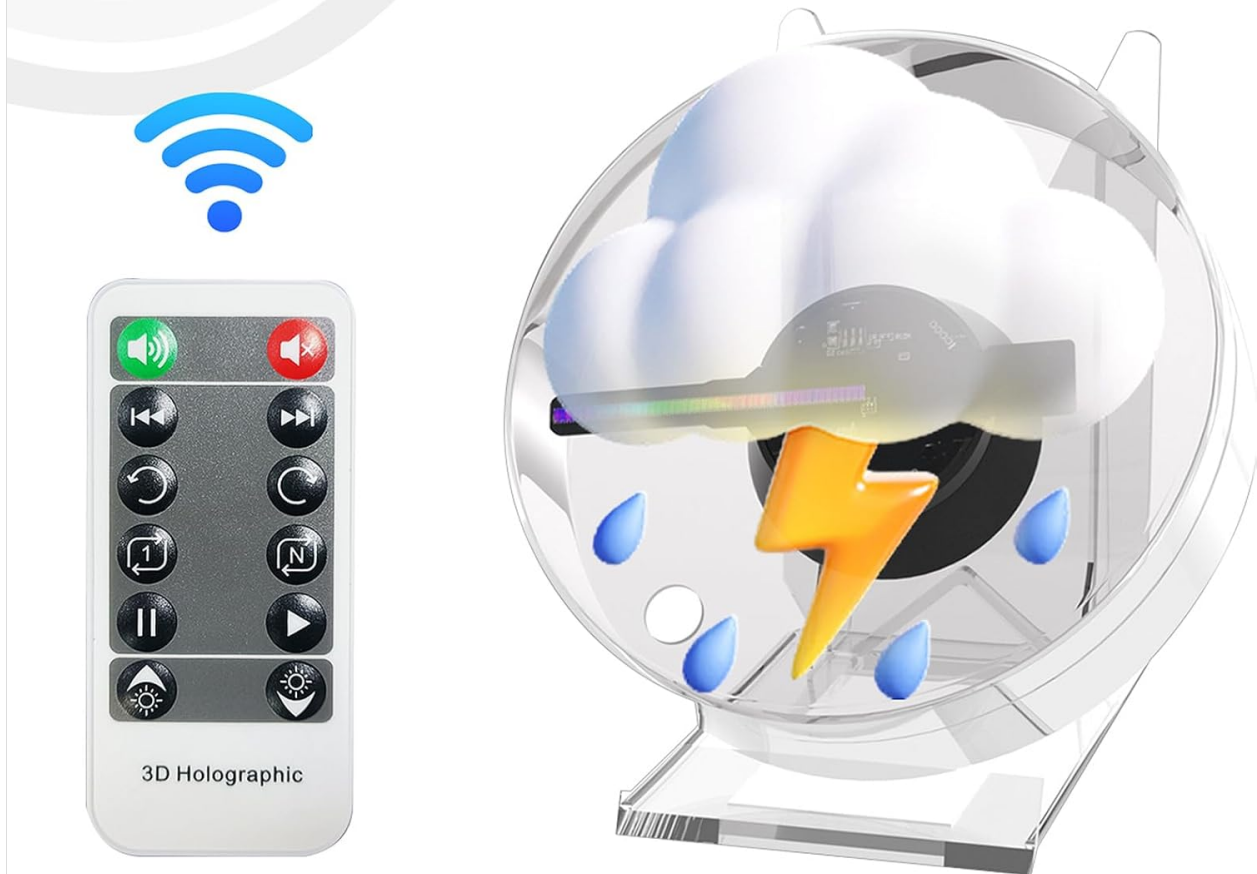
Figure 3: The projector and its remote control, illustrating remote functionality.

The device is equipped with a remote control which can be used to control the device