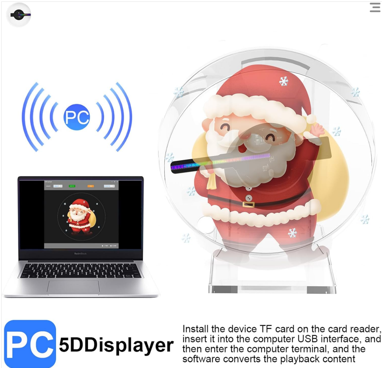
Figure 4: Process of uploading content to the projector via a computer and TF card.