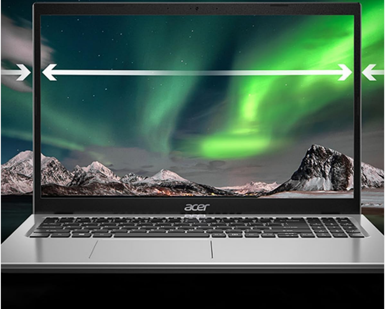
Figure 2: The 15.6-inch Full HD display of the Acer Aspire 3 Slim Laptop, highlighting its narrow bezels for an expansive viewing experience.

Get more monitor real estate for these amazing visuals with the 15.6" Full HD display with a narrow-bezel design