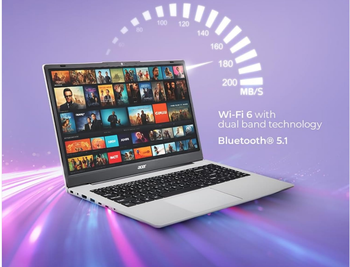
Figure 4: The Acer Aspire 3 Slim Laptop demonstrating its fast and reliable wireless connectivity, featuring Wi-Fi 6 and Bluetooth 5.1.