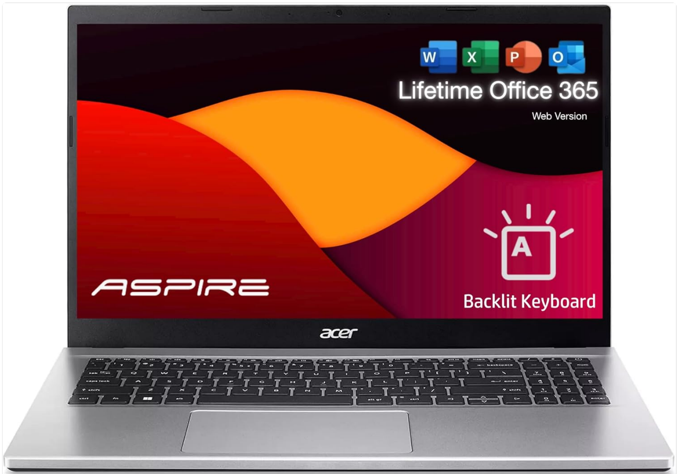
Figure 1: Front view of the Acer Aspire 3 Slim Laptop, showcasing its display and keyboard. The screen displays icons for web-based Office 365 and a backlit keyboard indicator.