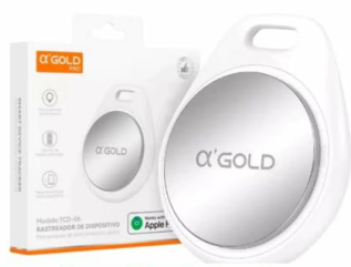
Image 1: The Genérico Smart Tag TDC-06 showing its compact size (4.5 cm x 5 cm) and key features like connection loss alert, 1-year battery life, and Apple Find My technology. It also highlights ANATEL certification.