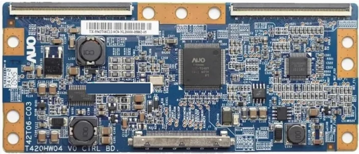
Figure 3.1: Top view of the T-CON Board T420HW04 V0 42T06-C03, showing various integrated circuits and connectors.