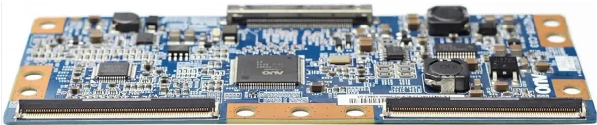
Figure 3.2: Angled perspective of the T-CON Board, highlighting its compact design and component layout.