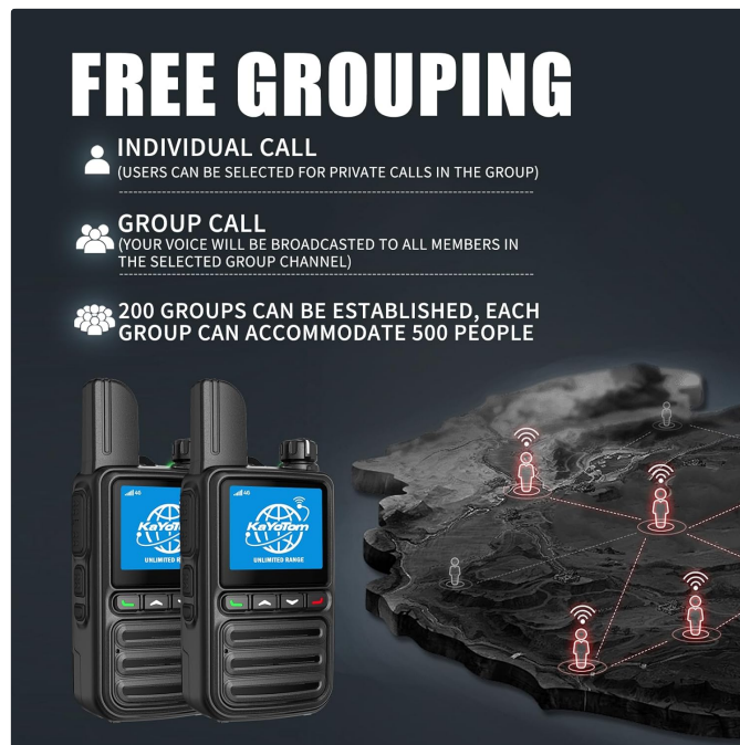
Figure 2: Visual representation of multi-device grouping capabilities.