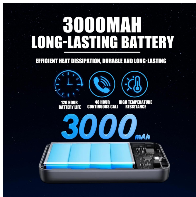
Figure 4: 3000mAh long-lasting battery features.