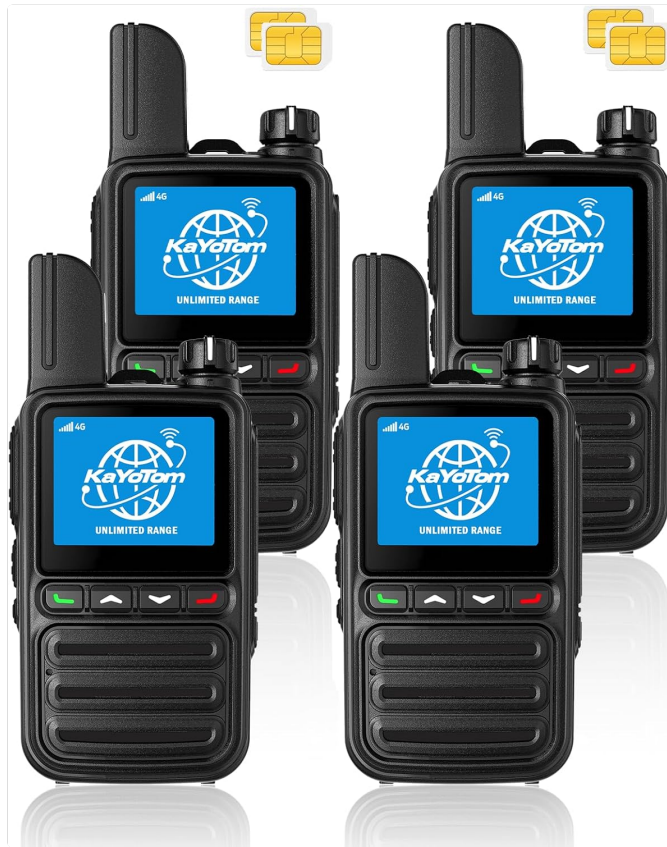
Figure 1: KAYOTOM AT-600 Walkie Talkie 4-Pack with SIM cards.