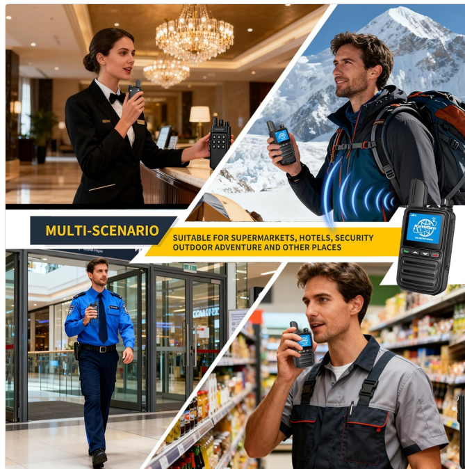
Figure 5: Multi-scenario usage of the walkie talkie.