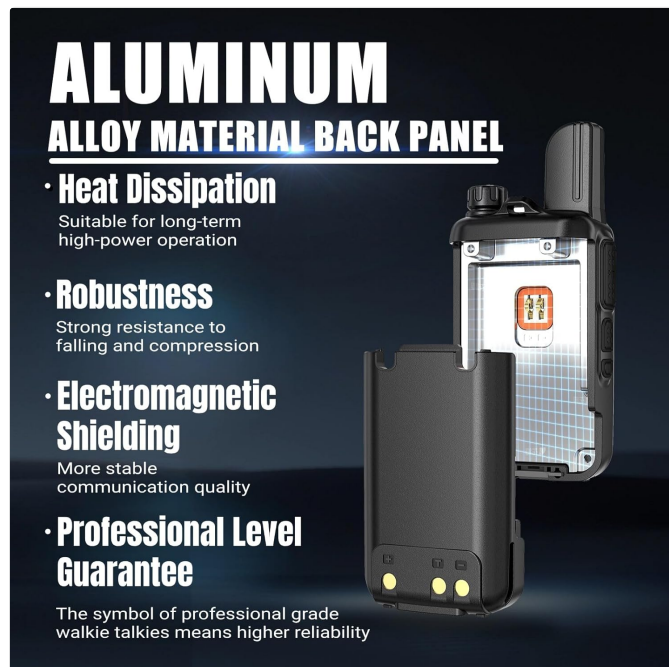
Figure 7: Aluminum alloy back panel for enhanced durability and heat dissipation.