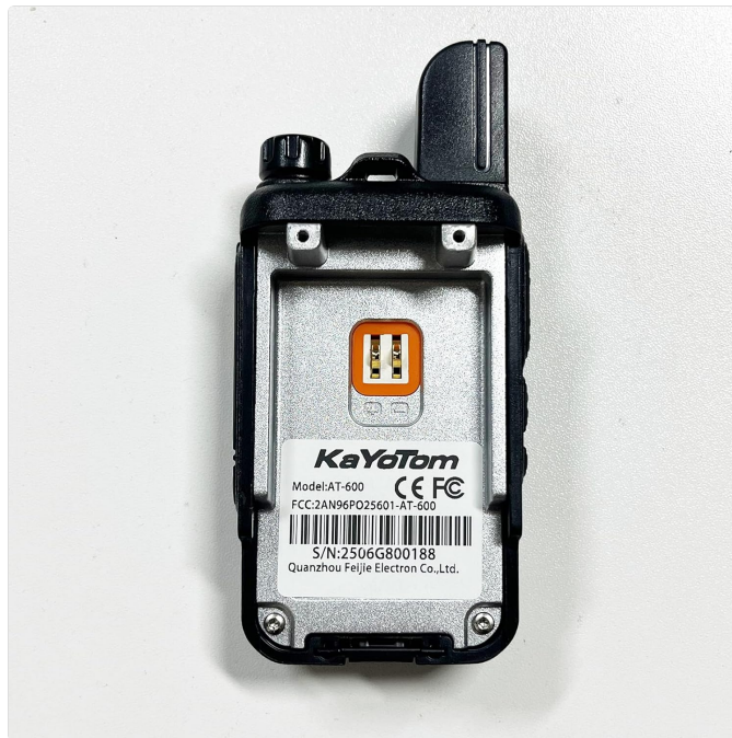
Figure 6: Back panel of the KAYOTOM AT-600, showing model and FCC ID.