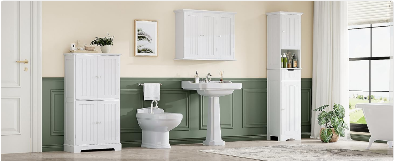
Figure 5: Cabinet in a bathroom setting, providing convenient storage.

Ideal for organizing toiletries, medicine, towels, and other bathroom essentials, keeping them neatly out of sight.