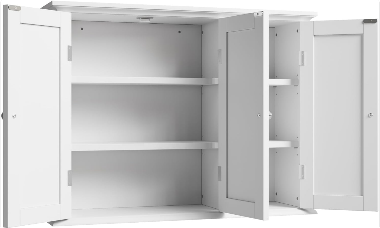
Figure 4: Interior of the cabinet demonstrating adjustable shelf positions.