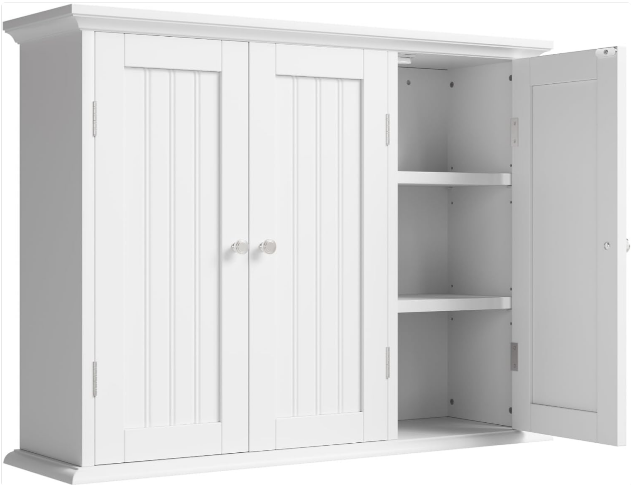
Figure 1: ChooChoo MC2504-WH Bathroom Wall Cabinet with closed doors.