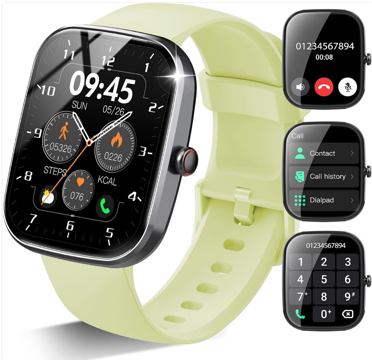
Image: The Csasan T70 Smart Watch in green, showcasing its 1.91-inch HD display. The main screen displays the time (09:45), date (SUN 05/26), steps (05326), and calories burned (0226). Adjacent screens illustrate call functionalities, including an active call interface with duration (00:08), a call menu with options for Contact, Call History, and Dialpad, and a numeric dialpad for making calls.