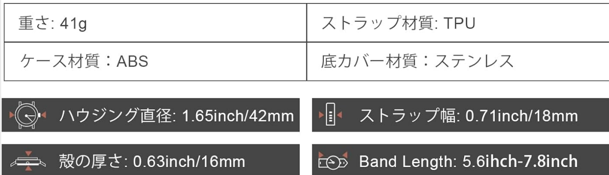
Image: Technical diagram illustrating the watch's dimensions (42mm housing diameter, 16mm thickness, 18mm strap width) and materials (ABS case, TPU strap, stainless steel back).