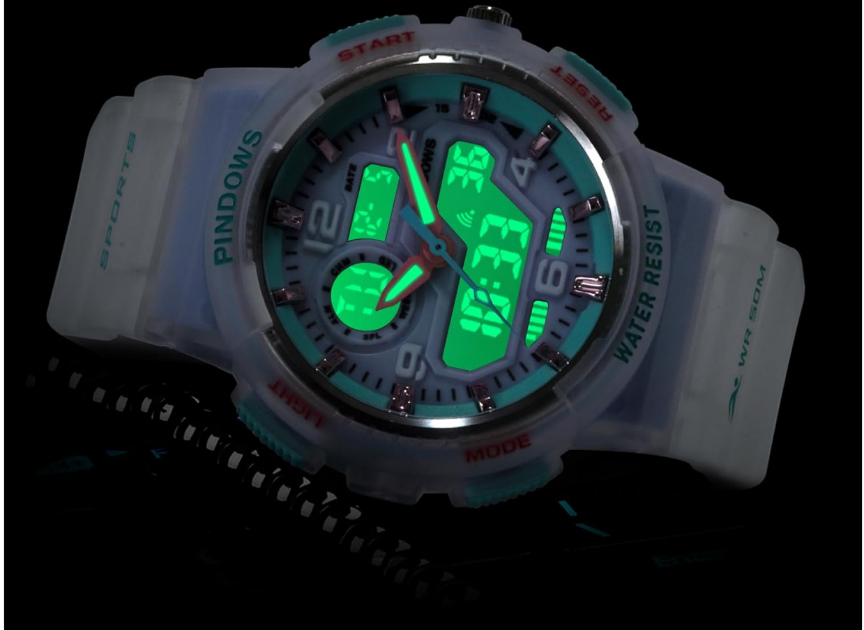
Image: The watch face with its digital display brightly illuminated by the LED backlight, enhancing visibility in low-light conditions.