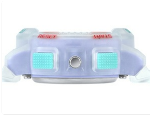
Image: Close-up side view of the watch, highlighting the 'RESET' and 'START' buttons on the right side.