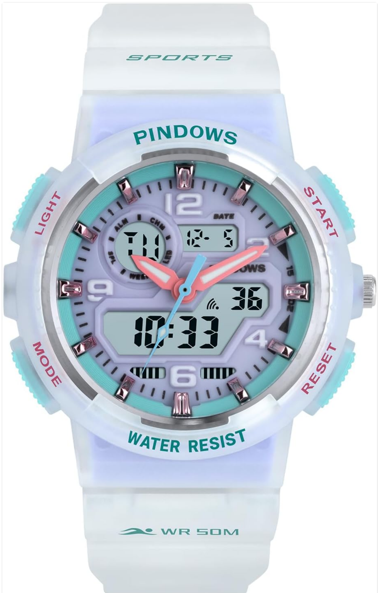
Image: Front view of the PINDOWS Ladies Sports Watch, highlighting its analog and digital display features.