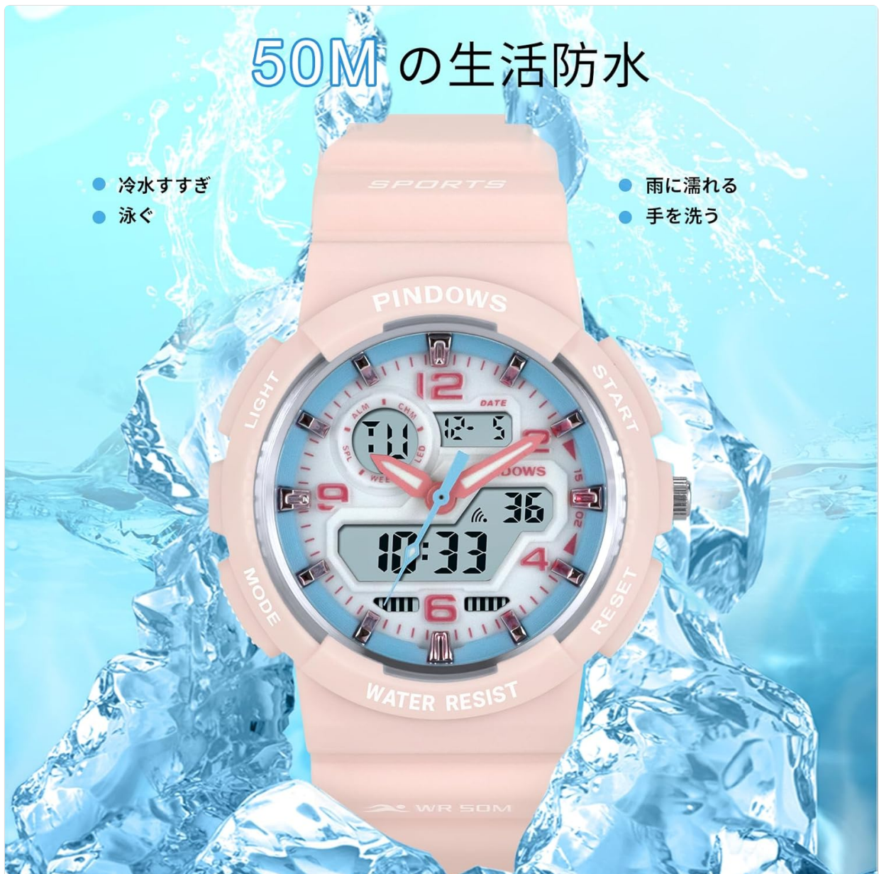
Image: The watch partially submerged in water, visually representing its 50-meter water resistance capability for daily activities like hand washing or rain exposure.

The watch is rated for 50 meters (5 ATM) water resistance. This means it is suitable for everyday use, such as hand washing, rain, and brief immersion in water. It is not designed for prolonged underwater activities, diving, or exposure to hot water/steam. Always ensure the crown is fully pushed in to maintain water resistance.