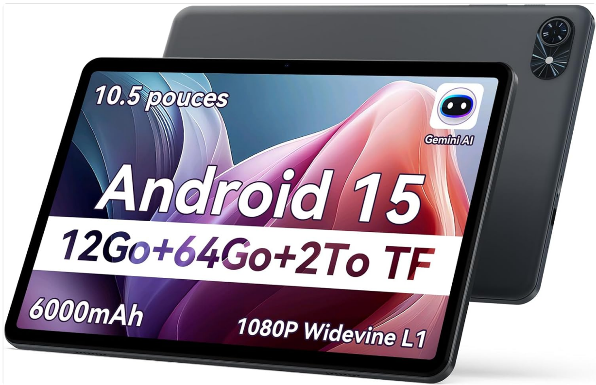
Image: The TABWEE T80 tablet showcasing its display with "Android 15" and "Gemini AI" branding, indicating its operating system and AI capabilities.