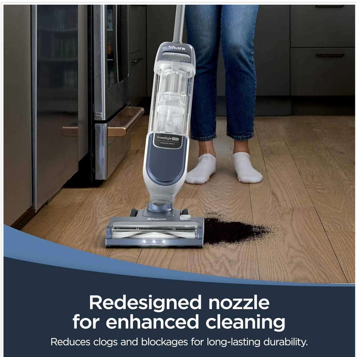
Image 8: The redesigned nozzle minimizes clogs for consistent performance.