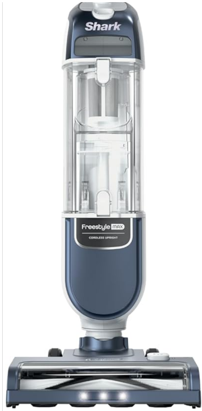
Image 1: Shark Freestyle Max Cordless Upright Vacuum, Nordic Blue.