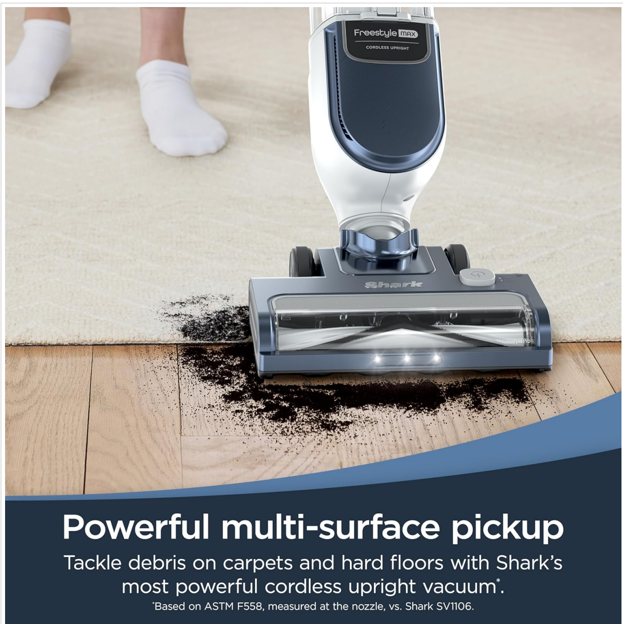
Image 4: Powerful suction effectively cleans both carpets and hard floors.