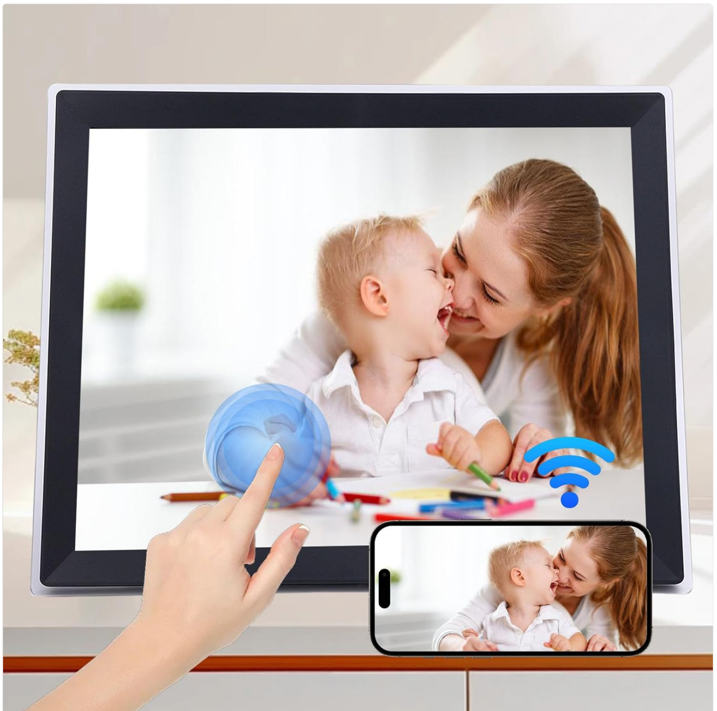
Image: A hand interacting with the digital picture frame's touchscreen, demonstrating its intuitive touch controls for navigation and content management.