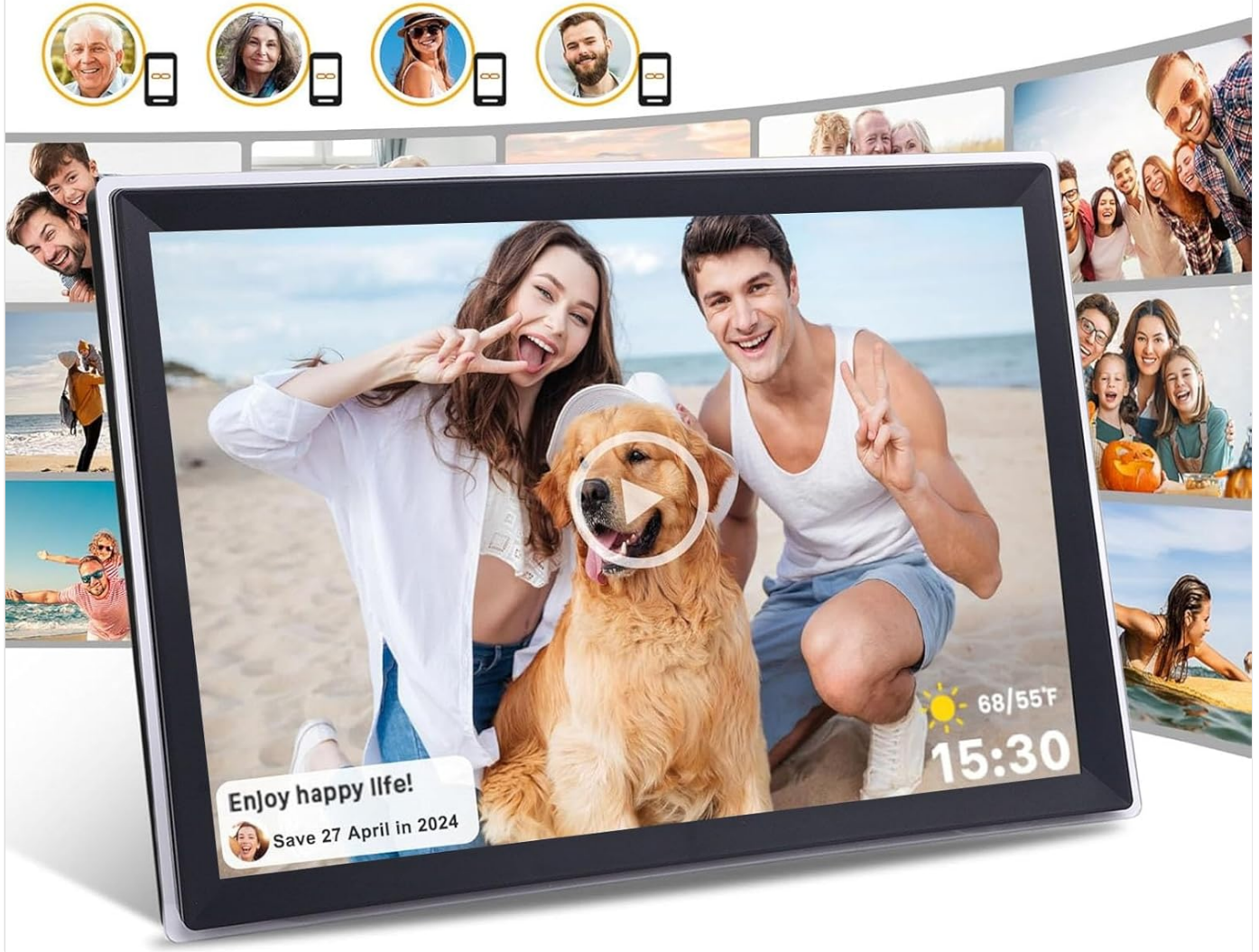
Image: The digital picture frame displaying a photo, with text indicating its 32GB built-in storage capacity and support for external storage cards and USB flash drives.

Store 50000+ photos, support storage card (Maximum 128GB) and USB flash drive to play, import, or back up photos and videos. Unlimited user can connect simultaneously.