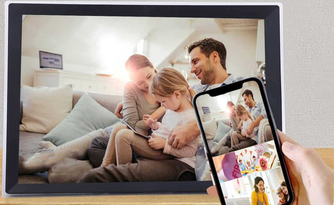
Image: The digital picture frame highlighting its support for multiple users to share photos, enabling family and friends to contribute memories.