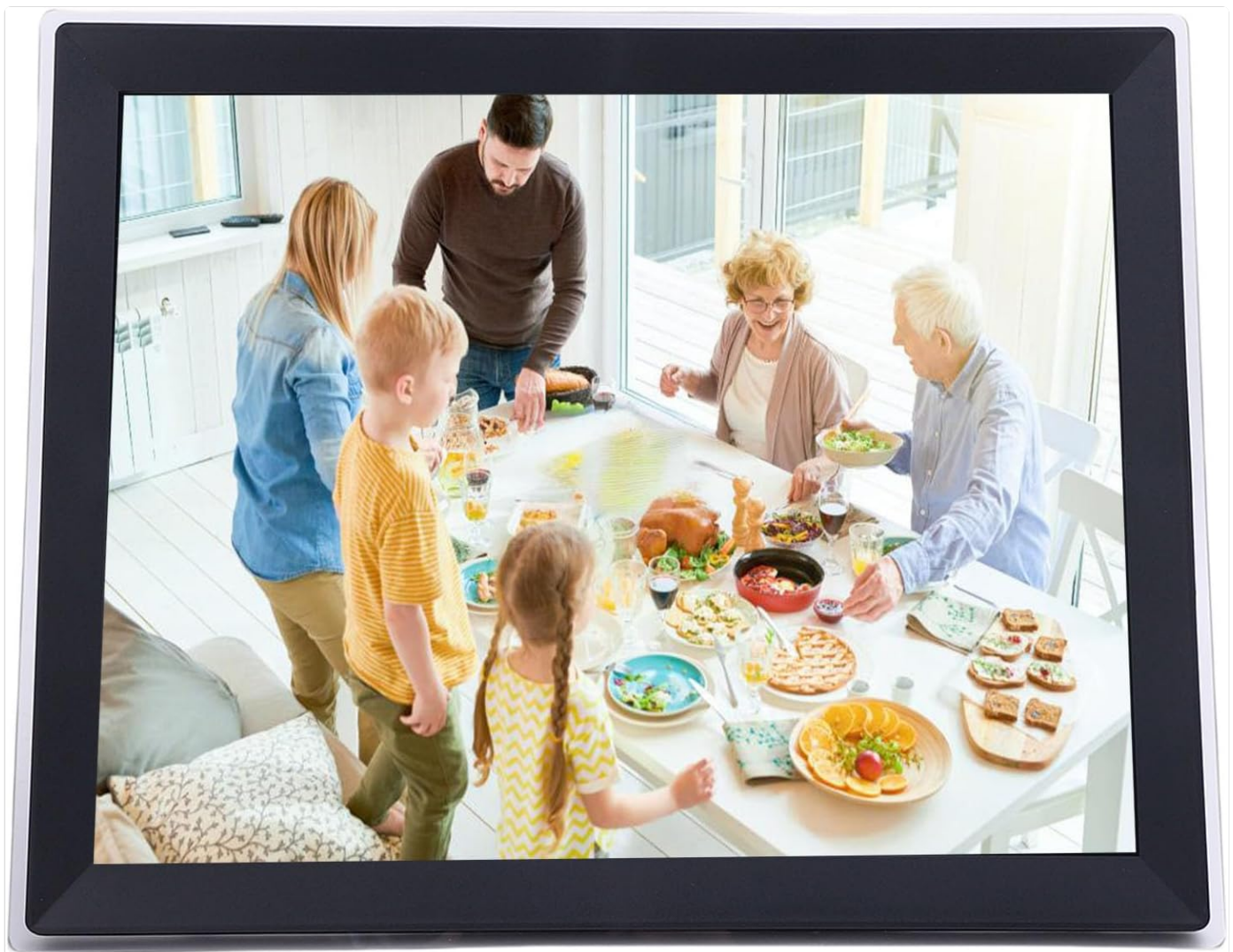
Image: The CCYLEZ 15 Inch WiFi Digital Picture Frame with its included stand and power adapter.