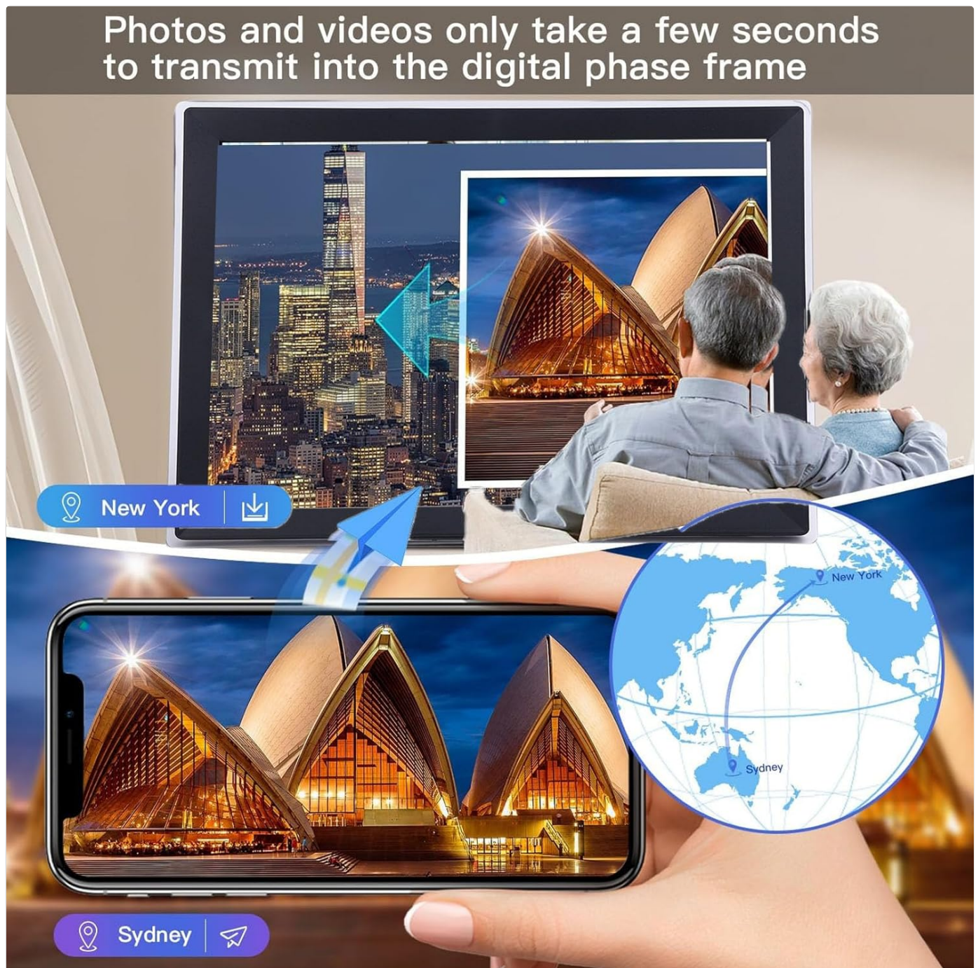
Image: Visual representation of photos and videos being transmitted quickly from a smartphone to the digital picture frame, illustrating remote sharing capabilities.