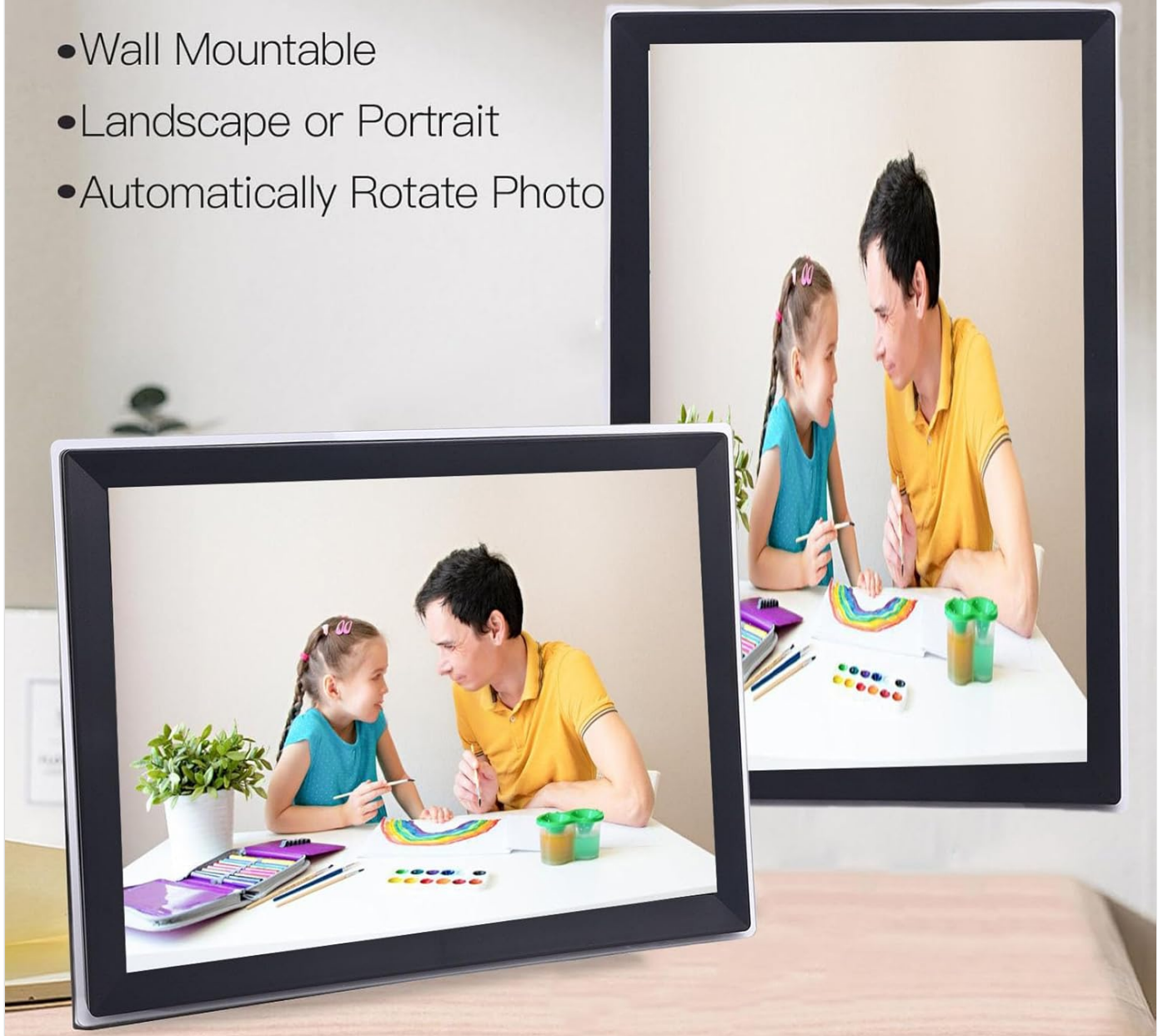
Image: The digital picture frame demonstrating its flexible placement options, including landscape and portrait orientations, and wall-mounting capability.