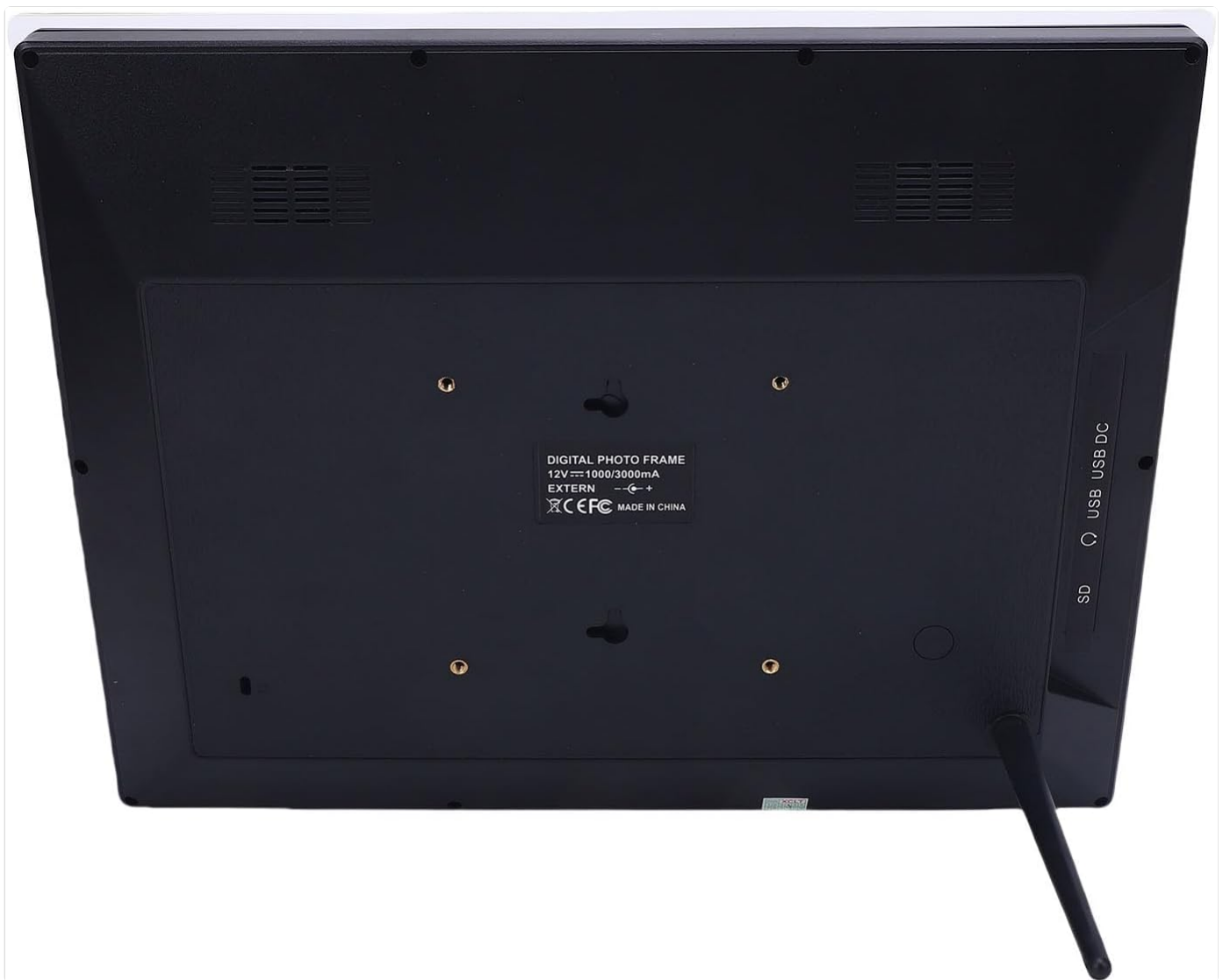
Image: Rear view of the digital picture frame, highlighting the various ports including USB, USB-C, 3.5mm headphone jack, DC power jack, and storage card slot.