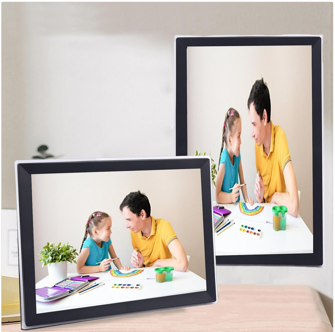
Image: The digital picture frame showcasing its auto-rotation capability, displaying the same image correctly in both landscape and portrait orientations.