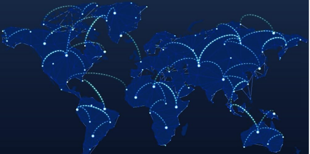
Image: A comprehensive list of the 142 languages supported for online translation by the T22 device.

Traveling the world when you say you will.