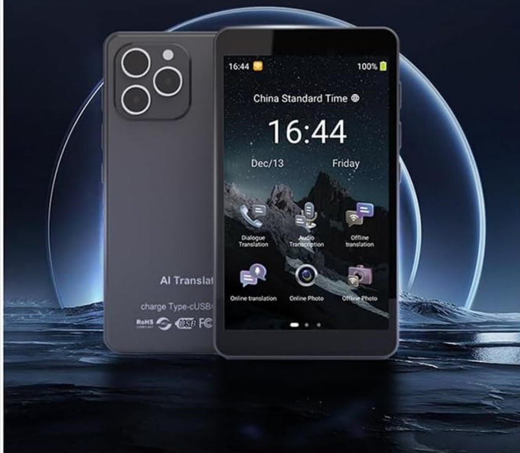
Image: The T22 Smart Translator highlighting its AI translation capabilities, showing both the front display and the rear camera design.