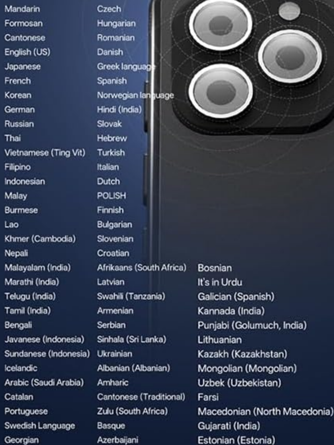
Image: A visual representation of the global reach of the T22 translator, supporting interpretation across 142 languages worldwide.