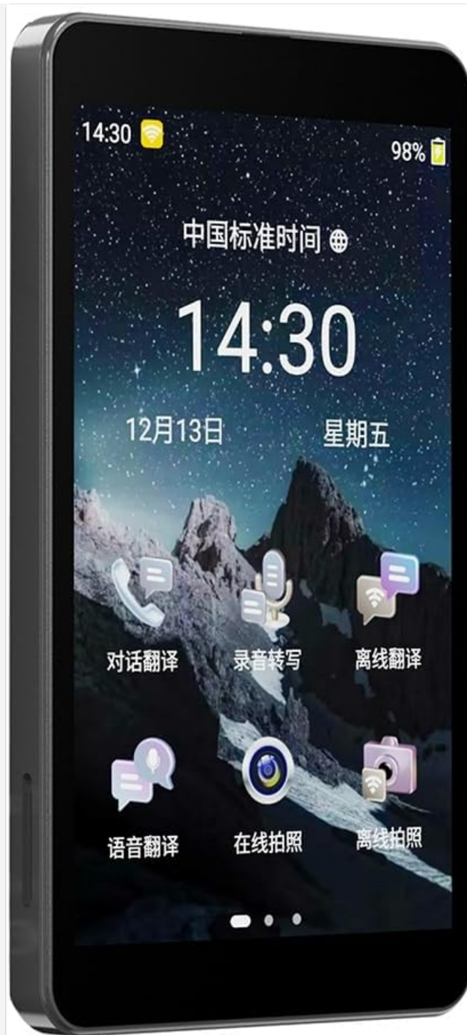
Image: Front view of the Uxsjakisd T22 Smart Translator, displaying its user interface with time and translation application icons.