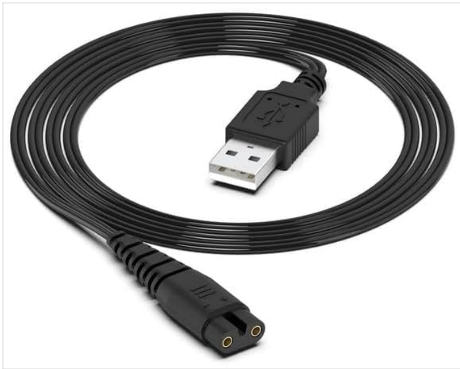
Image: The Pxdiiiry USB charger cord, neatly coiled, showcasing its durable black cable and standard USB-A connector on one end, and the two-prong charging connector on the other.