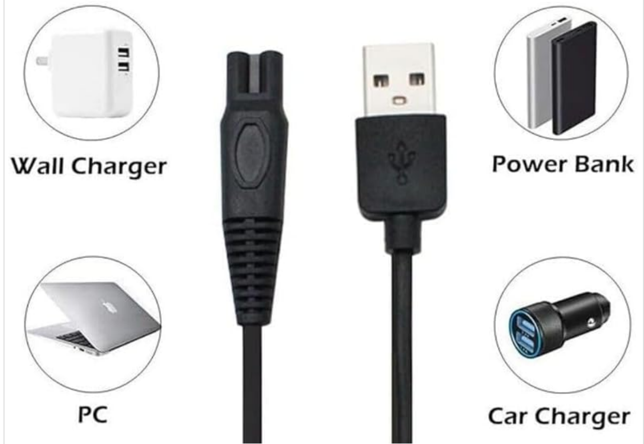
Image: This diagram displays common USB power sources compatible with the charger cord, including a wall charger adapter, a power bank, a personal computer (PC), and a car charger.