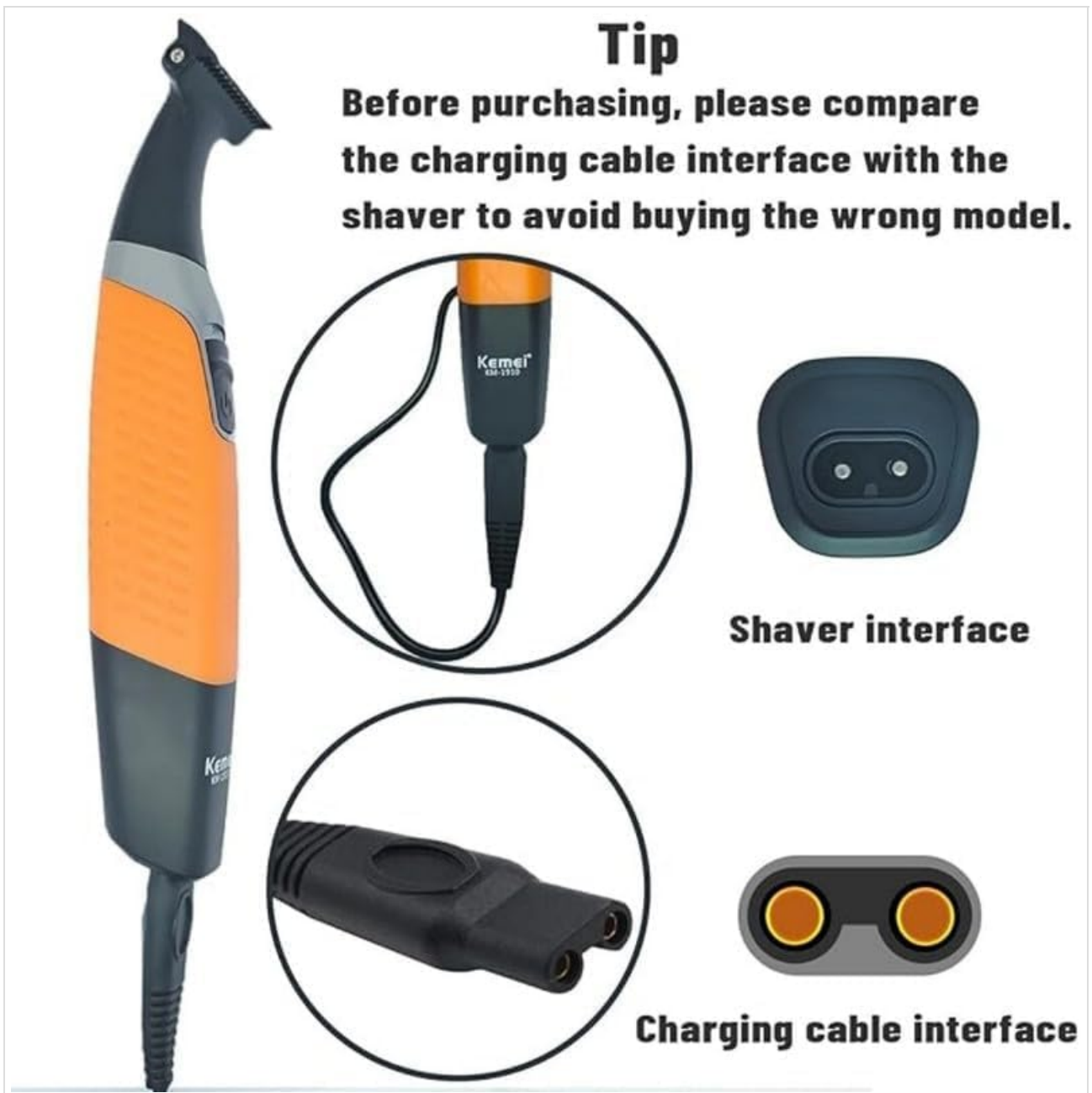
Image: A visual guide illustrating the shaver's charging interface and the corresponding two-prong charging cable interface. It emphasizes the importance of verifying compatibility before purchase and use.

3. Select a Power Source: The USB charger cord can be powered by various USB-compatible devices.