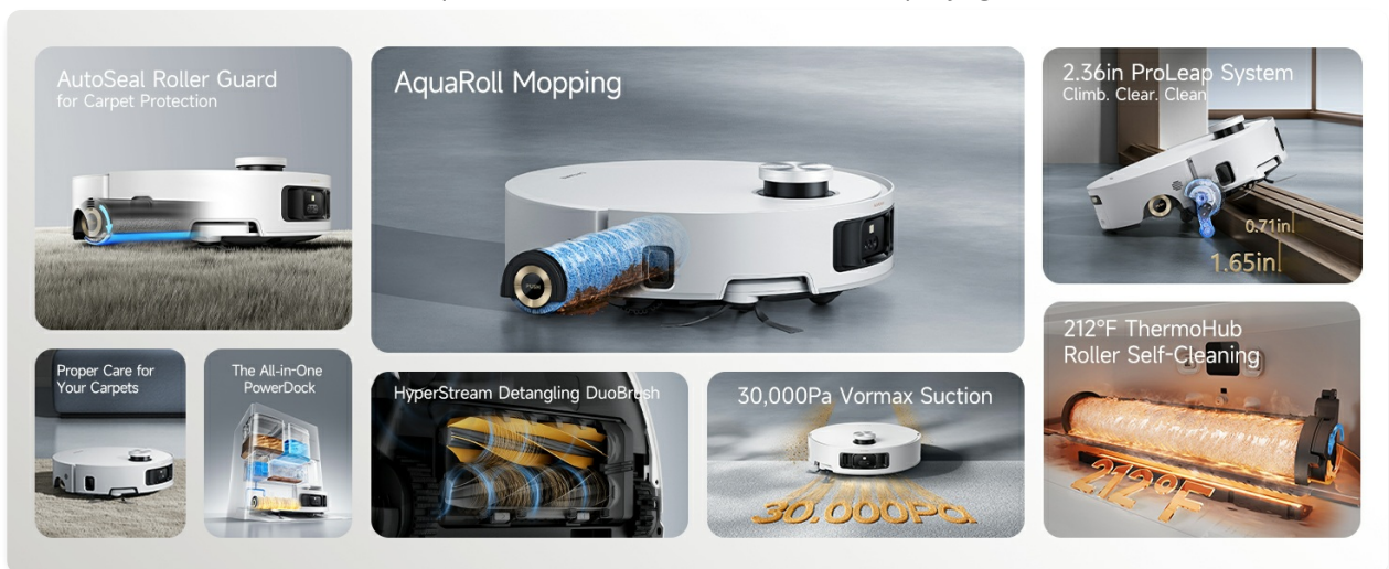
Detailed view of the AquaRoll mopping system, showing fresh water spray and dirty water collection.