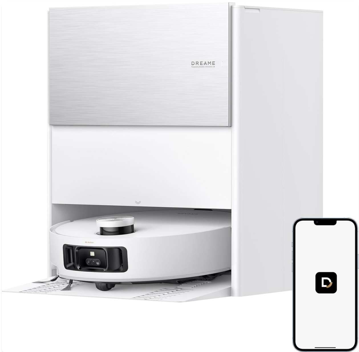
The DREAME Aqua10 Roller Robot Vacuum with its accompanying base station.