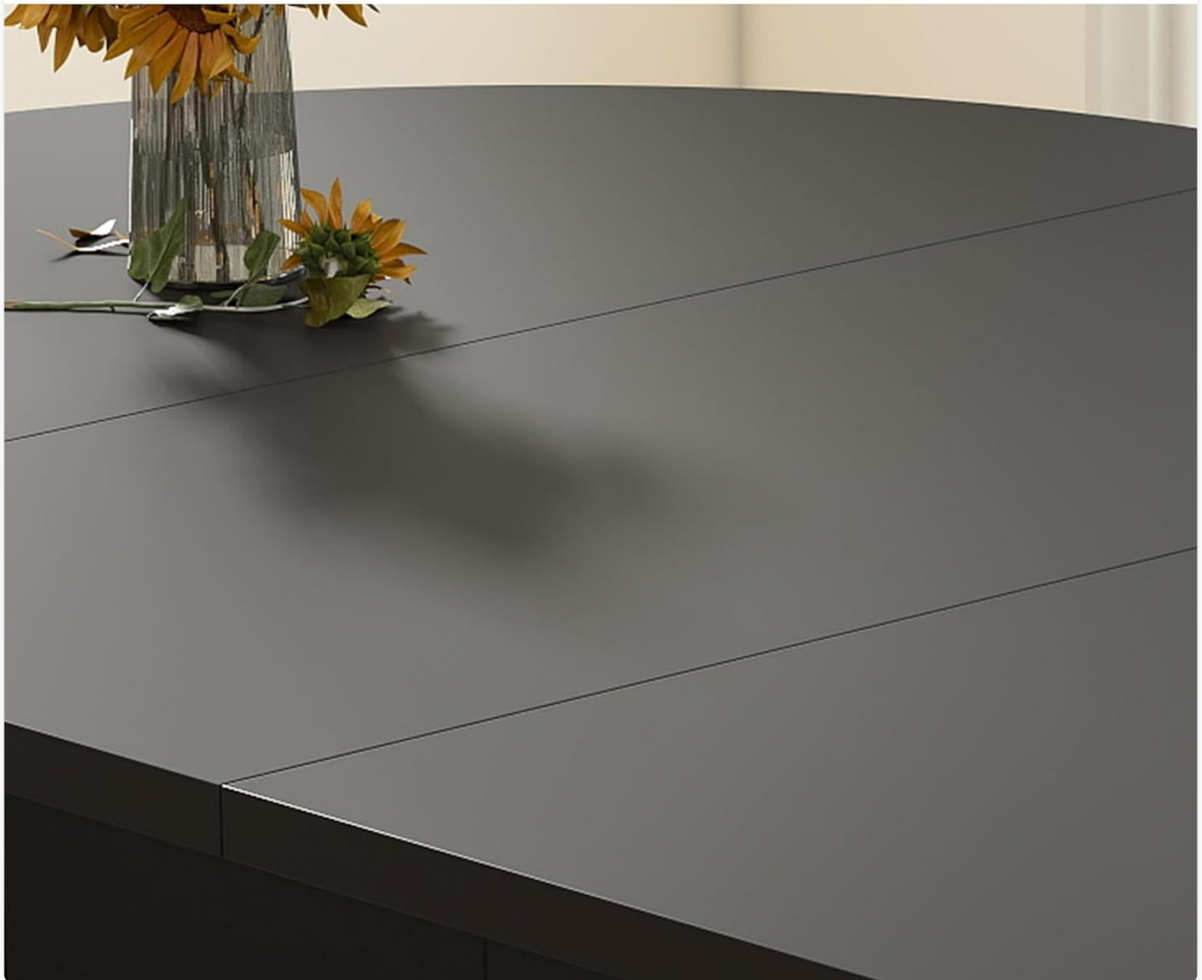
Image: The dining table shown in its three adjustable lengths: compact (round), medium (oval with one leaf), and fully extended (oval with two leaves), demonstrating its versatility.