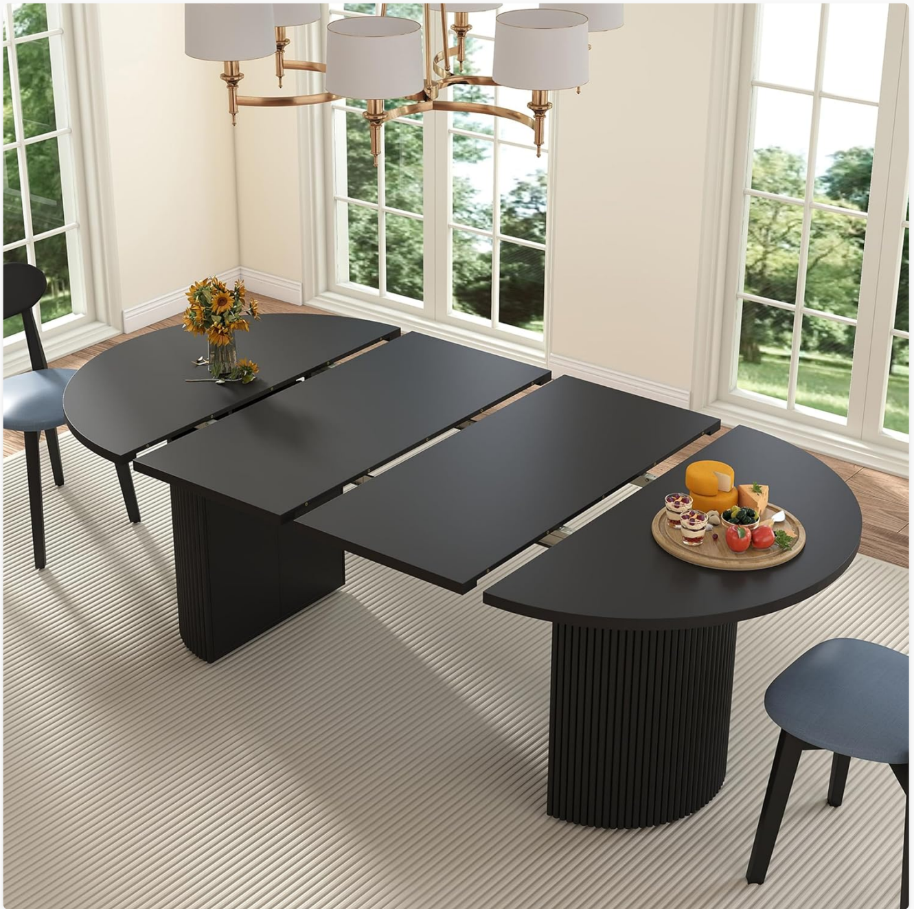
Image: The Weselon Extendable Dining Table shown in its fully extended oval configuration, featuring a sleek black finish and fluted base design.