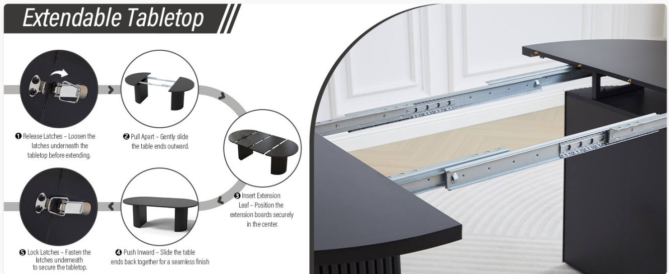
Image: Visual guide illustrating the five-step process for extending the dining table, highlighting the smooth sliding mechanism and locking latches.