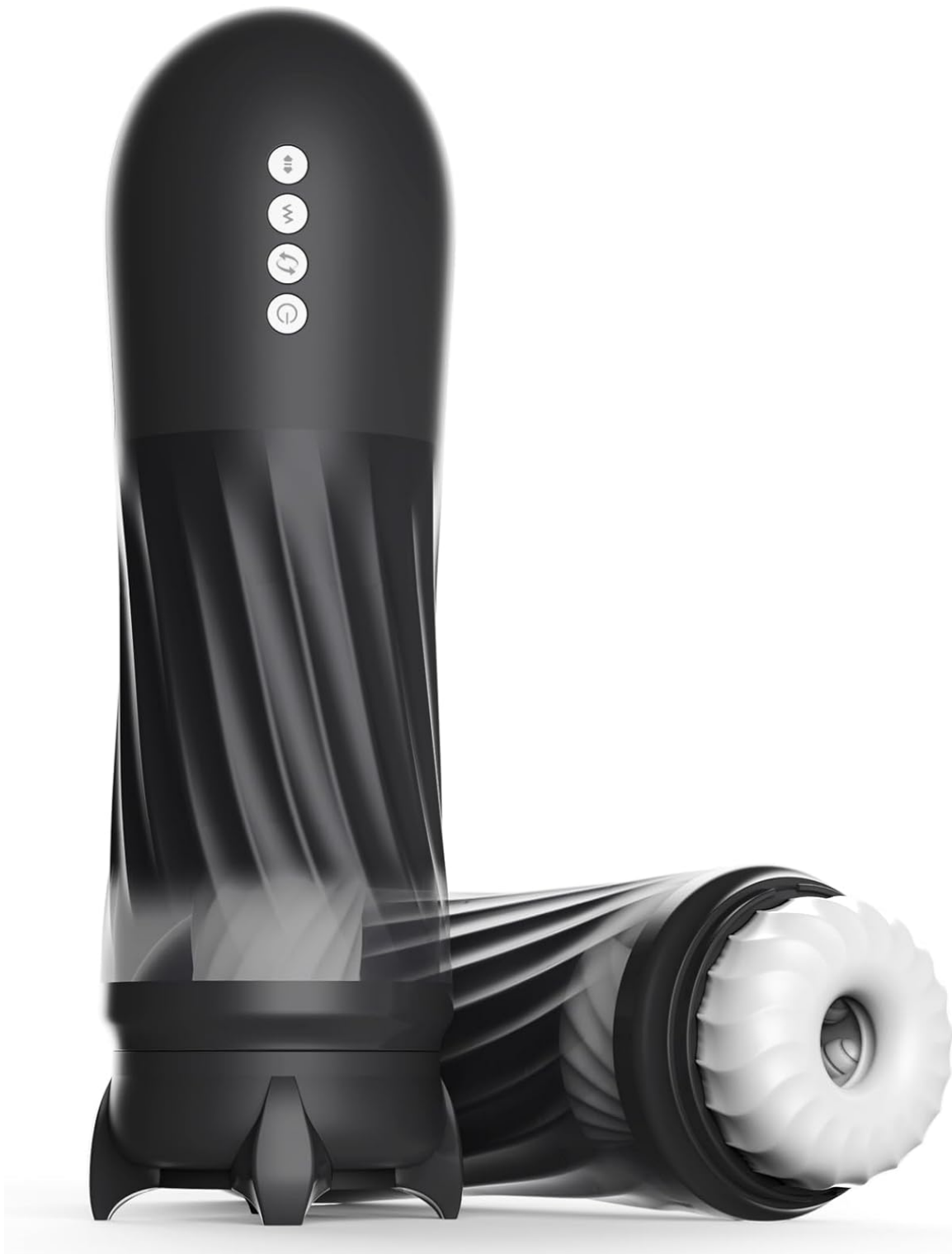
Image: The Steelcan Automatic Male Masturbator, showcasing its sleek black design and control buttons.