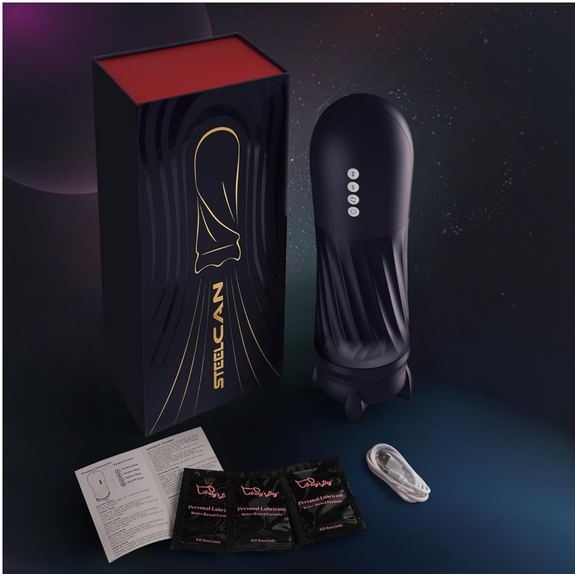
Image: The Steelcan product box, showing the device, USB charging cable, instruction manual, and lubricant packets included in the package.