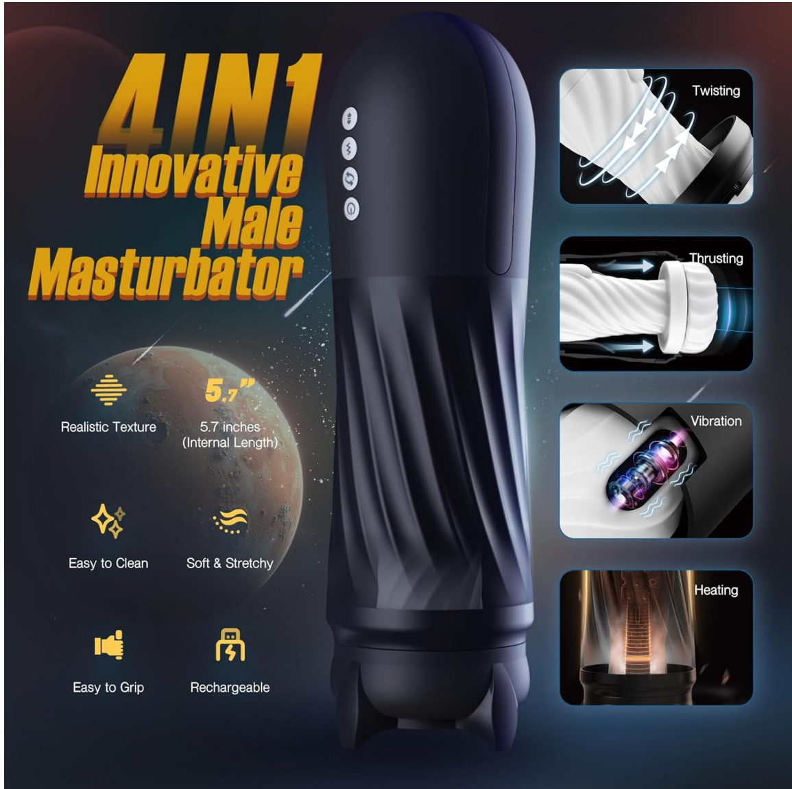
Image: Visual representation of the Steelcan's 4-in-1 features: twisting, thrusting, vibration, and heating, along with key benefits like realistic texture and easy cleaning.