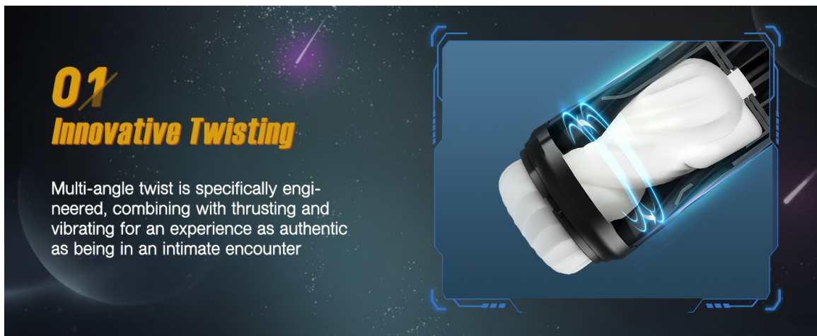
Image: Detailed specifications and dimensions of the Steelcan device.