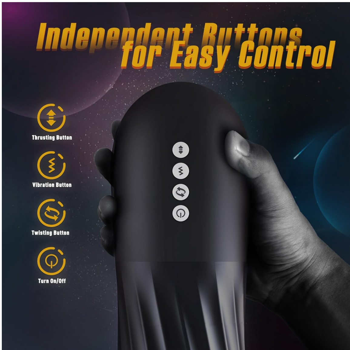
Image: Close-up of the Steelcan's control panel, highlighting the independent buttons for thrusting, vibration, twisting, and power.