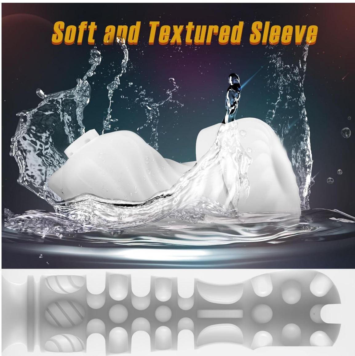
Image: The soft, textured inner sleeve of the Steelcan being cleaned under running water, demonstrating its detachable design for easy maintenance.