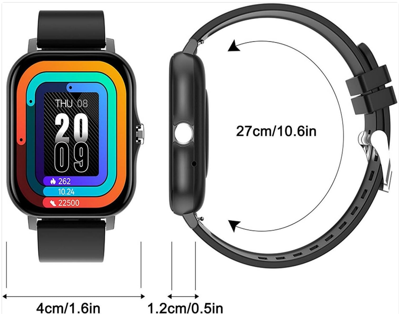
Image: A diagram illustrating the dimensions of the GT21 Y13 Smart Watch. The watch face measures approximately 4cm (1.6 inches) in width, the thickness is 1.2cm (0.5 inches), and the total circumference of the watch with the strap is 27cm (10.6 inches).