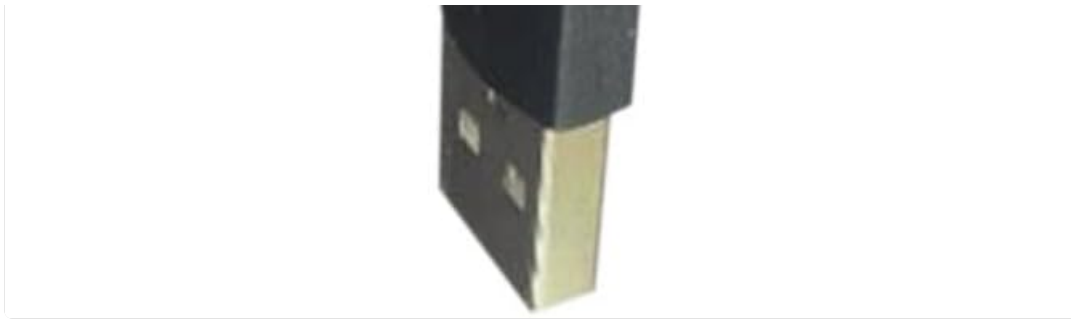
Image: The magnetic USB charging cable, showing the circular charging dock that attaches to the back of the smart watch and the standard USB-A connector.