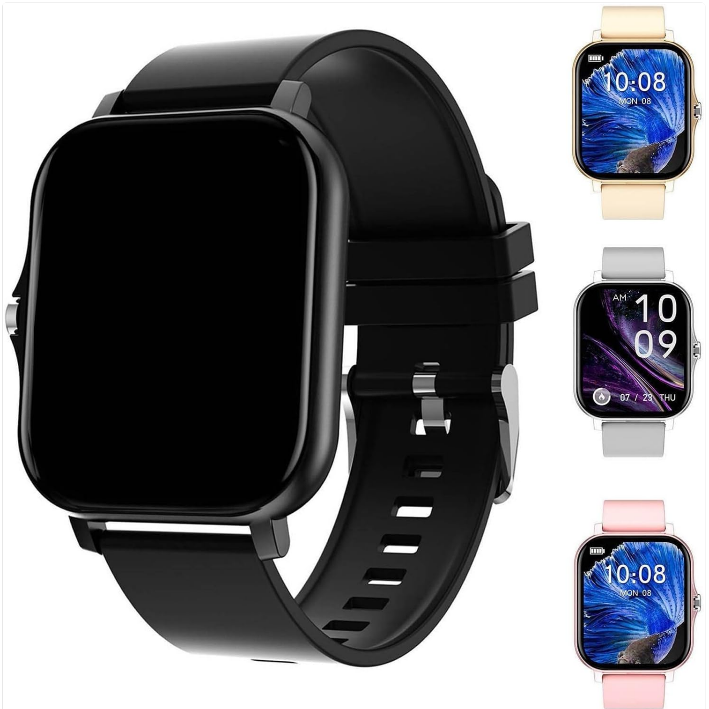
Image: The GT21 Y13 Smart Watch in black, showcasing its sleek design. Smaller images to the right display the watch in gold, silver, and pink variants, highlighting the customizable watch faces.