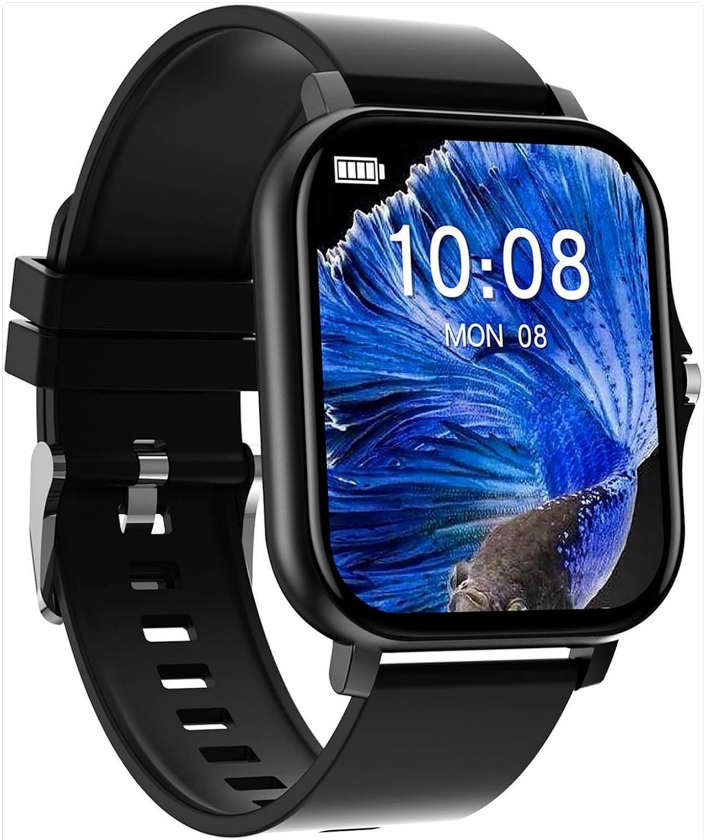
Image: The GT21 Y13 Smart Watch screen showing the time (10:08) and date (MON 08) with a vibrant blue fish as the background, demonstrating a typical watch face.