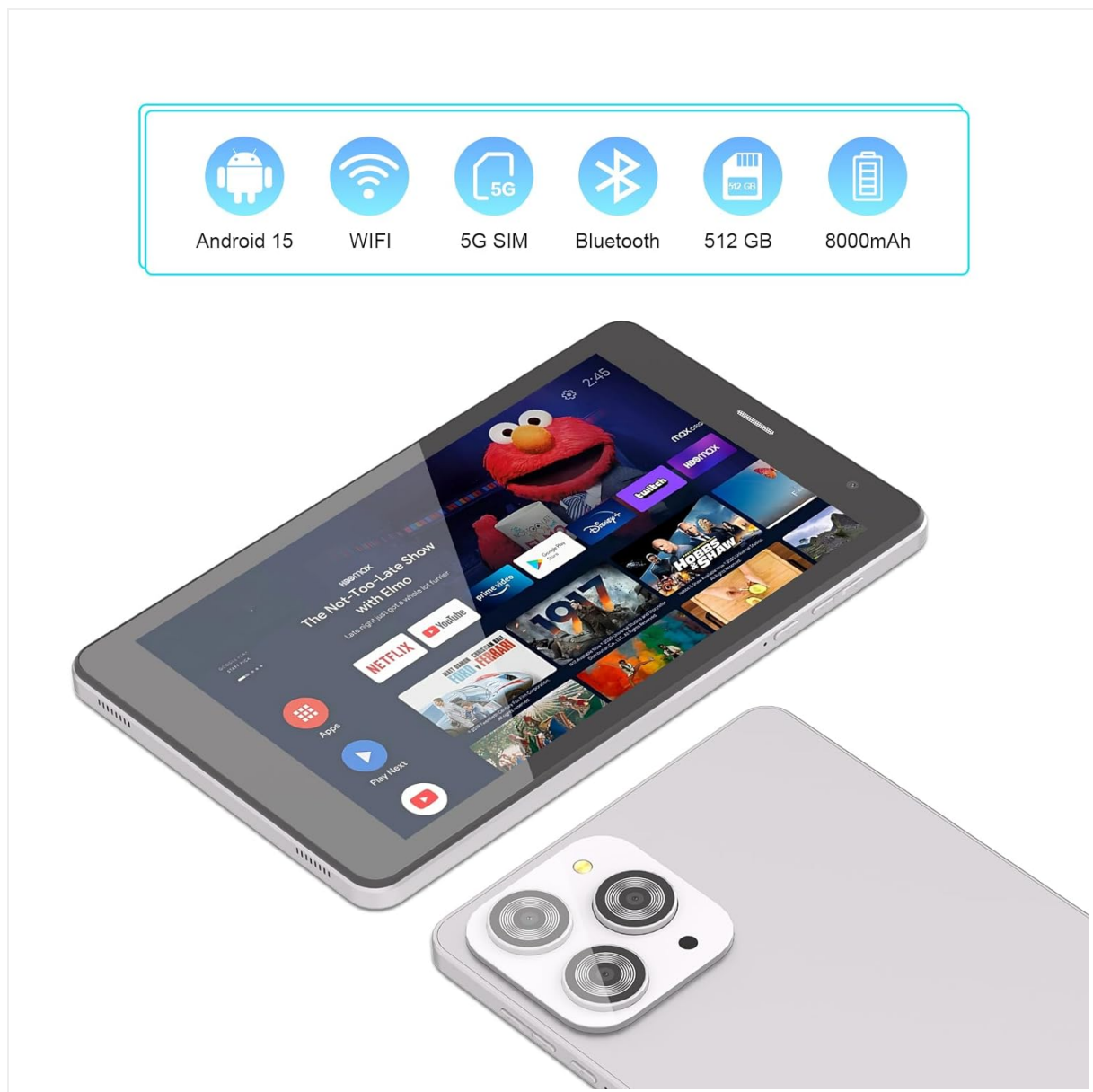
Image: The C idea CM817 Pro Max tablet showcasing its Android home screen, featuring various application icons and a clean user interface.