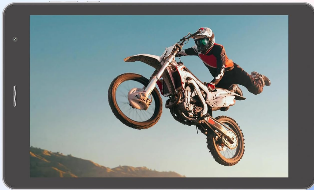
Image: The C idea CM817 Pro Max tablet showcasing its 8-inch IPS HD screen with a resolution of 800x1280 pixels, providing clear visuals.