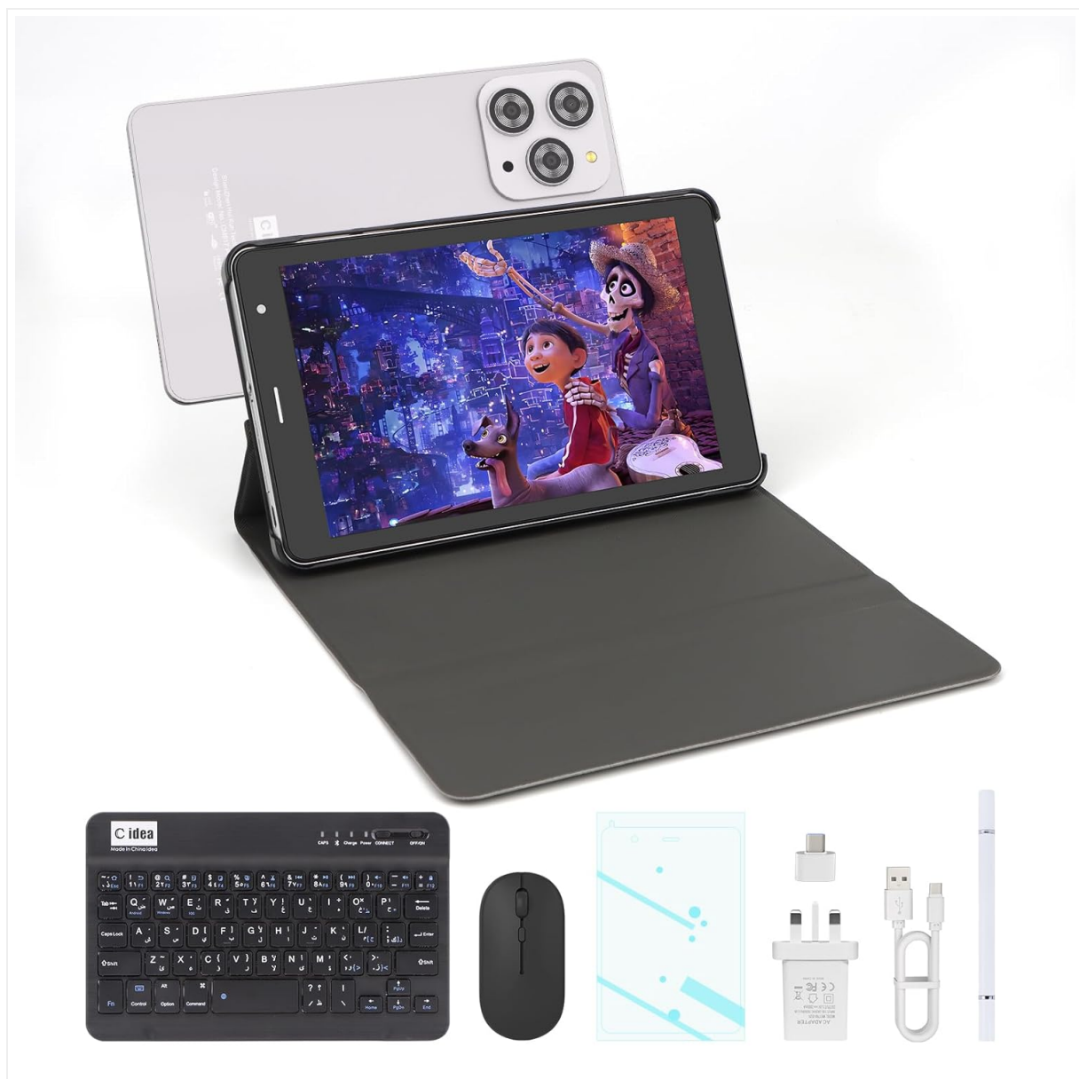
Image: The C idea CM817 Pro Max tablet shown with its common accessories, which may include a keyboard, mouse, charging adapter, USB-C cable, and stylus pen.