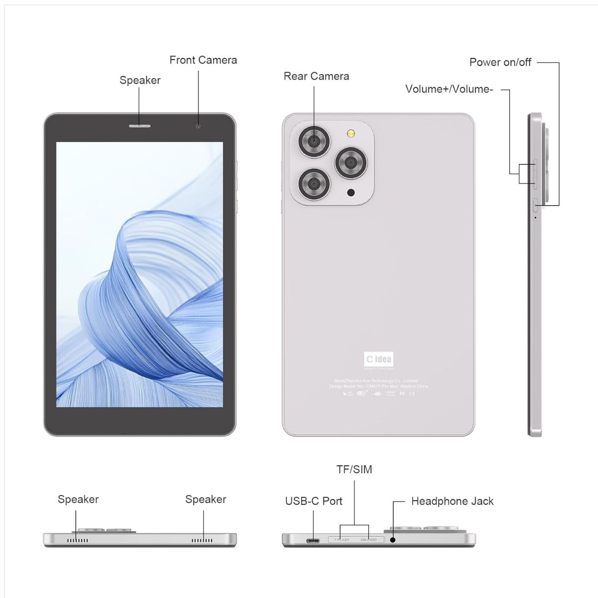
Image: A diagram illustrating the various ports and buttons on the C idea CM817 Pro Max tablet, including the front camera, rear camera, power button, volume controls, speakers, TF/SIM card slot, USB-C port, and headphone jack.