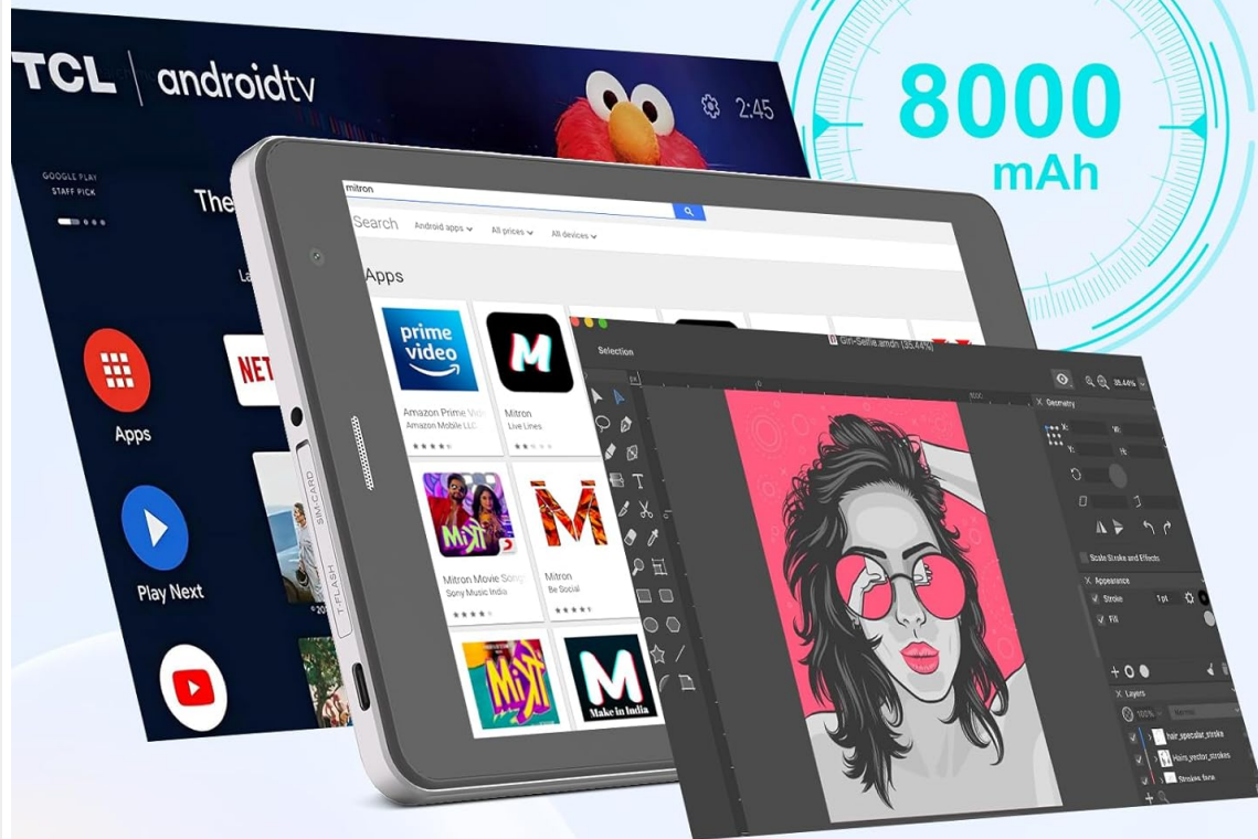
Image: The C idea CM817 Pro Max tablet, emphasizing its 8000mAh large capacity battery, designed for extended operational hours.