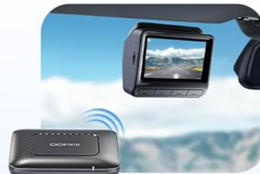
Image: Visual guide to remote photo capture, GPS tracking, and remote wake-up functions.

Remotely wake up your dashcam even in sleep mode.