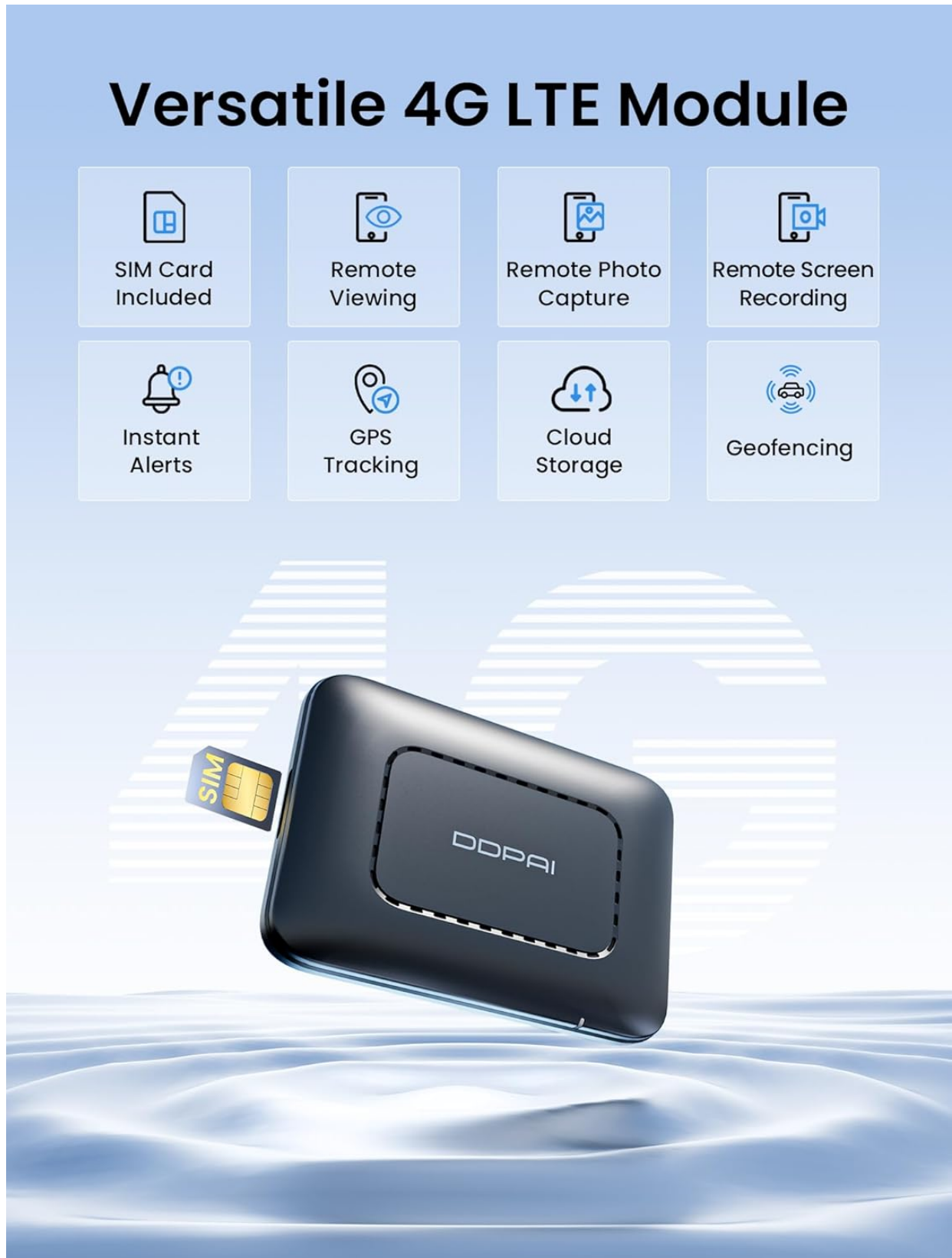
Image: The DDPAI 4G LTE Module with icons representing its core functionalities.