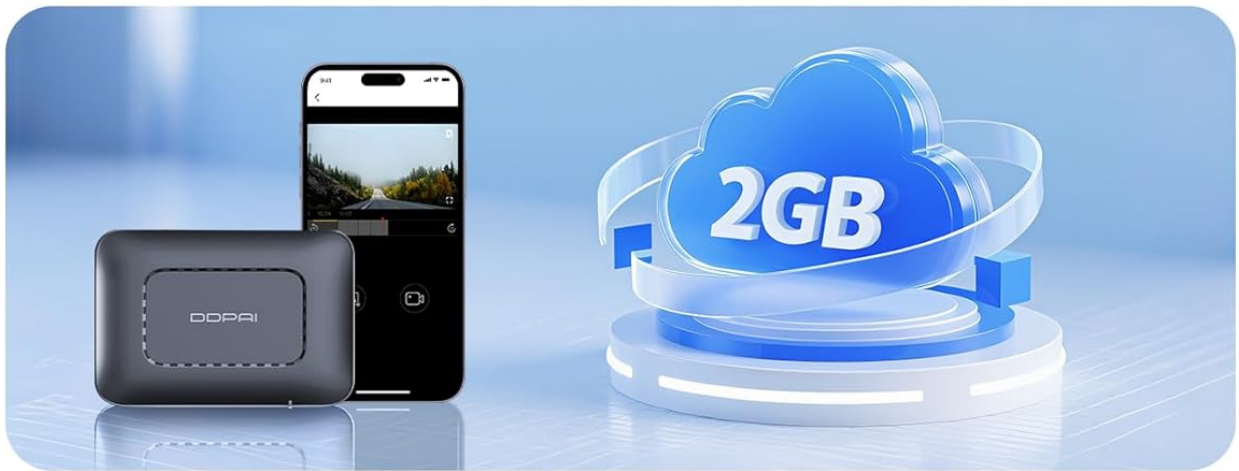
Image: The 4G LTE Module illustrating its smart cloud storage feature.