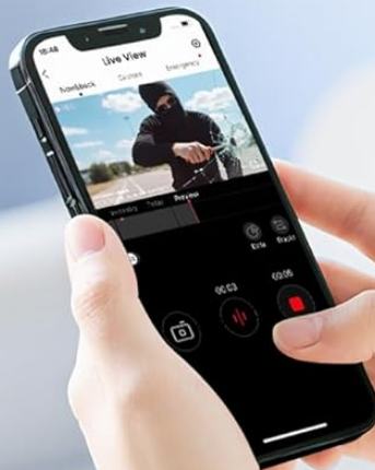
Image: Remote live preview of dash cam footage on a smartphone.