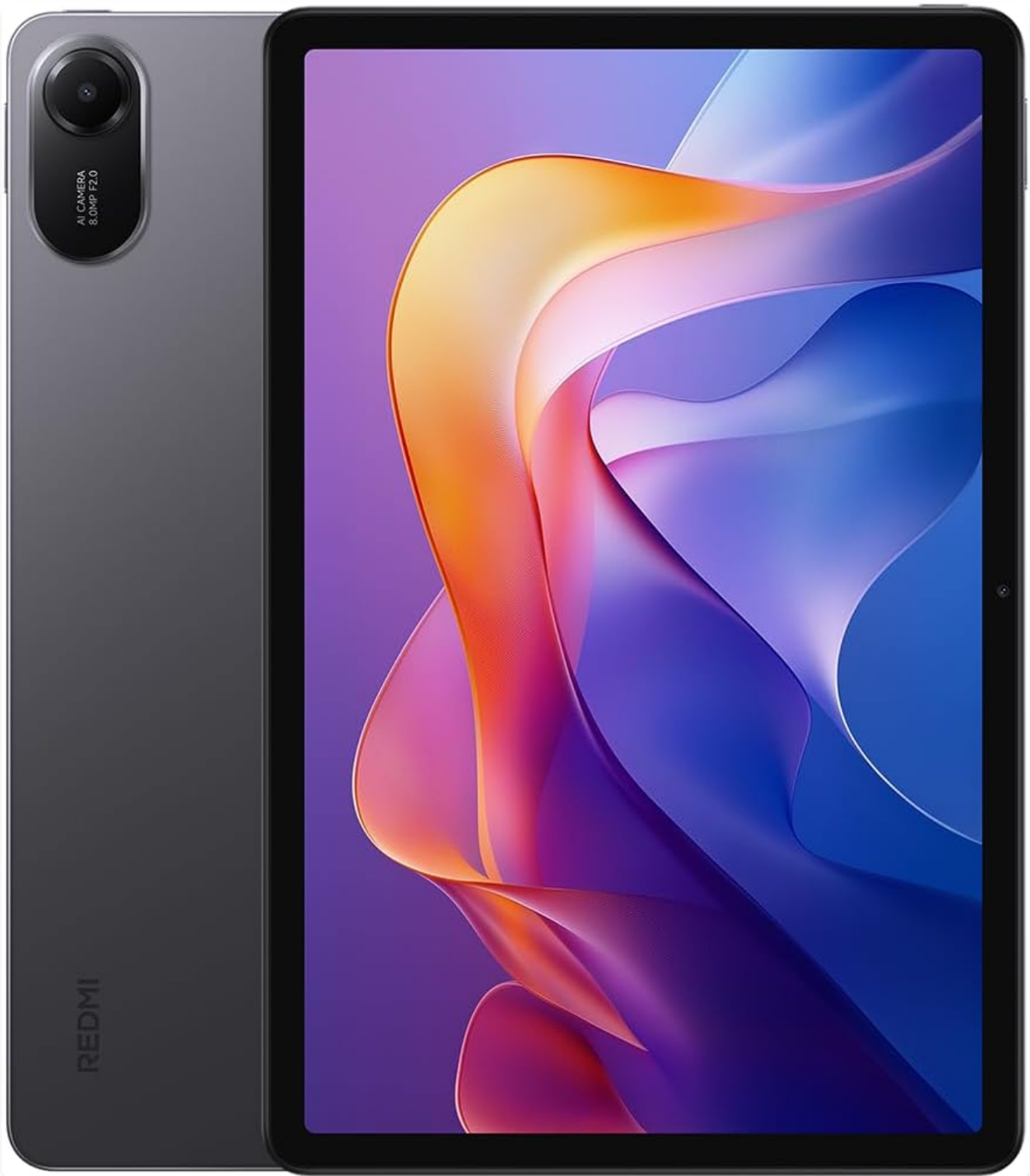
Figure 1.1: Xiaomi Redmi Pad 2 Tablet

This image displays the Xiaomi Redmi Pad 2 tablet from both the front and back, highlighting its sleek design and camera module.