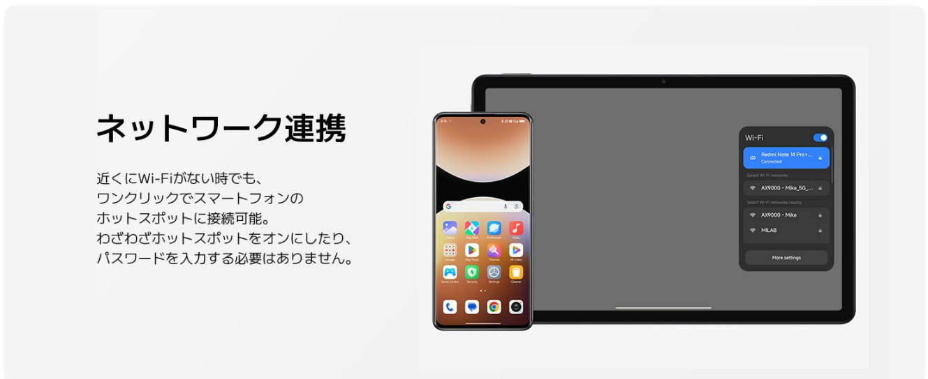
Figure 4.1: Network Interconnectivity

This image demonstrates the network interconnectivity feature, allowing the tablet to easily connect to a smartphone's hotspot.