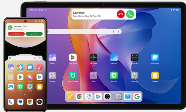
Figure 4.2: Communication Interconnectivity

シームレスな通話対応：スマートフォンに着信した通話をタブレット上で直接受けることができ、音声通話をスムーズにデバイス間で切り替えられます。