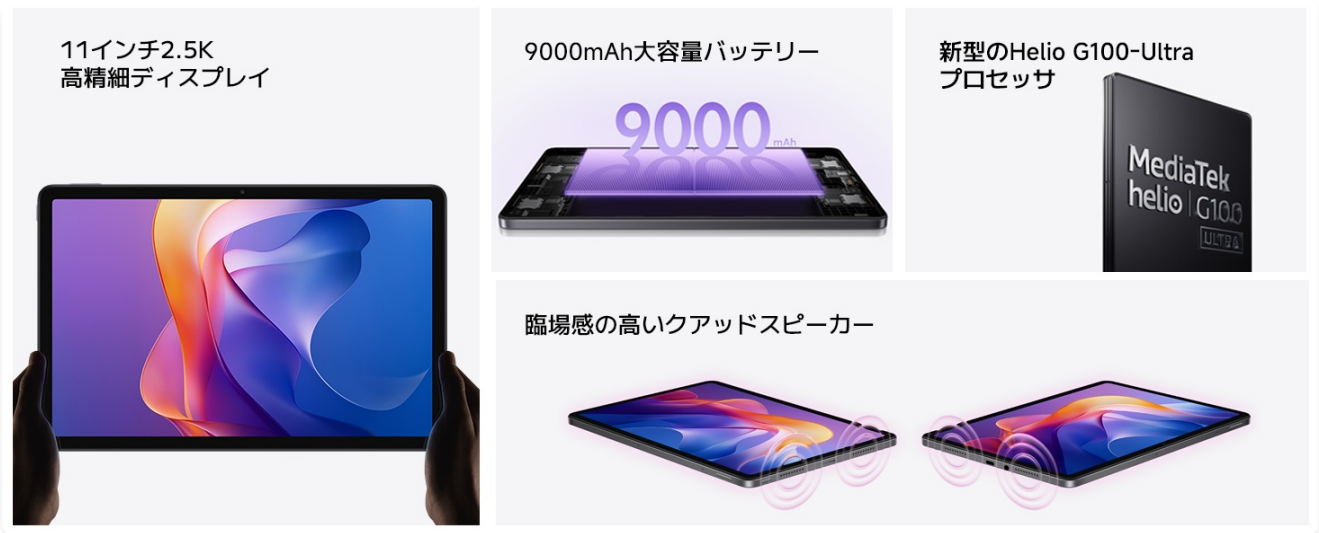
Figure 2.1: Key Features Overview

This image provides a visual summary of the Redmi Pad 2's main features, including its display, battery, processor, and speaker system.