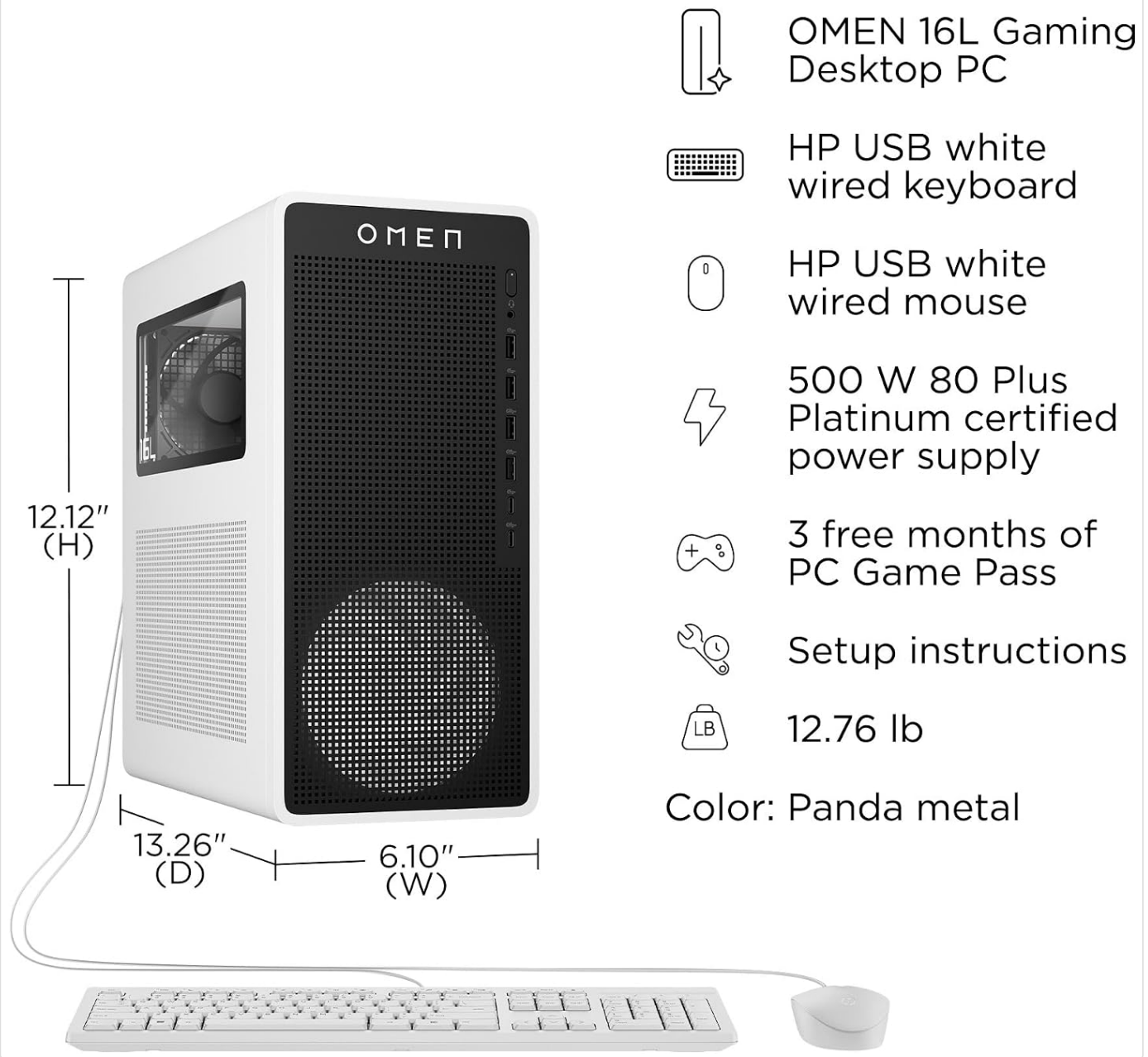
Image: The OMEN 16L Gaming Desktop PC, along with the included HP USB white wired keyboard and mouse, and a list of package contents.