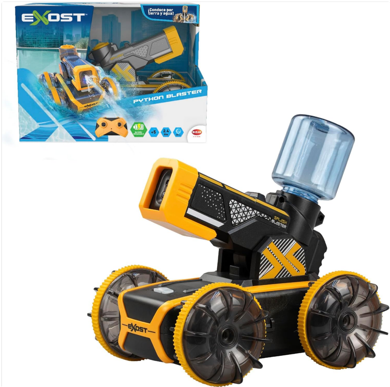
Image: The Bizak Exost Phyton Blaster vehicle, its remote control, and the product packaging, illustrating the complete set.