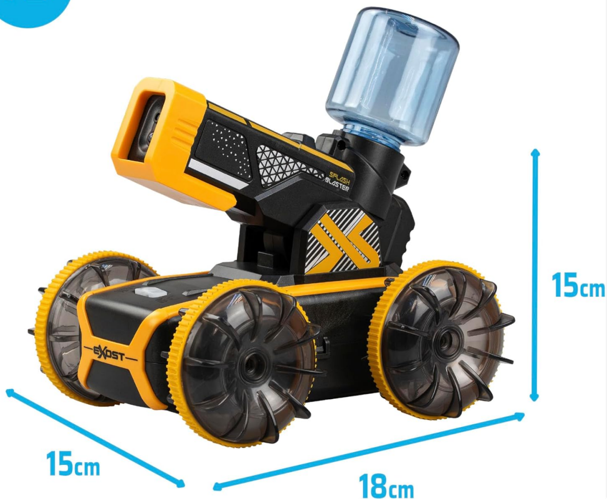
Image: The Bizak Exost Phyton Blaster vehicle with its approximate dimensions (15cm height, 15cm width, 18cm length) clearly marked.