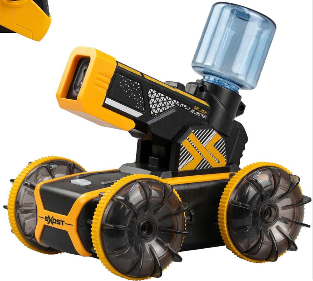
Image: The Bizak Exost Phyton Blaster vehicle alongside its remote control, emphasizing its 2.4 GHz technology and the availability of two speed settings.