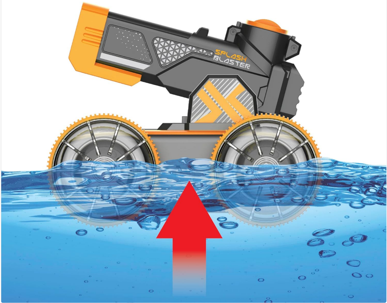
Image: The Bizak Exost Phyton Blaster demonstrating its automatic water refill capability by suction from a water surface.