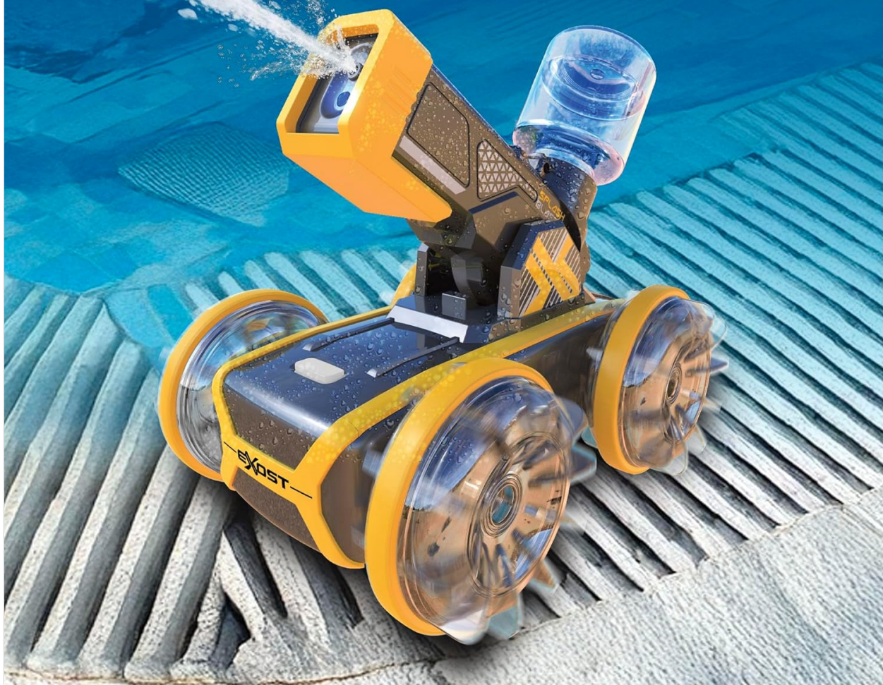
Image: The Bizak Exost Phyton Blaster vehicle actively shooting a stream of water while operating on a wet surface.