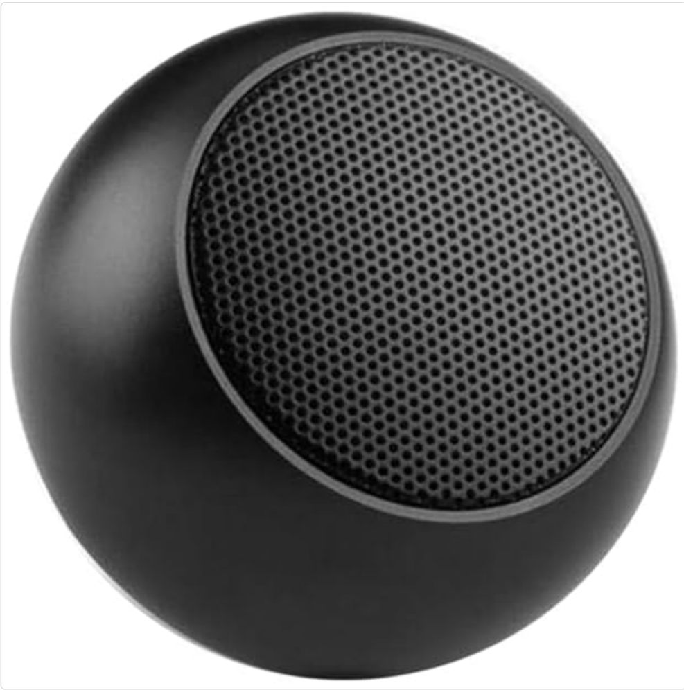
Figure 2.1: Front view of the Cwmiibili M3 Mini Wireless Bluetooth Speaker. This compact, spherical black Bluetooth speaker features a metallic mesh grille on the front.