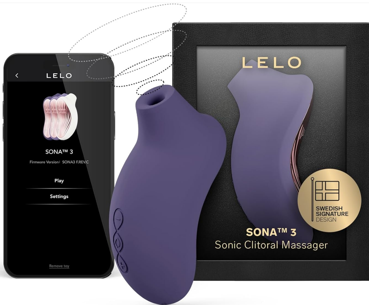
Image: The LELO SONA 3 device in Cyber Purple, shown alongside a smartphone connected to the LELO app and its elegant packaging.