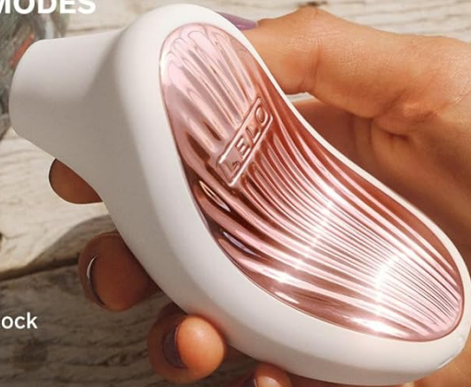
Image: A close-up of the LELO SONA 3 in hand, illustrating the button functions for power, mode selection, and intensity adjustment.

connect your device via Bluetooth to unlock additional modes