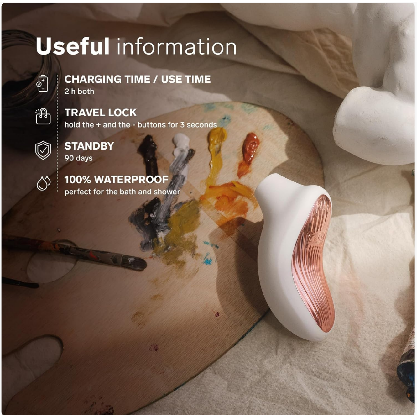
Image: Visual guide highlighting useful information such as 2-hour charging/use time, 90-day standby, travel lock function, and 100% waterproof design.