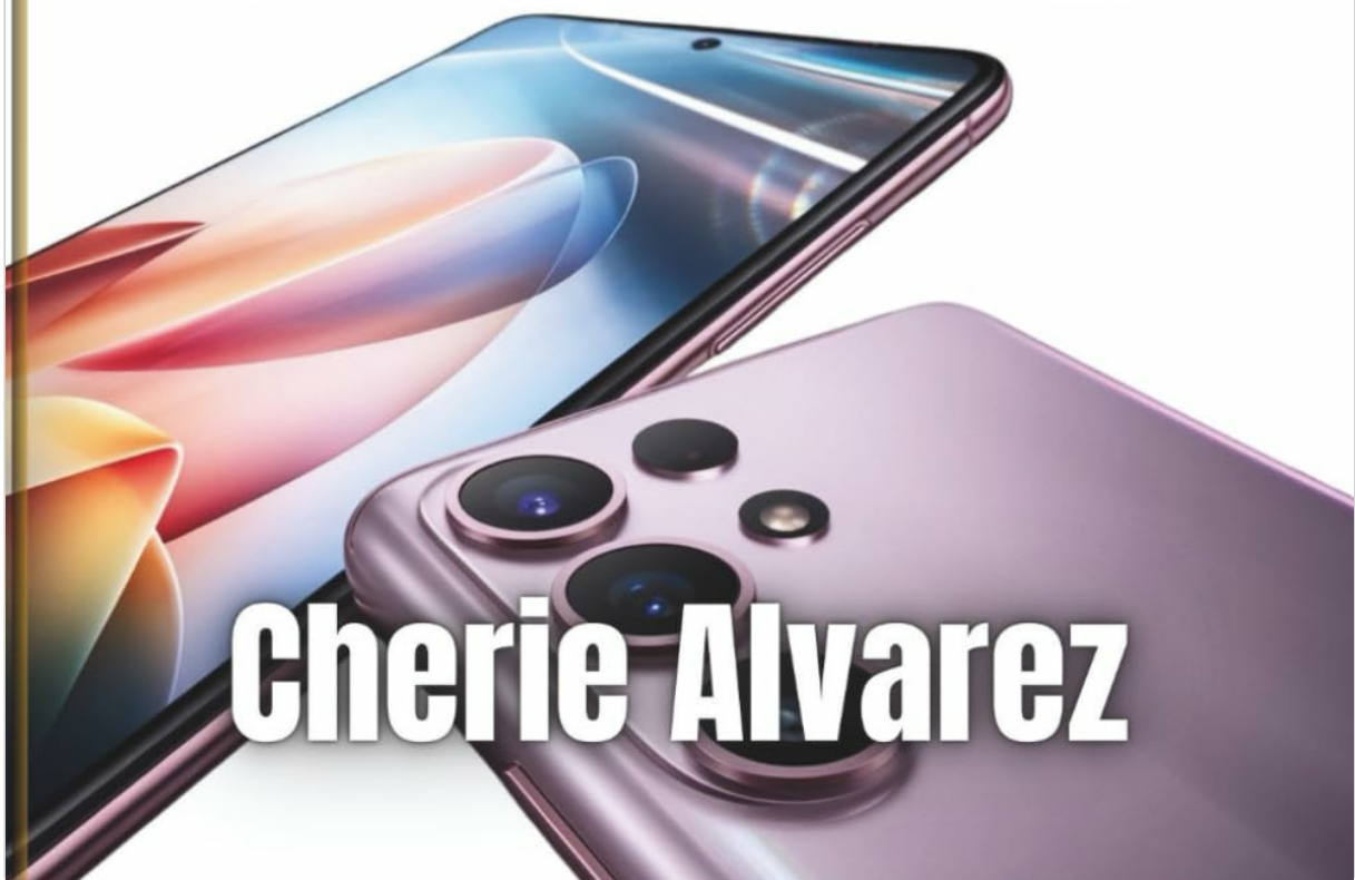
Image 1: Front cover of the Samsung Galaxy S25 Plus User Guide book. This image displays the title and author of the manual.