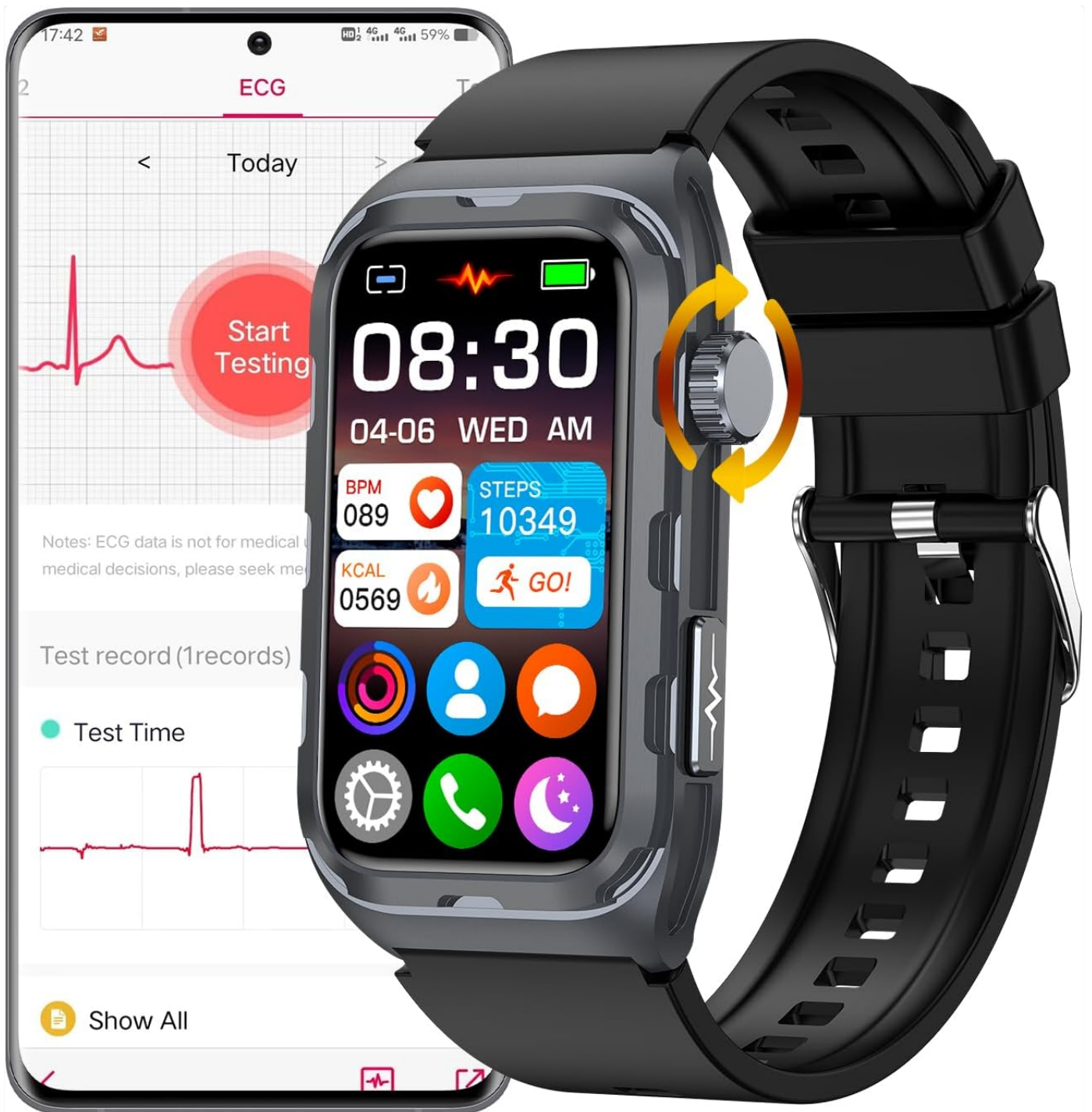
Image 1.1: DigiKuber Smartwatch TK79 with accompanying app interface.