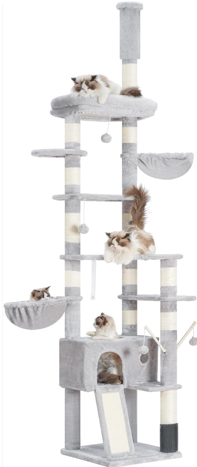
Figure 4.1: An overall view of the Hey-brother OMPJ091W Cat Tree, demonstrating its various levels, scratching posts, cave, and baskets in use by multiple cats. This illustrates the product's intended functionality and appeal to feline companions.