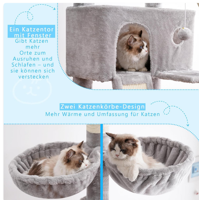
Figure 4.2: Detail of the integrated cat cave and one of the soft cat baskets. These features provide secure and comfortable resting places, catering to a cat's natural desire for enclosed spaces and elevated lounging.