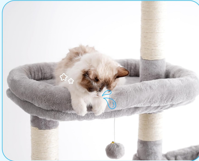
Figure 4.4: A cat comfortably resting on the soft, padded top platform. This elevated position offers a secure and cozy spot for cats to relax and survey their surroundings.

Kätzchen können darauf ruhen und sich wälzen