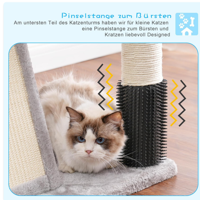
Figure 4.3: A cat interacting with the brushing post located at the base of the tree. This feature allows cats to groom themselves and provides an additional sensory experience.