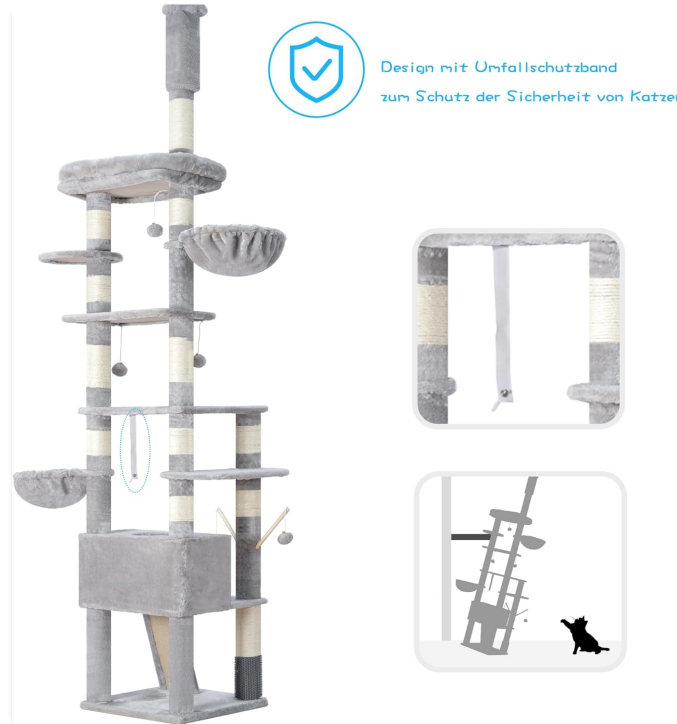
Figure 2.1: Illustration of the anti-tip strap installation. The strap secures the cat tree to the wall, preventing it from falling over and ensuring the safety of your pets.