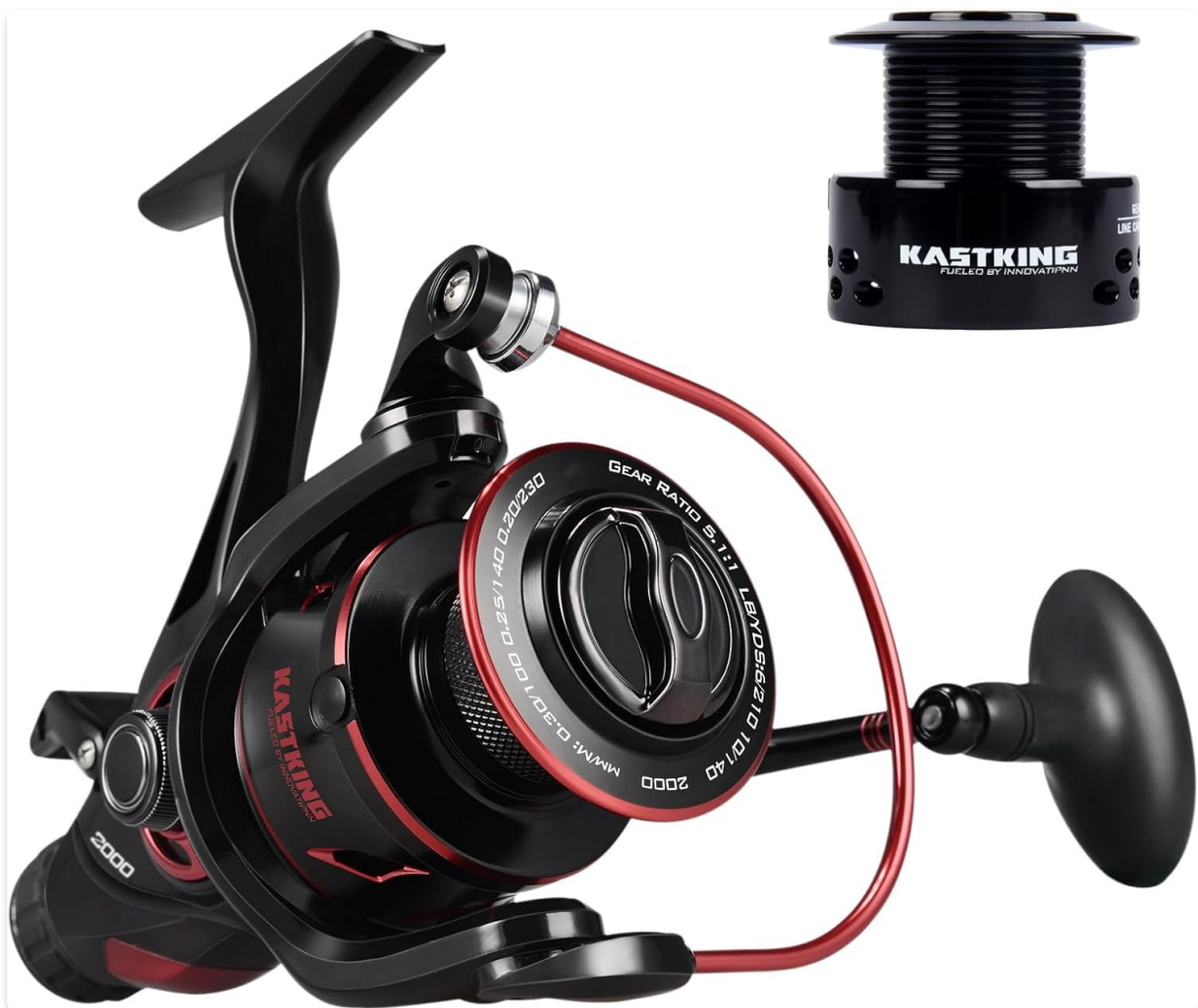
Image: The KastKing Sharky Baitfeeder III Spinning Reel, showcasing its sleek black and red design with a spare spool.