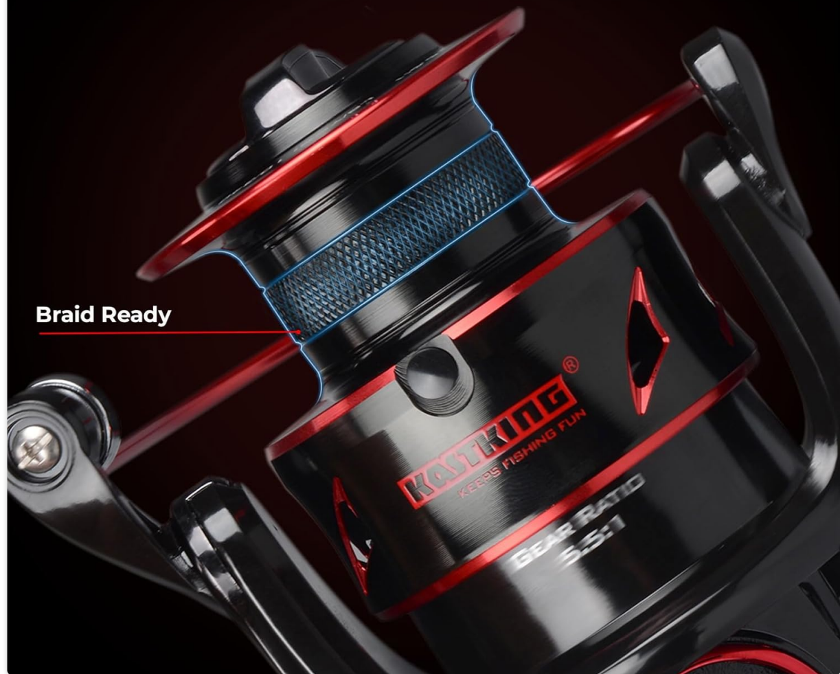
Image: Close-up of the Sharky Fin Power Spool, highlighting its braid-ready design for direct braid line tying.