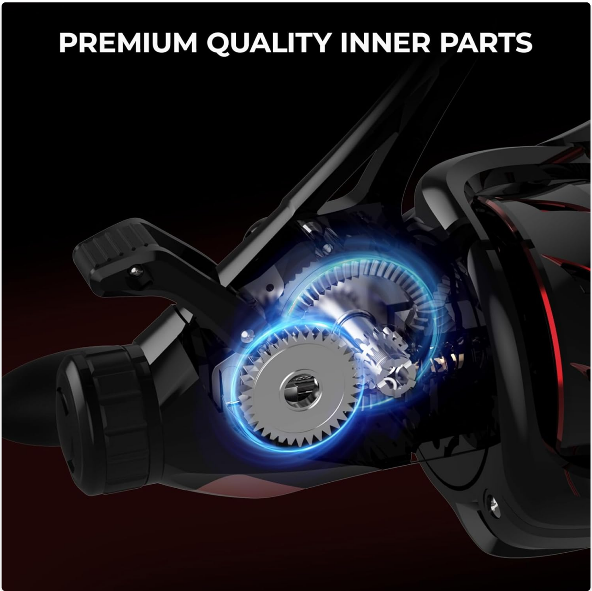
Image: Diagram showing the placement of the 10+1 shielded stainless steel ball bearings for ultra-smooth casting and retrieval.