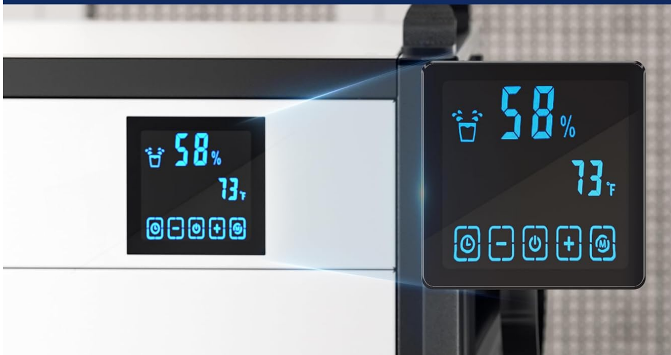
Image: The dehumidifier's optional remote control panel, showing its display and buttons for remote operation and monitoring of humidity and temperature.