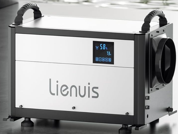
Image: The Lienuis 110 Pints Commercial Dehumidifier, showcasing its compact design and digital display.