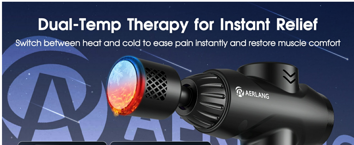
Image: Hot and Cold Head with icons for cold (snowflake) and hot (sun) settings, indicating temperature ranges.

To activate the hot or cold function, press and hold the respective button on the hot/cold head. Tap the button to cycle through the temperature levels. Ensure the head is charged for optimal performance.