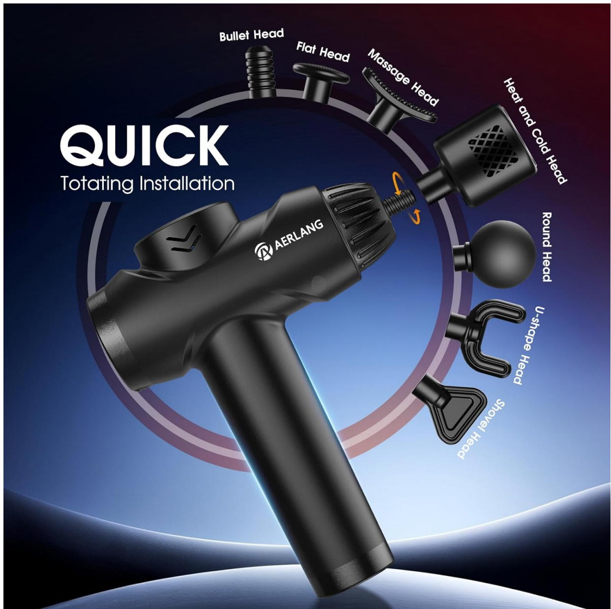
Image: AERLANG Massage Gun with all 7 interchangeable massage heads and carrying case.