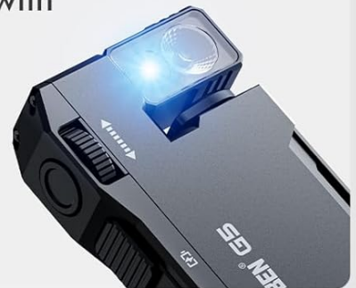
Image: Overview of WUBEN G5 features, including 400 lumens max brightness, compact size (compared to a lighter), 3 click modes, and 10 lumens RGB rainbow single light.