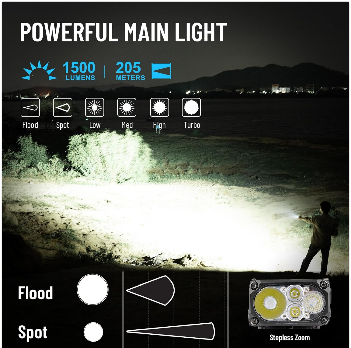
Image: Illustration of the WUBEN X2Pro's powerful main light, showing 1500 lumens, 205 meters beam distance, and various modes including Flood, Spot, Low, Medium, High, and Turbo.