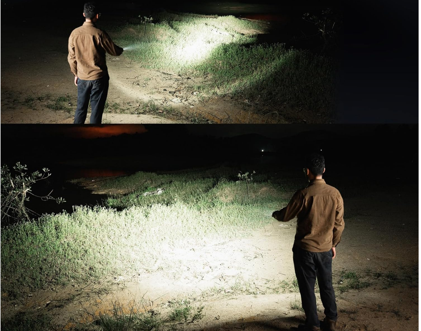
Image: The WUBEN X2Pro demonstrating its stepless zoom capability, transitioning between a wide floodlight and a focused spotlight.