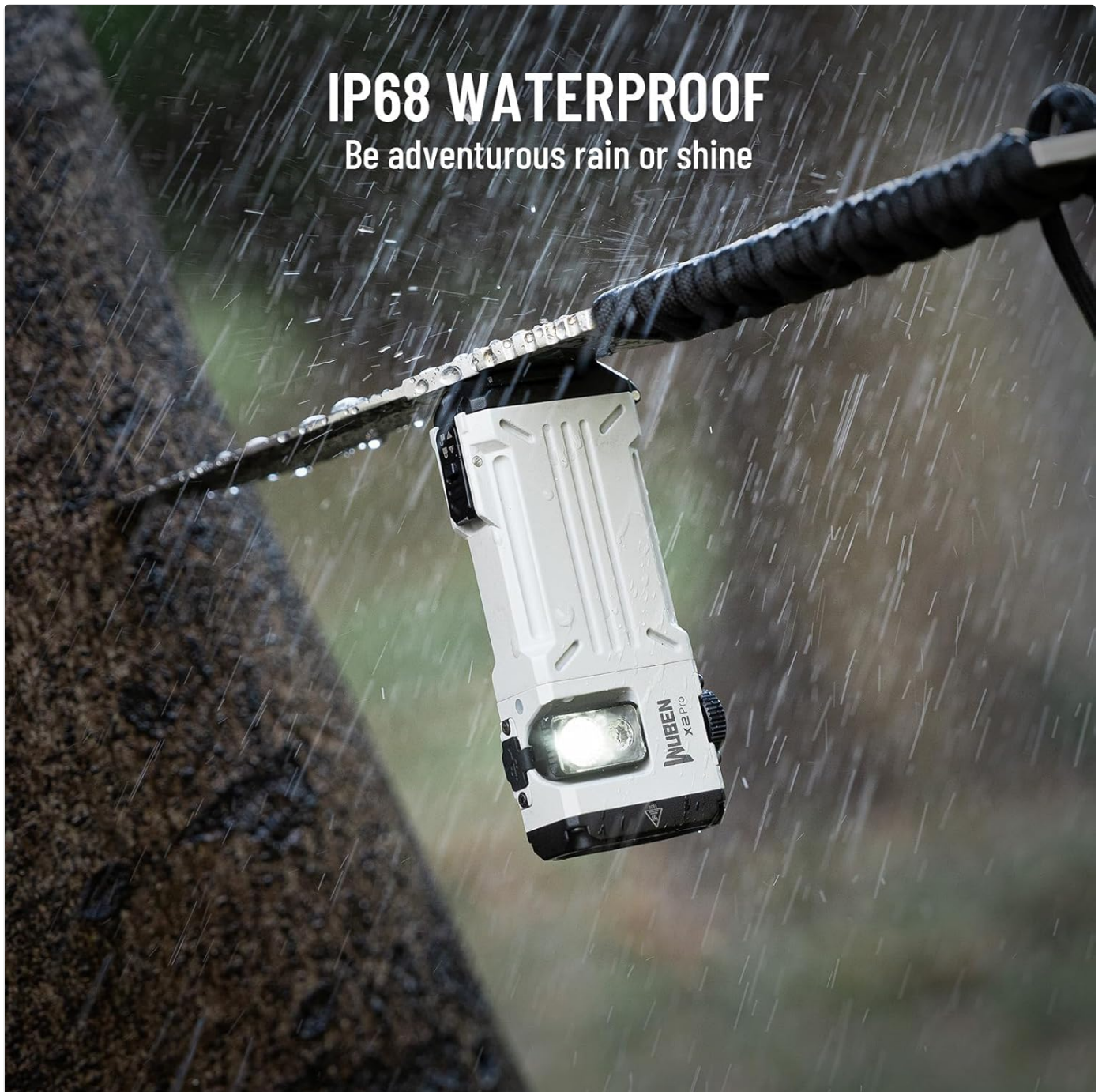
Image: The WUBEN X2Pro flashlight in a rainy outdoor setting, illustrating its IP68 waterproof capability.