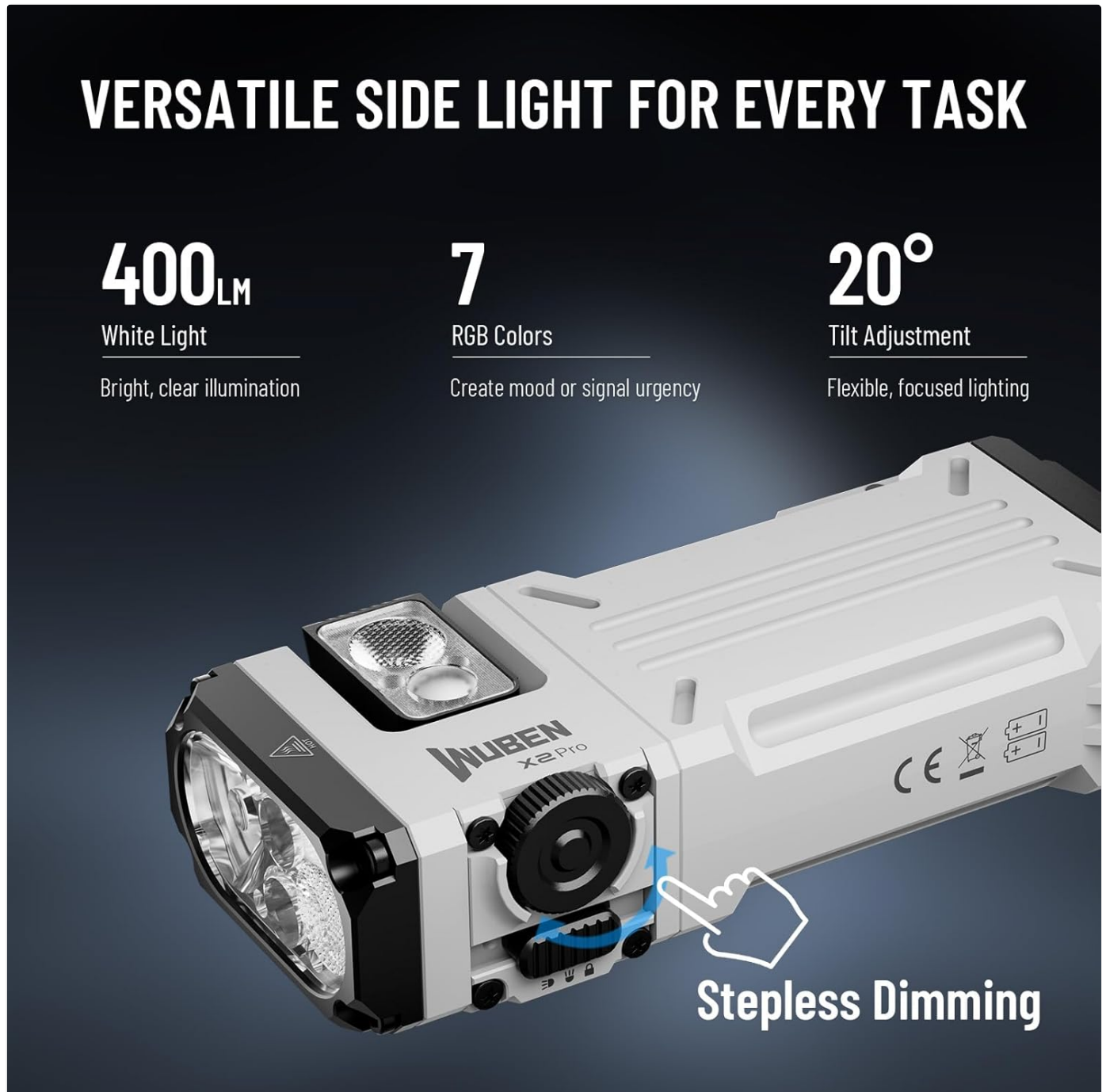
Image: The WUBEN X2Pro highlighting its versatile side light with stepless dimming and RGB color options.

The X2Pro features an innovative dual-switch design for versatile control.