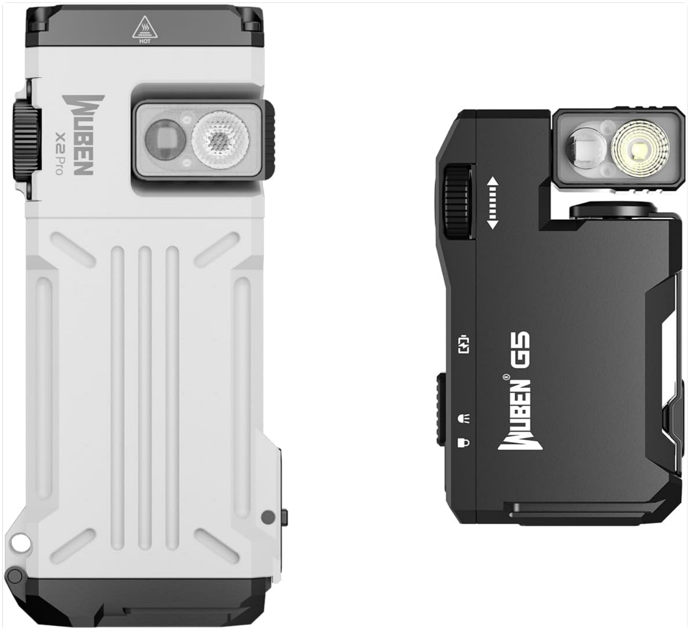
Image: The WUBEN X2Pro (left, white) and WUBEN G5 (right, black) flashlights, showcasing their compact designs.