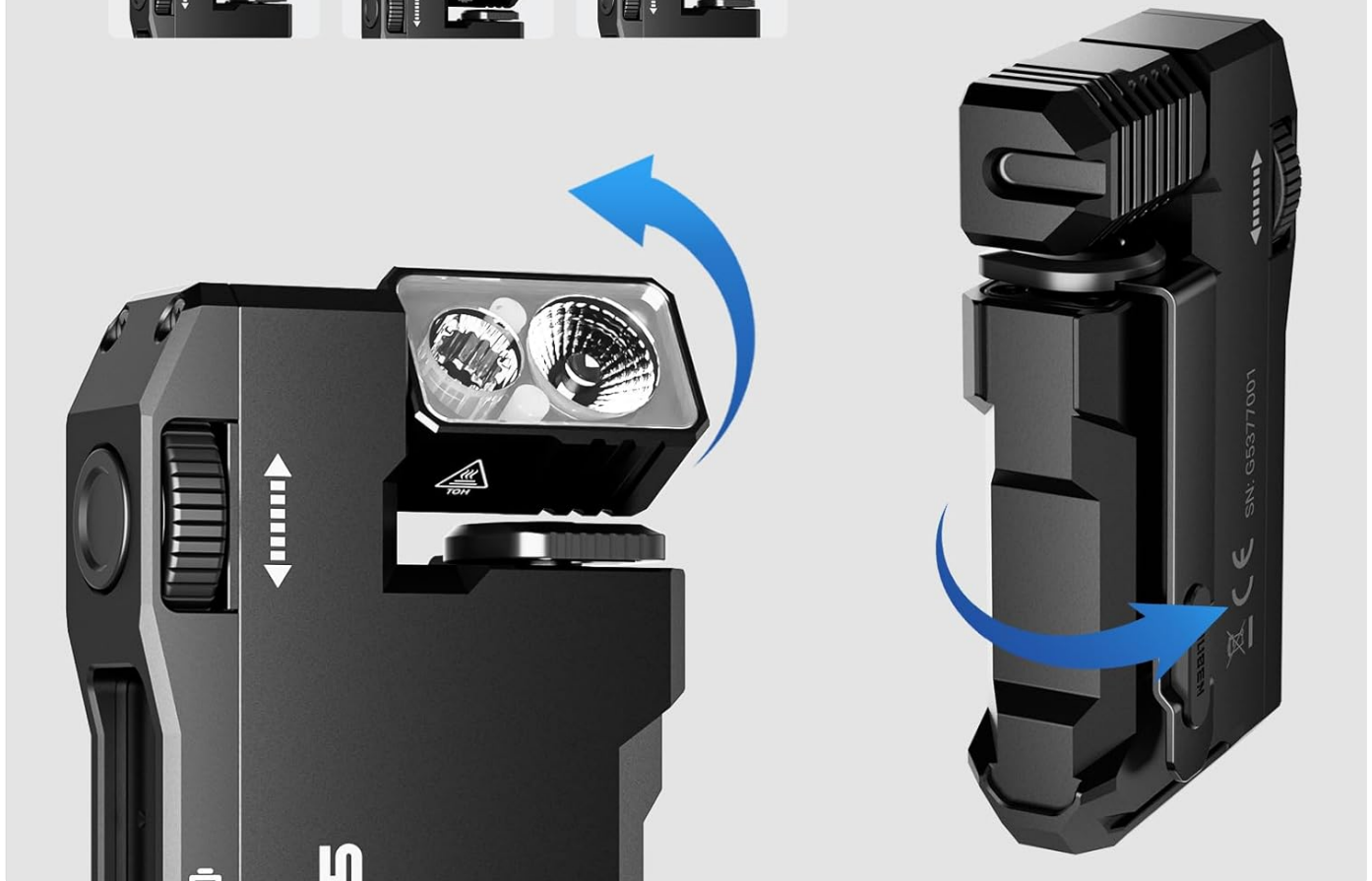
Image: The WUBEN G5 showcasing its 180-degree rotating head and adjustable clip, allowing for versatile positioning and hands-free use.