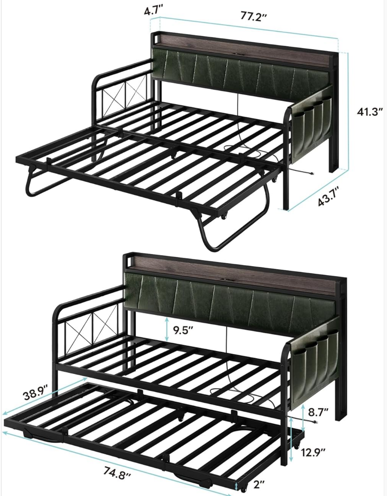
Image: Detailed dimensions of the daybed and trundle components. The main daybed measures 77.2"L x 43.7"W x 41.3"H. The trundle bed measures 74.8"L x 38.9"W x 12.9"H when extended.