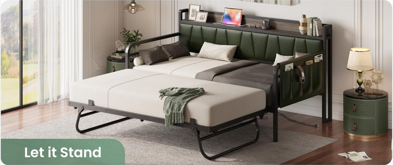
Let it Stand