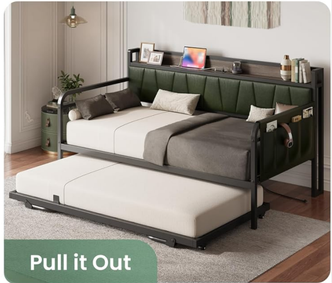
Pull it Out

Image: A detailed view of the headboard's charging station, showing two standard AC power outlets, one USB-A port, and one USB-C port for convenient device charging.