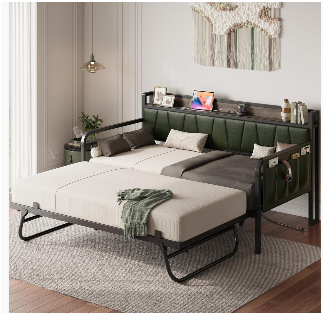
Image: Illustration of the daybed's three usage modes: as a compact daybed, with the trundle pulled out for two separate sleeping areas, and with the trundle lifted to create a larger combined sleeping surface.