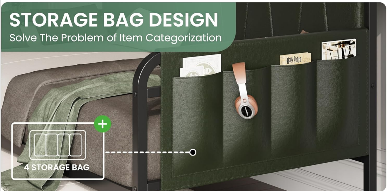
Image: This image highlights the practical storage pockets on the daybed's armrest, suitable for small items, and also showcases the rounded edges of the frame designed for safety.

Solve The Problem of Item Categorization