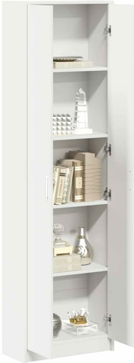
Image: Front view of the assembled vidaXL White Engineered Wood Wardrobe with Shelves.