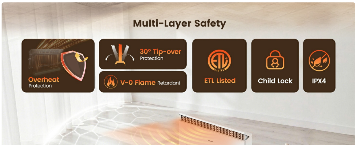
Image: Multi-Layer Safety features including Overheat Protection, 30° Tip-over Protection, ETL Listed, V-0 Flame Retardant, Child Lock, and IPX4 rating.