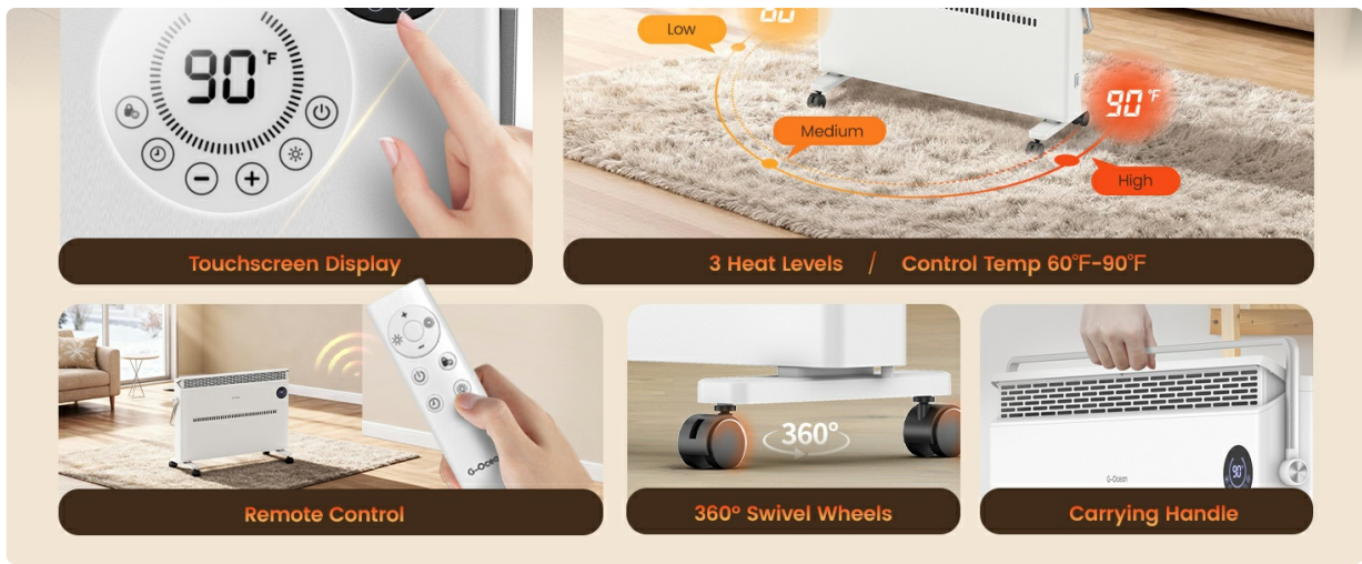
Image: The G-Ocean heater providing full power heating in a living room, covering up to 250 sq. ft.