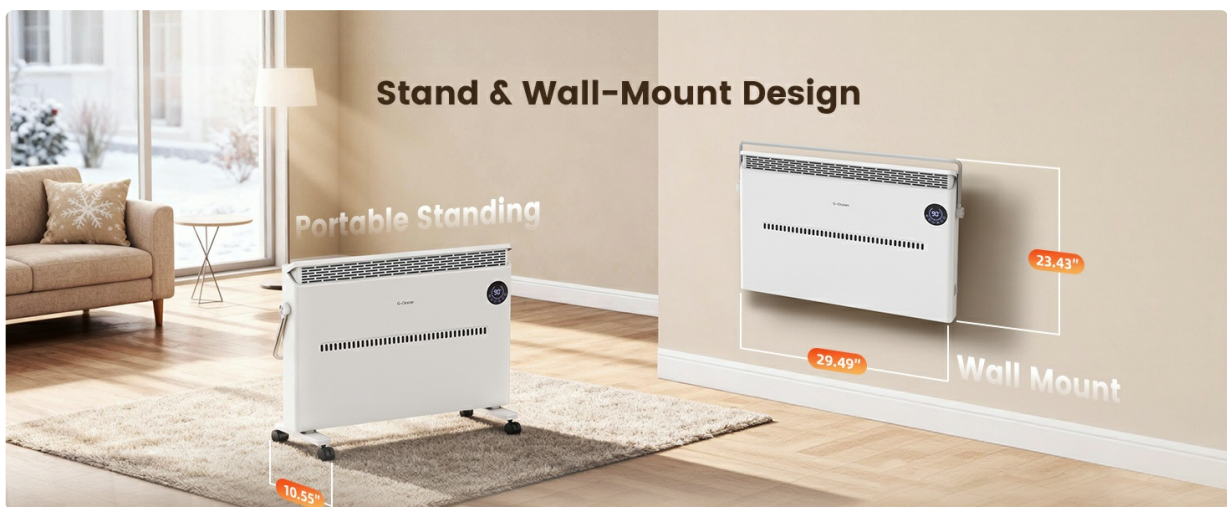
Image: The G-Ocean heater shown in both portable standing configuration with wheels and wall-mounted, highlighting its versatile design and dimensions (29.49" W x 23.43" H for wall mount, 10.55" D for standing base).