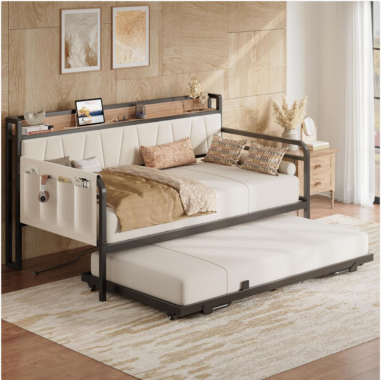
Image: LIKIMIO Twin Daybed with trundle extended.