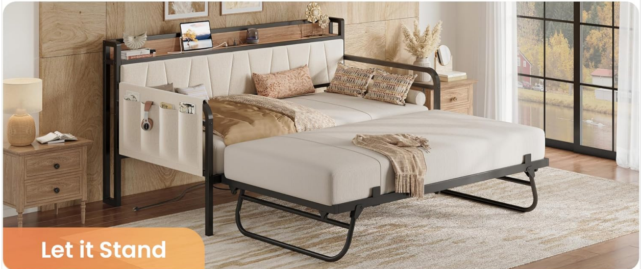
Let it Stand