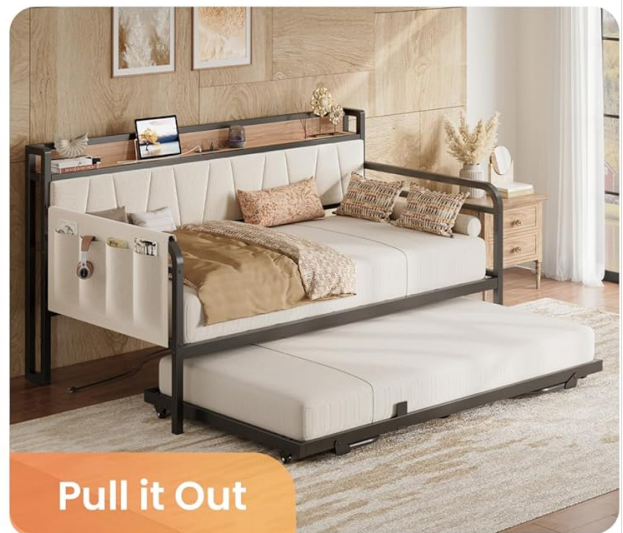
Pull it Out