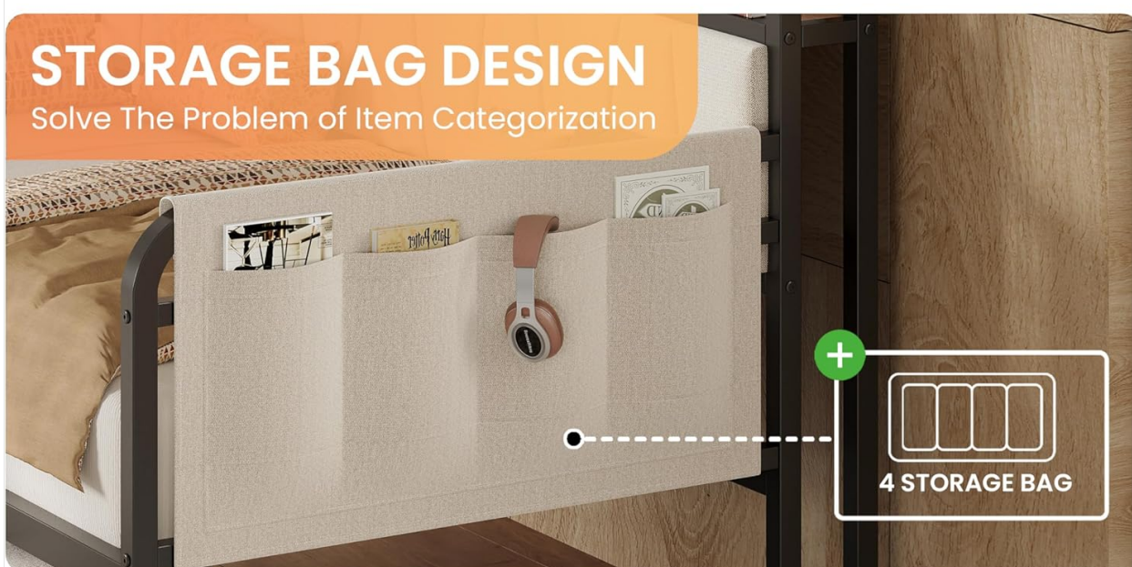
Image: Detail of the storage pockets on the armrest and the safe round design of the frame.

Solve The Problem of Item Categorization