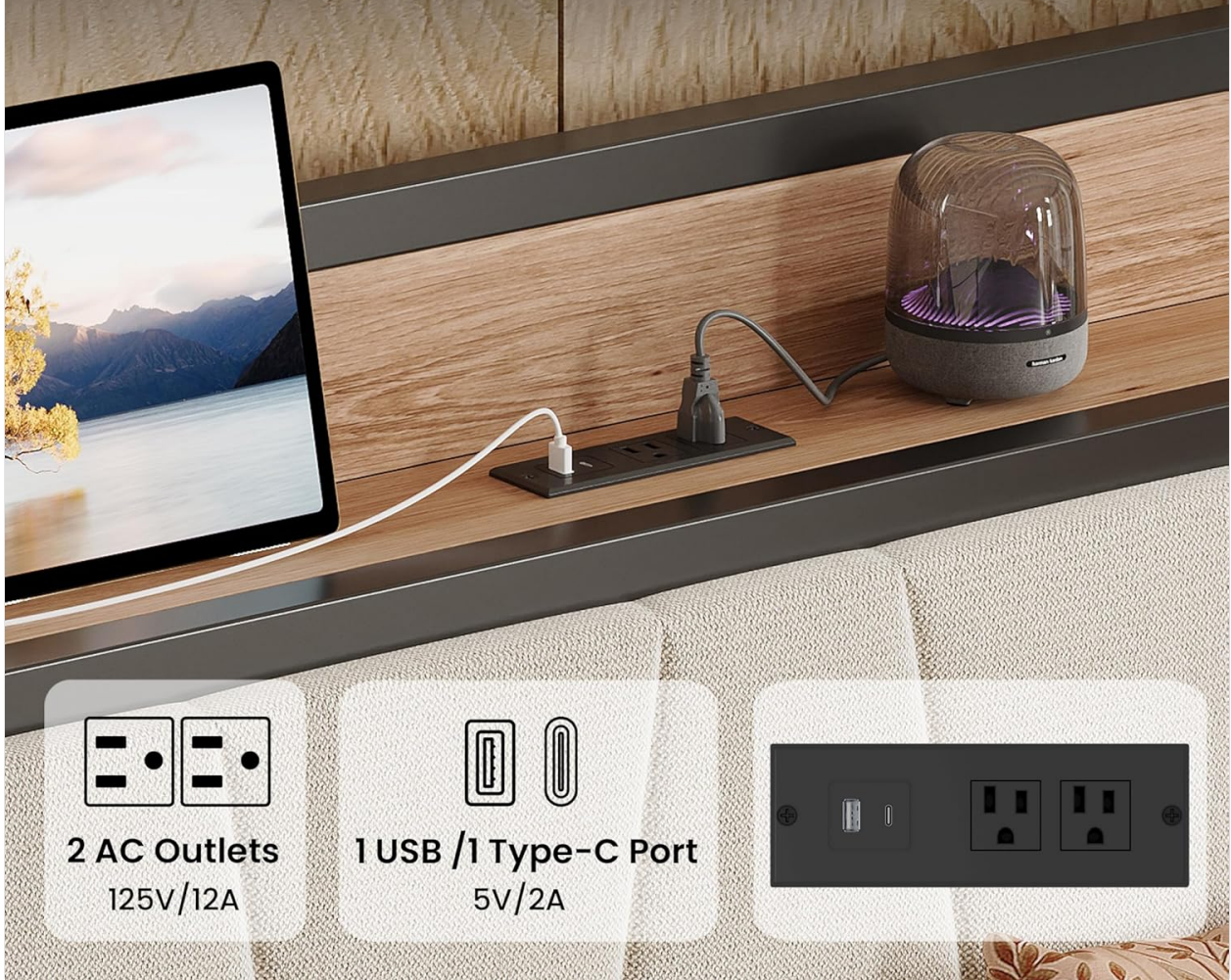
Image: Detail of the 2-in-1 headboard with charging station and storage shelf.