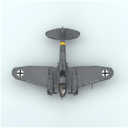
Image 7: Another top-down view of the assembled model, emphasizing the wing markings and the central fuselage structure.