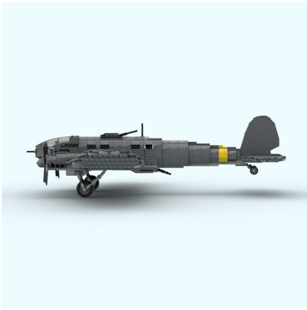
Image 4: A direct side view of the Heinkel He 111 model, illustrating the fuselage shape, landing gear, and engine nacelles.