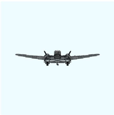
Image 5: A head-on view of the assembled model, highlighting the distinctive "greenhouse" cockpit and propeller details.