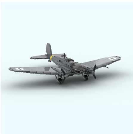
Image 6: An angled view from the front-side of the model, providing a comprehensive look at its overall structure and detailing.