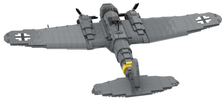
Image 1: The ConsoleXpress Heinkel He 111 Bomber Building Blocks Model, displayed with its packaging. The packaging indicates 1307 pieces and an age recommendation of 16+.