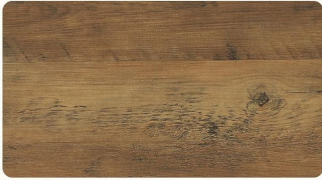
Smooth Wood Finish