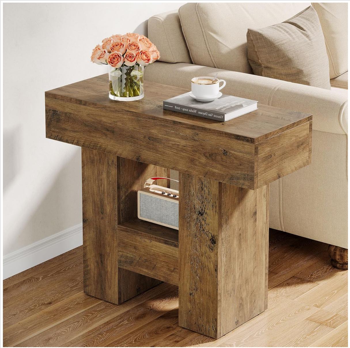
The end table is shown in a living room, serving as a convenient surface next to a sofa for holding a vase of flowers, a book, and a cup.