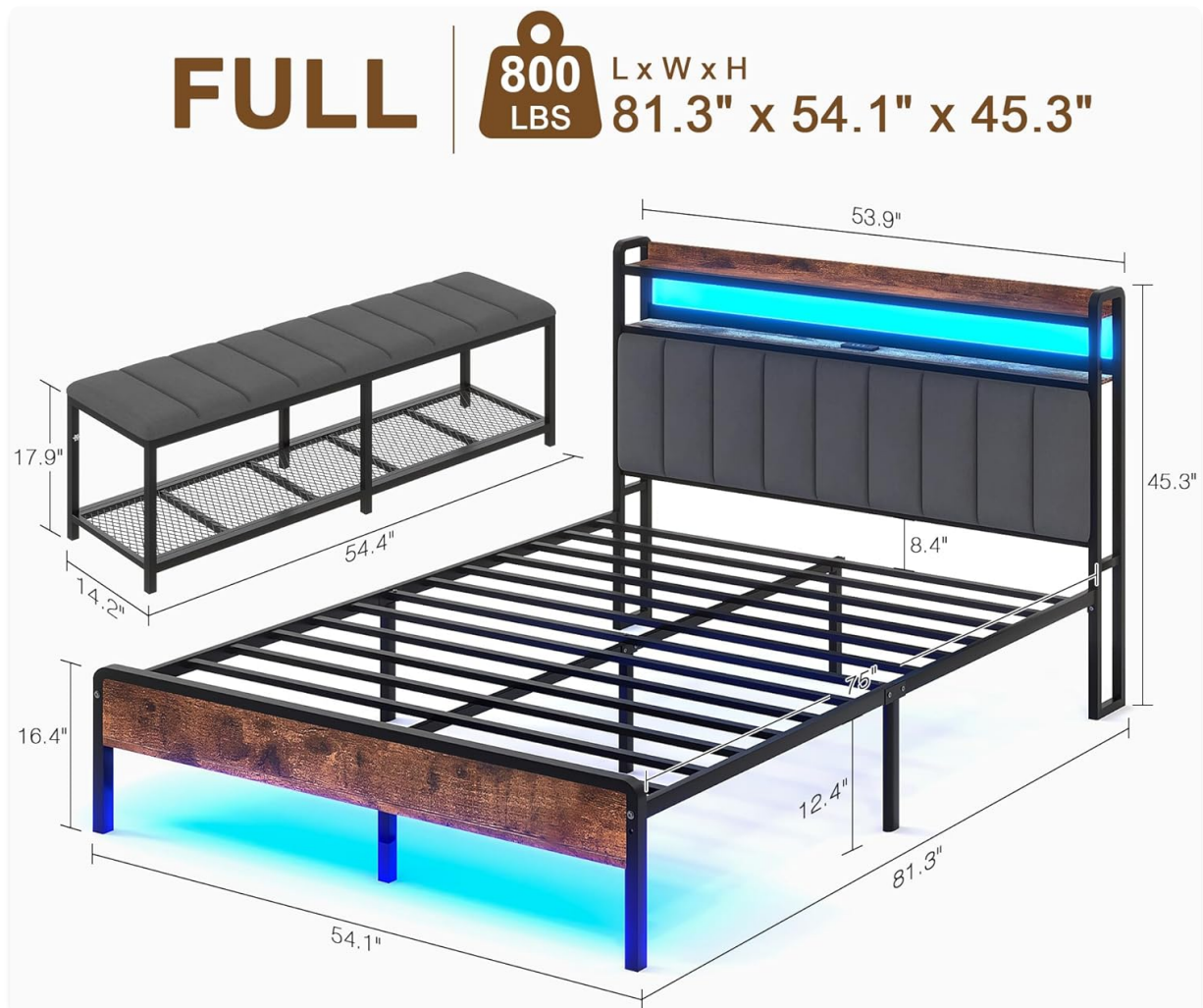
Figure 2: Detailed dimensions of the bed frame and detachable bench.