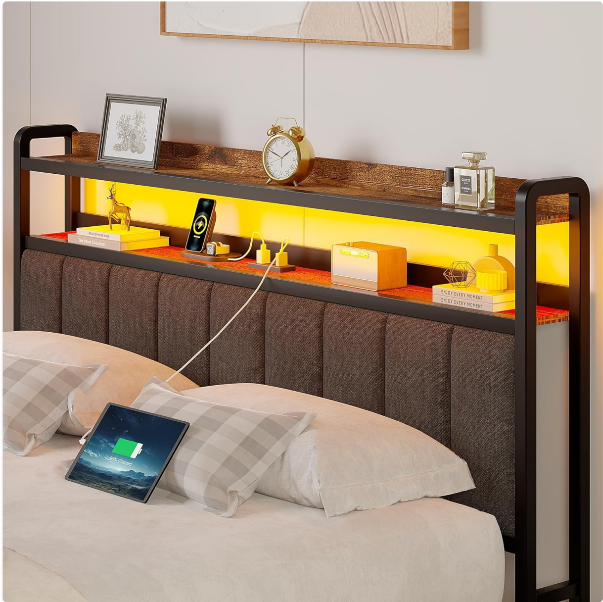
Figure 3: The upholstered headboard features a shelf with a USB charging station and integrated LED lighting.