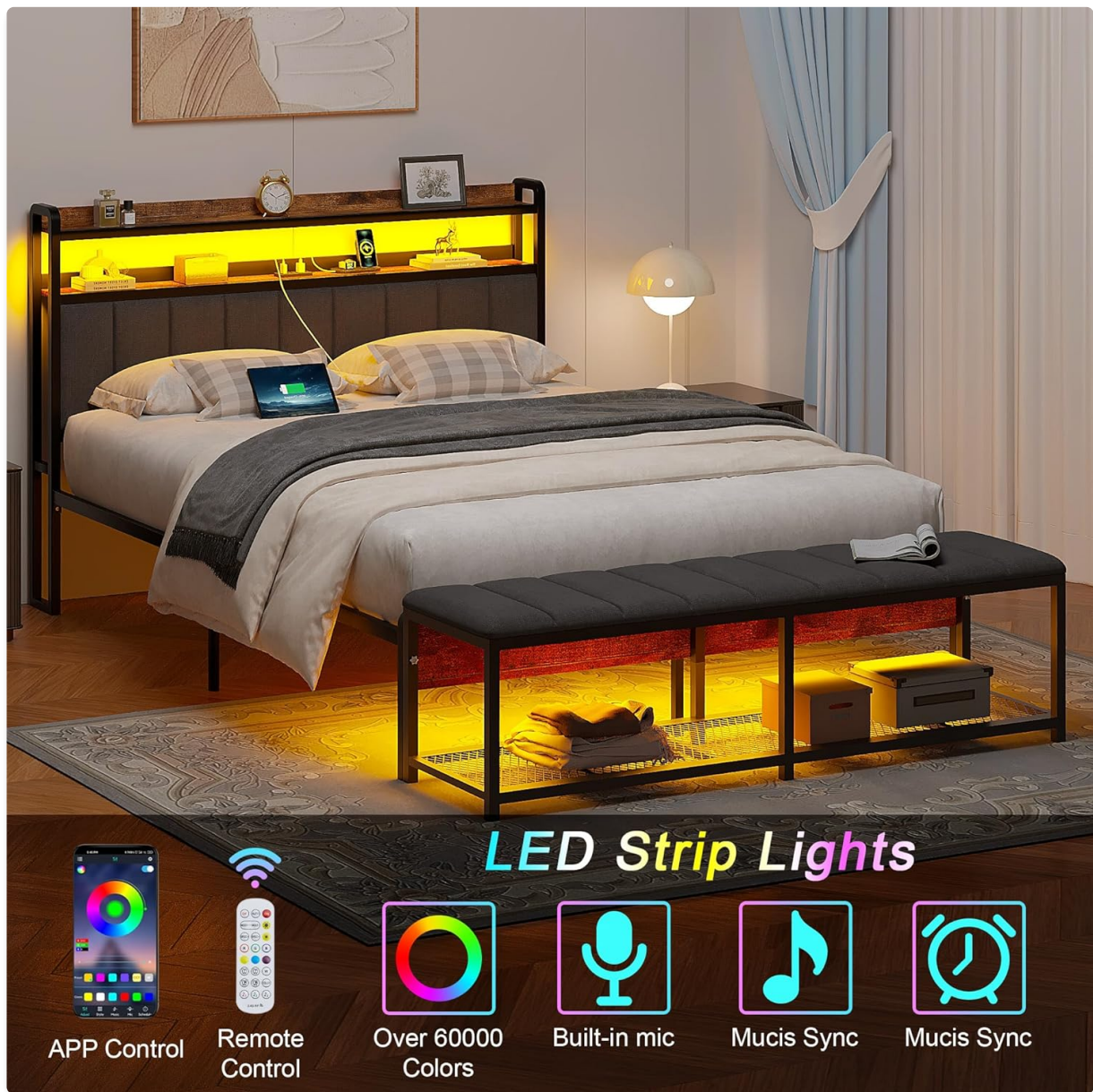
Figure 6: Control your LED lights with the remote or app to set the perfect ambiance.