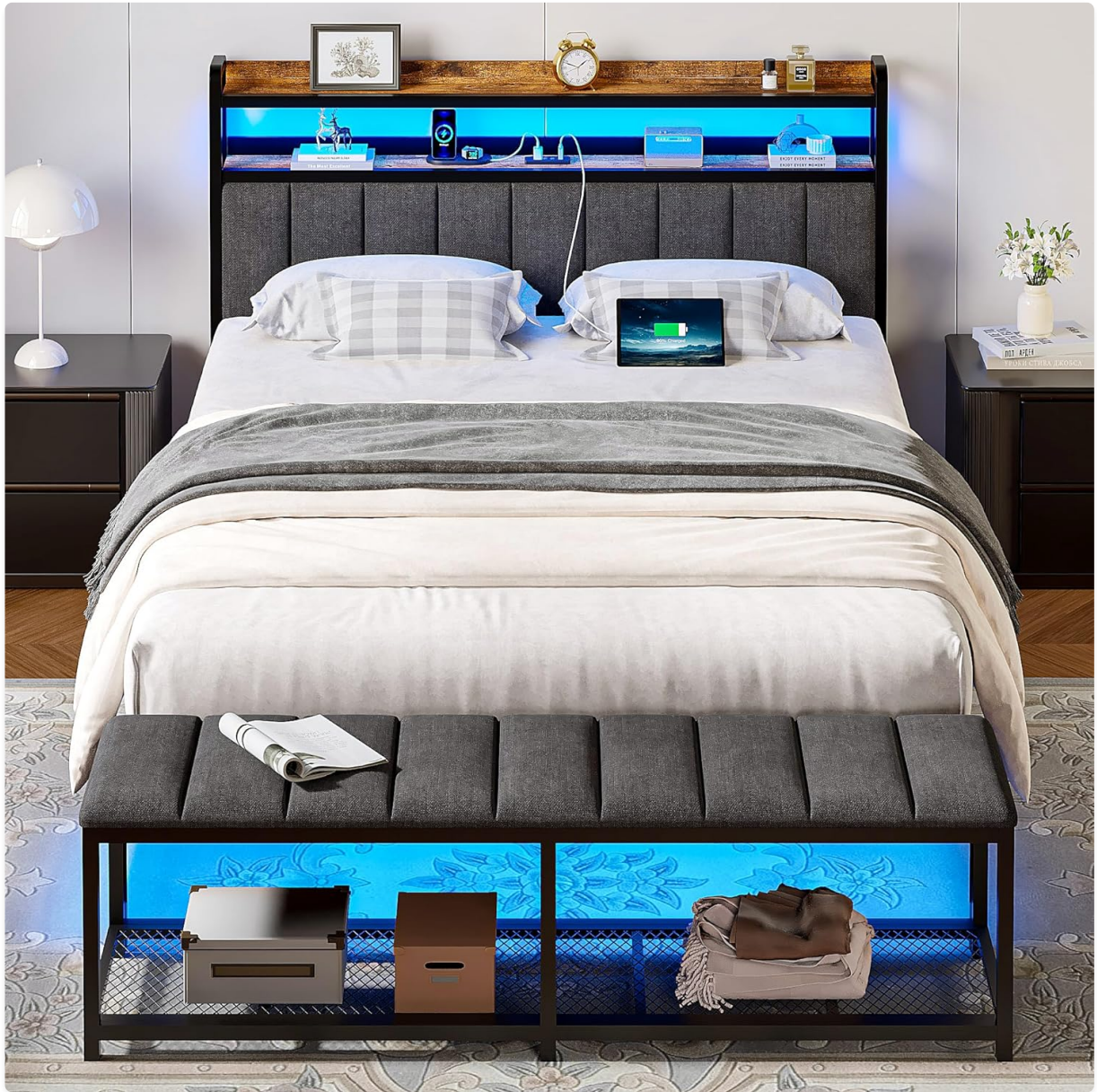
Figure 1: Overall view of the VECELO Full Size Bed Frame.