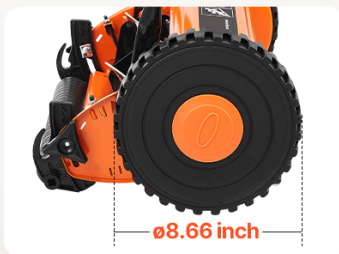
Large 8.66" wheels for easy pushing