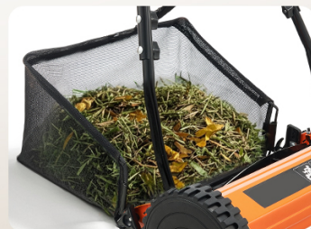
Grass catcher bag to minimize clean-up

Image: Handle assembly diagram. This image illustrates how the various handle components connect to form the complete handle unit.