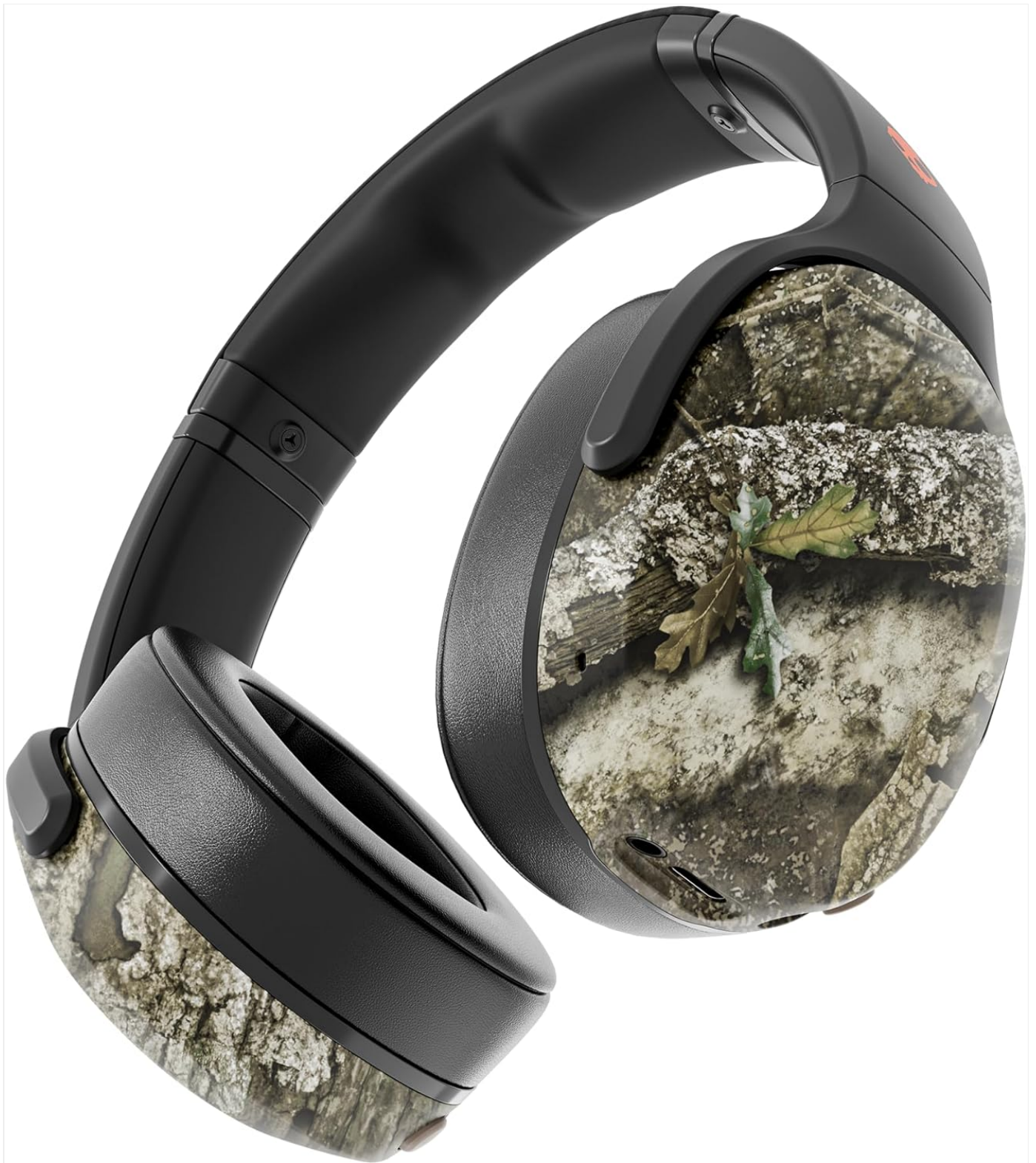
Image: The Skullcandy Crusher Evo headphones, highlighting the "Crusher Sensory Bass" feature, which allows users to feel the bass.

Your browser does not support the video tag.