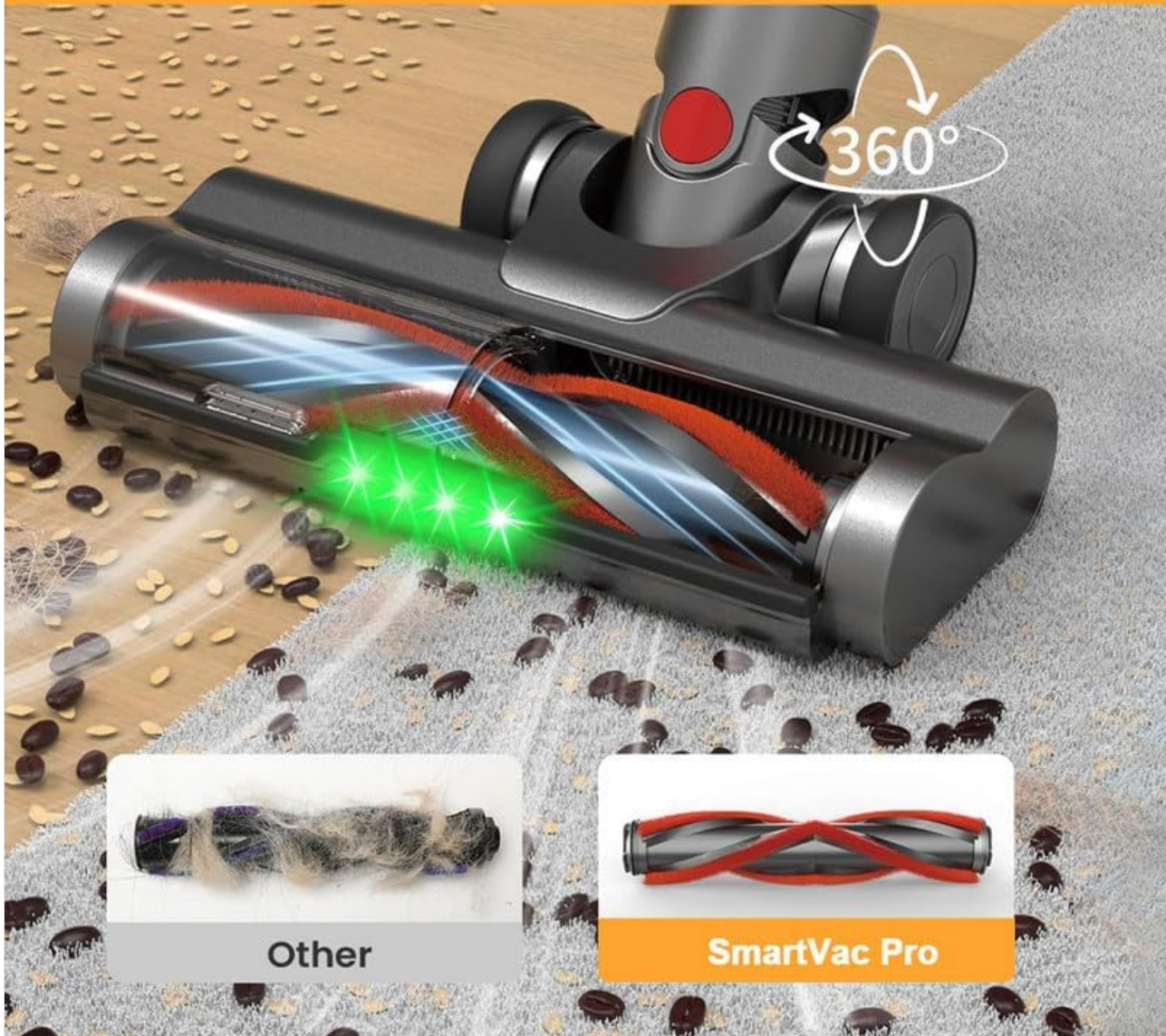
Image: The vacuum's floor brush on a carpet, illustrating the intelligent auto mode increasing suction to 65KPa.