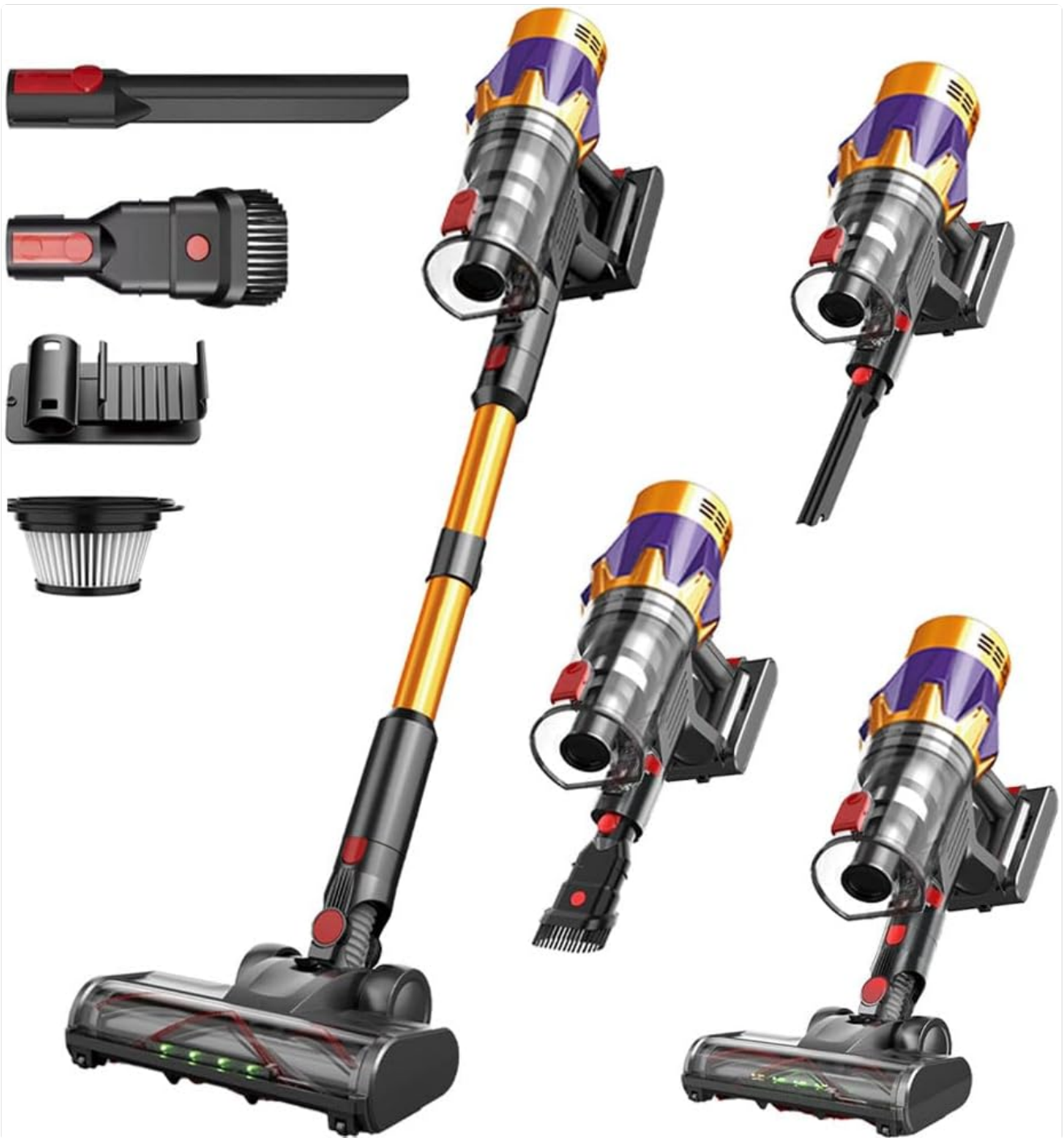
Image: The SPZTJK V18 vacuum cleaner shown in its full stick configuration and as a handheld unit with different attachments.