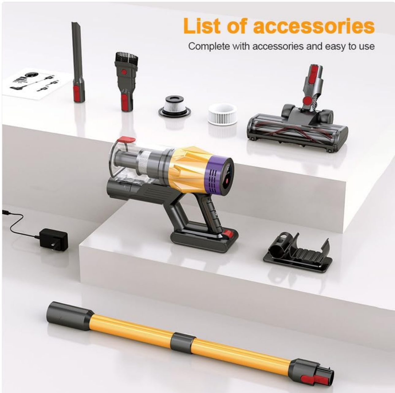
Image: All components of the SPZTJK V18 Cordless Vacuum Cleaner, including the main unit, extension tube, floor brush, crevice tool, dusting brush, wall mount, and filters.