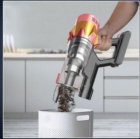
Image: Visual guide on how to empty the dust cup with a single click and remove filters for washing.

If the garbage in the dust cup exceeds MAX Line, please empty it in time