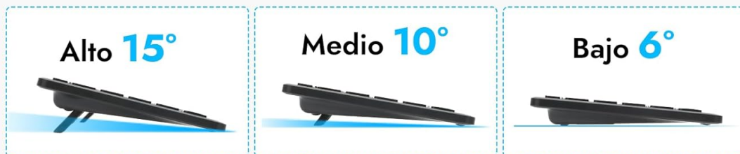
Image: Product dimensions and a visual representation of the three adjustable height levels (6°, 10°, 15°).