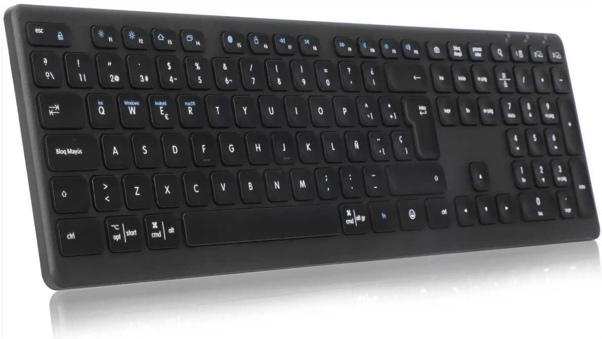
Image: Top-down view of the CITLLA K9300 Wireless Bluetooth Keyboard, showcasing its full layout with numeric keypad.

Thank you for choosing the CITLLA K9300 Wireless Bluetooth Keyboard. This full-size keyboard is designed for multi-device compatibility, offering a comfortable and quiet typing experience across various operating systems. Please read this manual carefully to ensure proper setup and optimal use of your new keyboard.