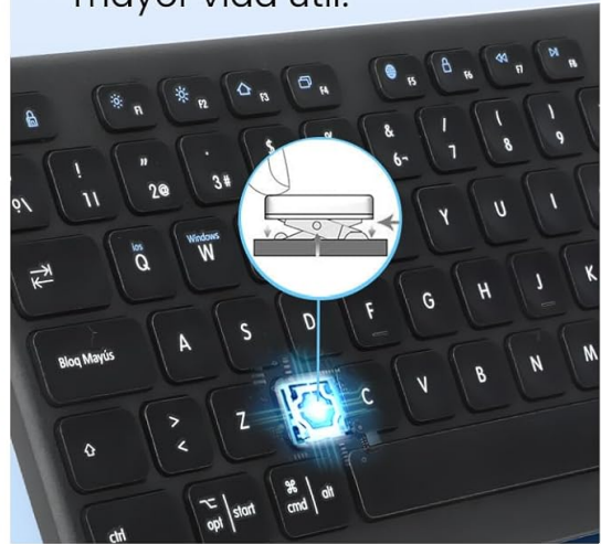
Image: Close-up view of the keyboard keys, illustrating the quiet click mechanism and scissor-foot structure for reduced noise.

Estructura más estable, mayor vida útil.