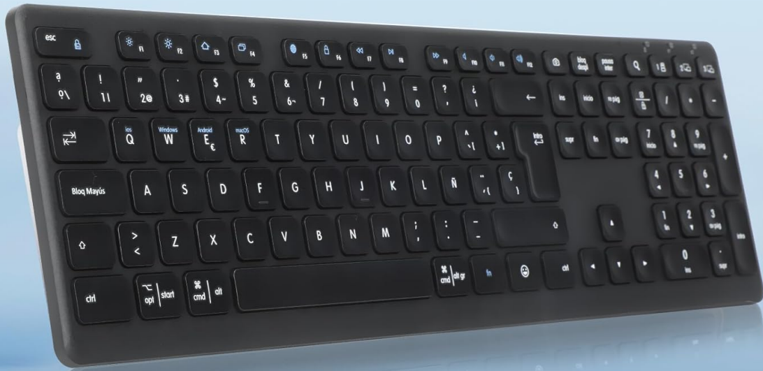
Image: The keyboard displayed with icons representing compatibility with Mac OS, Windows, iOS, Android, Linux, and Chrome OS.