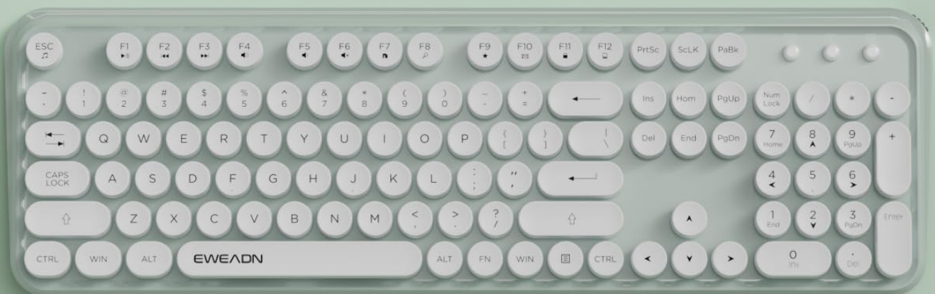
Image: Diagram illustrating the multimedia shortcut keys (F1-F12) on the keyboard, showing their functions when used with the Fn key.