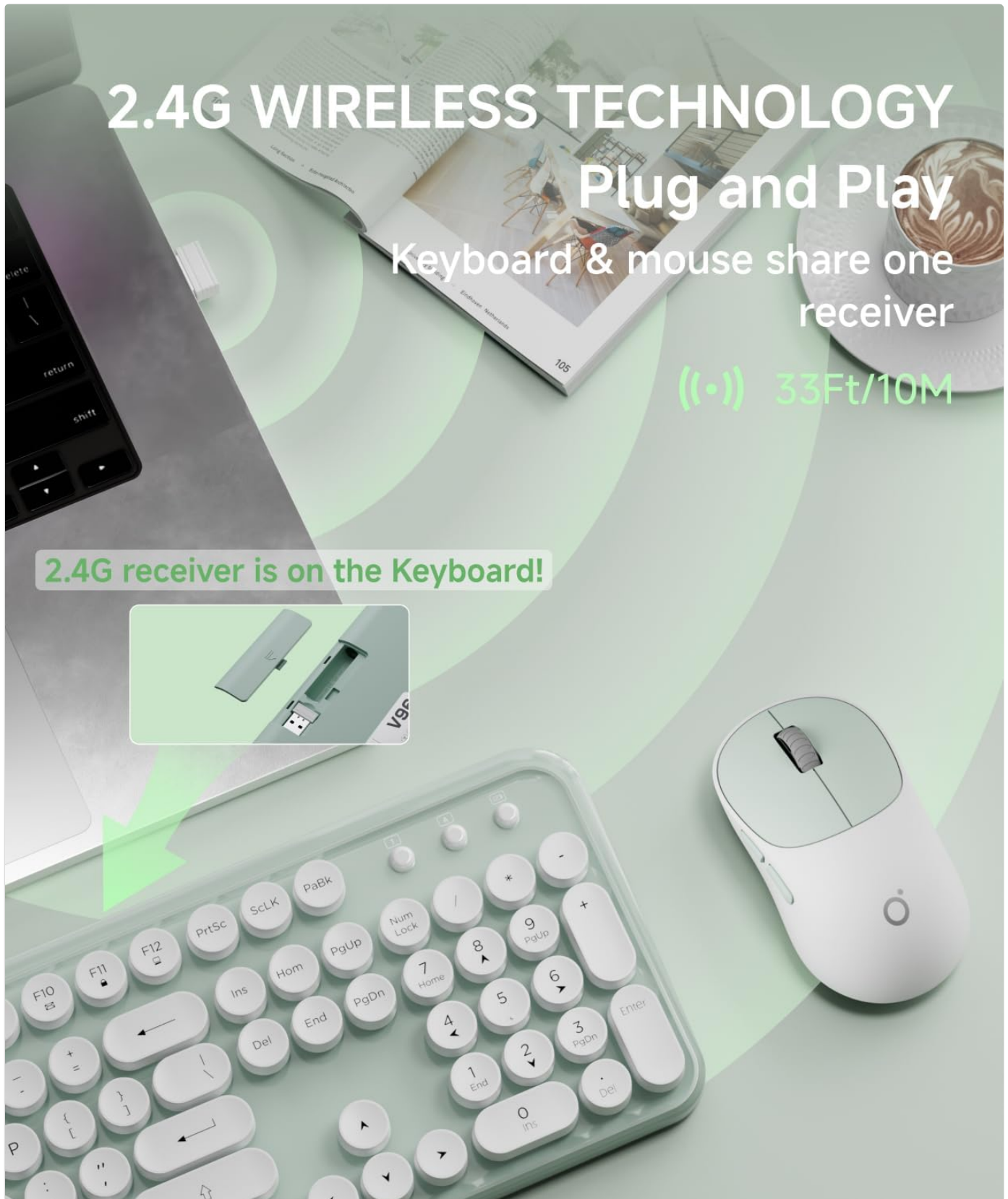
Image: Illustration showing the USB receiver being removed from the keyboard's battery compartment and then plugged into a computer's USB port, highlighting the 2.4G wireless plug-and-play technology with a 33ft/10m range.