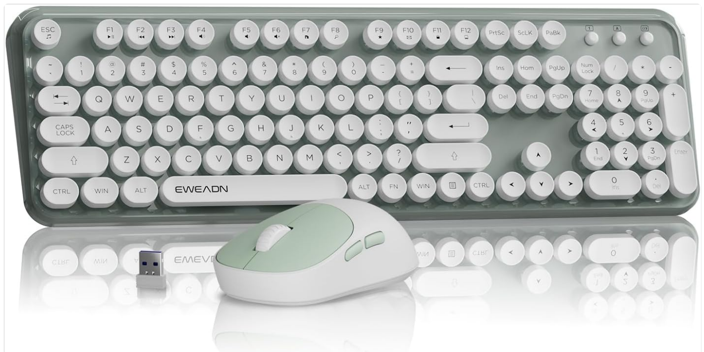
Image: The EWEADN V96 Wireless Keyboard and Mouse Combo, featuring a green full-sized keyboard with round keycaps and a matching wireless mouse, alongside the USB receiver.

Thank you for choosing the EWEADN V96 Wireless Keyboard and Mouse Combo. This full-sized retro typewriter-style keyboard with round keycaps and a quiet mouse offers a comfortable and efficient typing experience. This manual provides detailed instructions on setting up, operating, maintaining, and troubleshooting your new device.