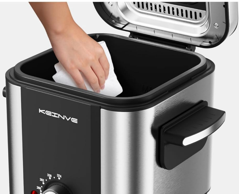
Figure 6.1: Components of the KEINVE Deep Fryer, designed for easy cleaning.