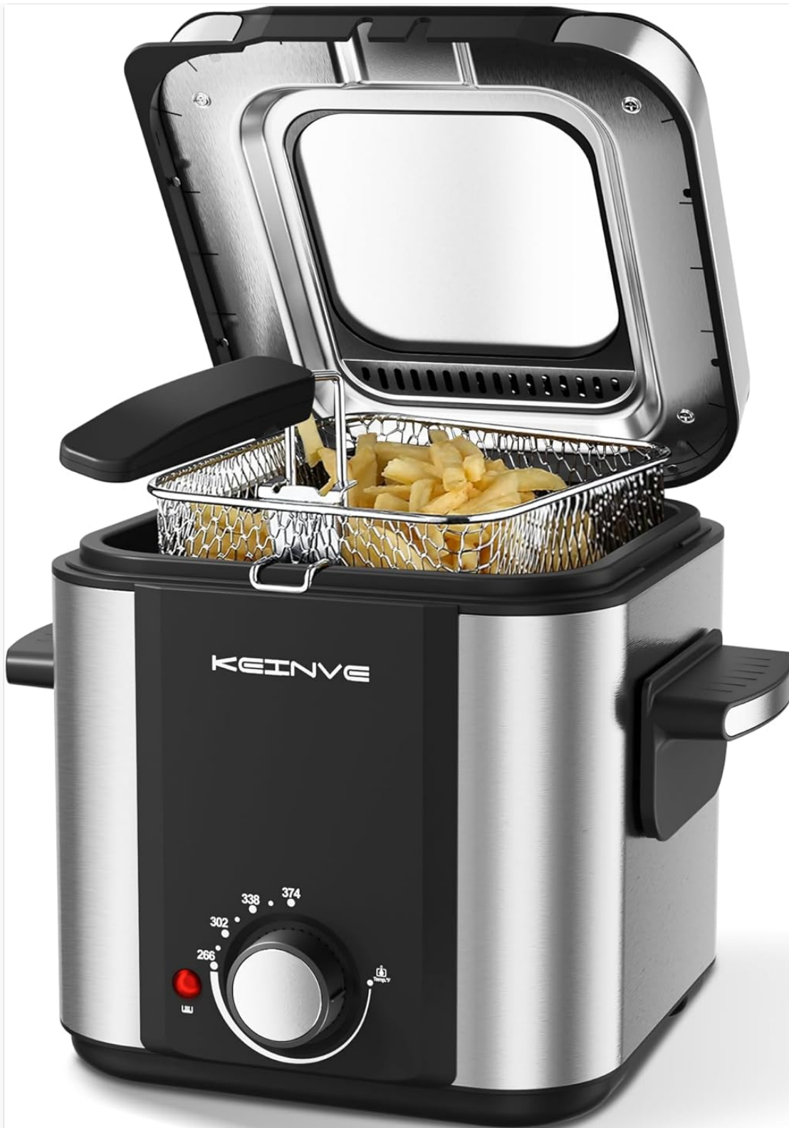
Figure 3.1: KEINVE 1.5L Electric Deep Fryer with frying basket containing food.