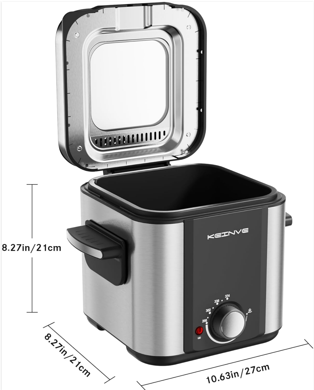
Figure 8.1: KEINVE Deep Fryer dimensions.