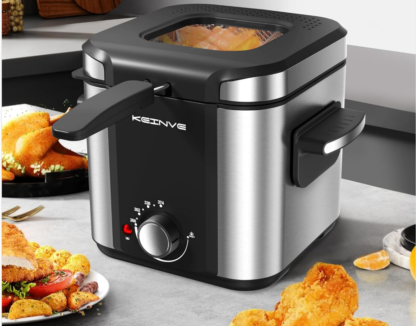
Figure 5.1: The KEINVE Deep Fryer in use, preparing various fried items.