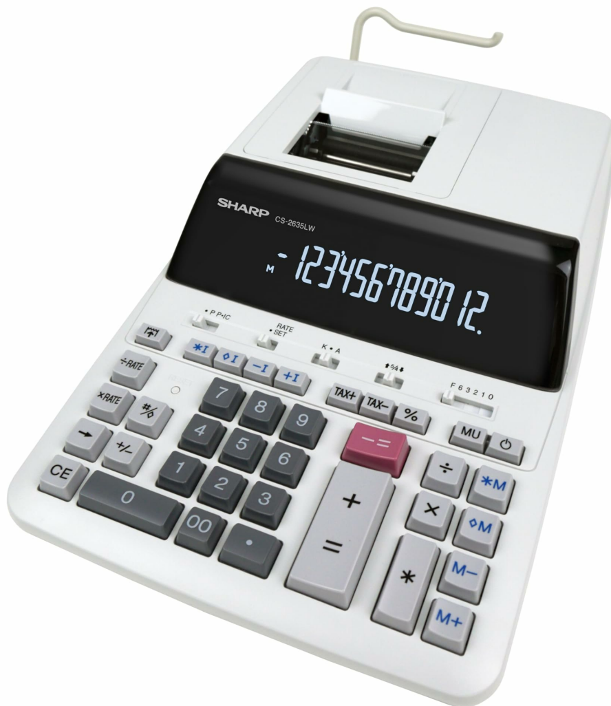
Front view of the Sharp CS-2635LW Printing Calculator, showing the display, keypad, and paper roll mechanism.