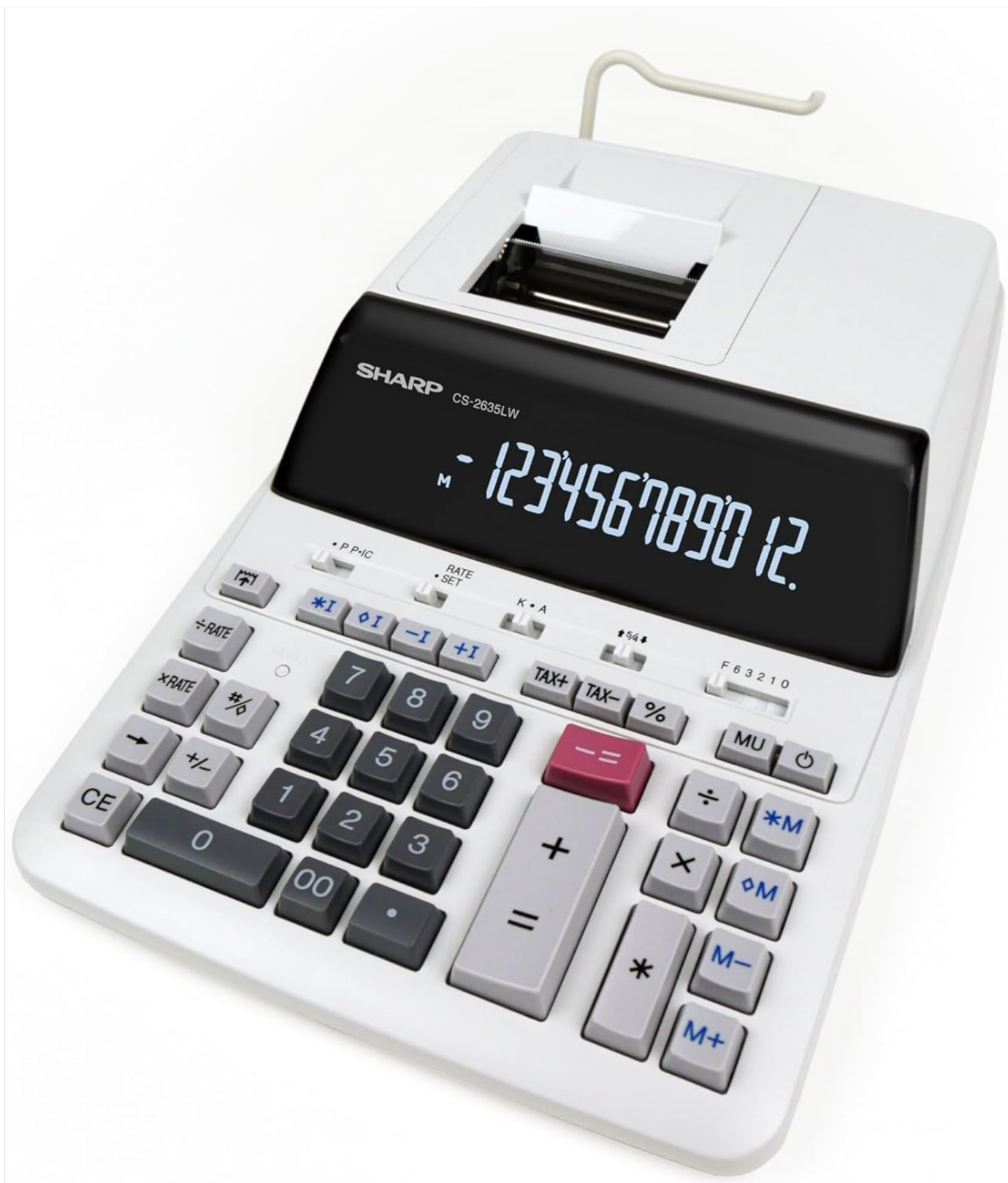
Side view of the calculator, highlighting the ergonomic keypad design.