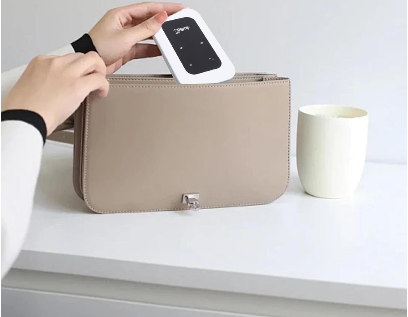
Figure 7.1: The portable design allows for easy transport and use on the go, supported by its long battery life.

Ensure over 10 hours of stable connectivity, suitable for home, or travel.