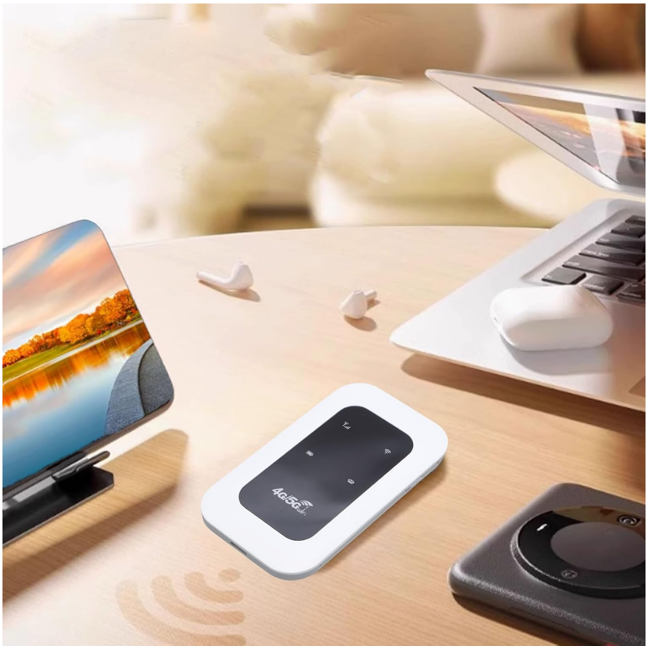
Figure 4.1: The hotspot device positioned on a desk, ready for use with other devices.