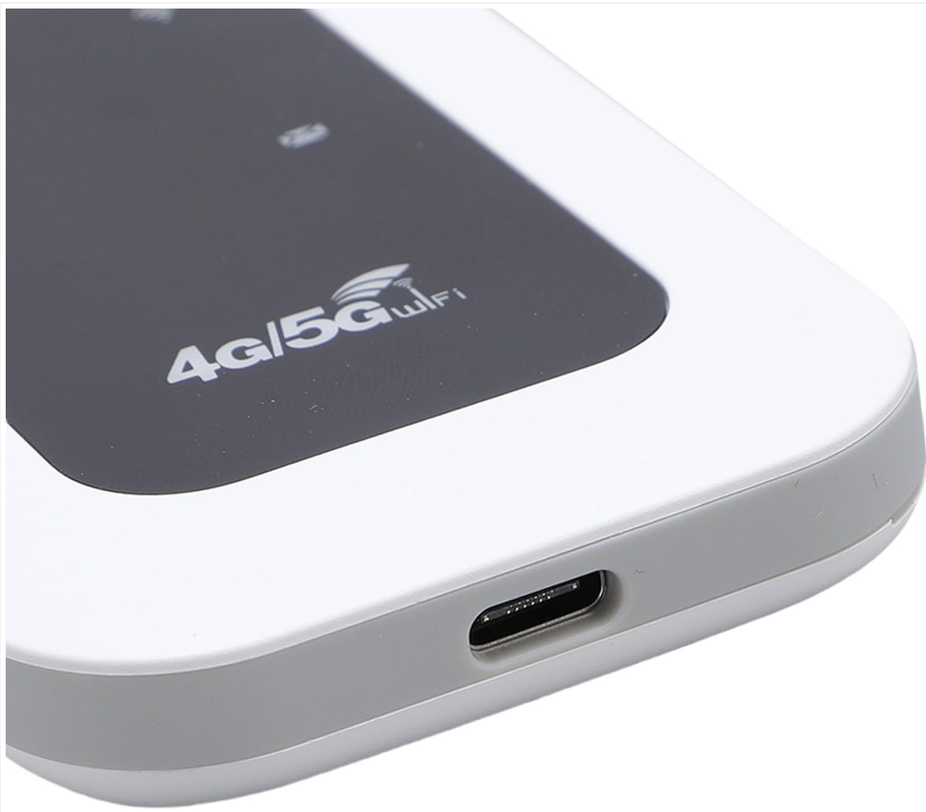
Figure 5.2: Detailed view of the Type-C charging port.