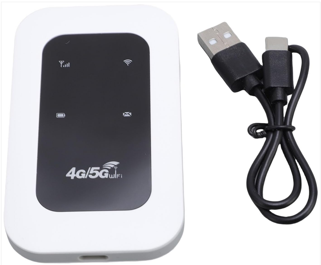
Figure 3.1: Included items: Hotspot device and USB Type-C cable.