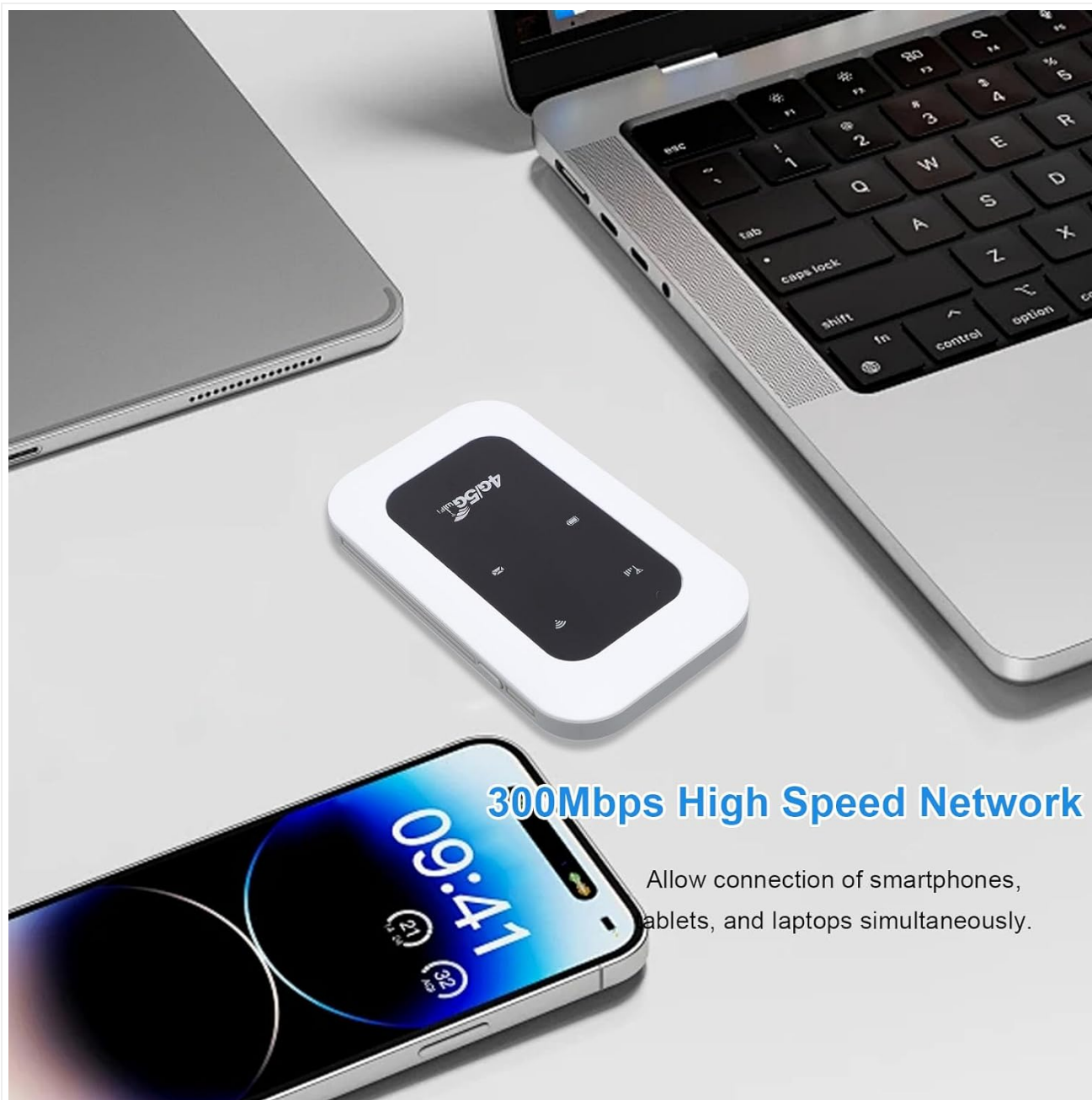
Figure 6.3: The hotspot enabling high-speed network access for multiple devices like smartphones and laptops.