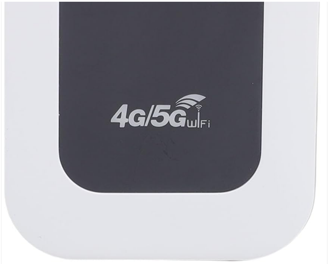
Figure 1.1: Front view of the Cuifati Portable WiFi Hotspot Device.