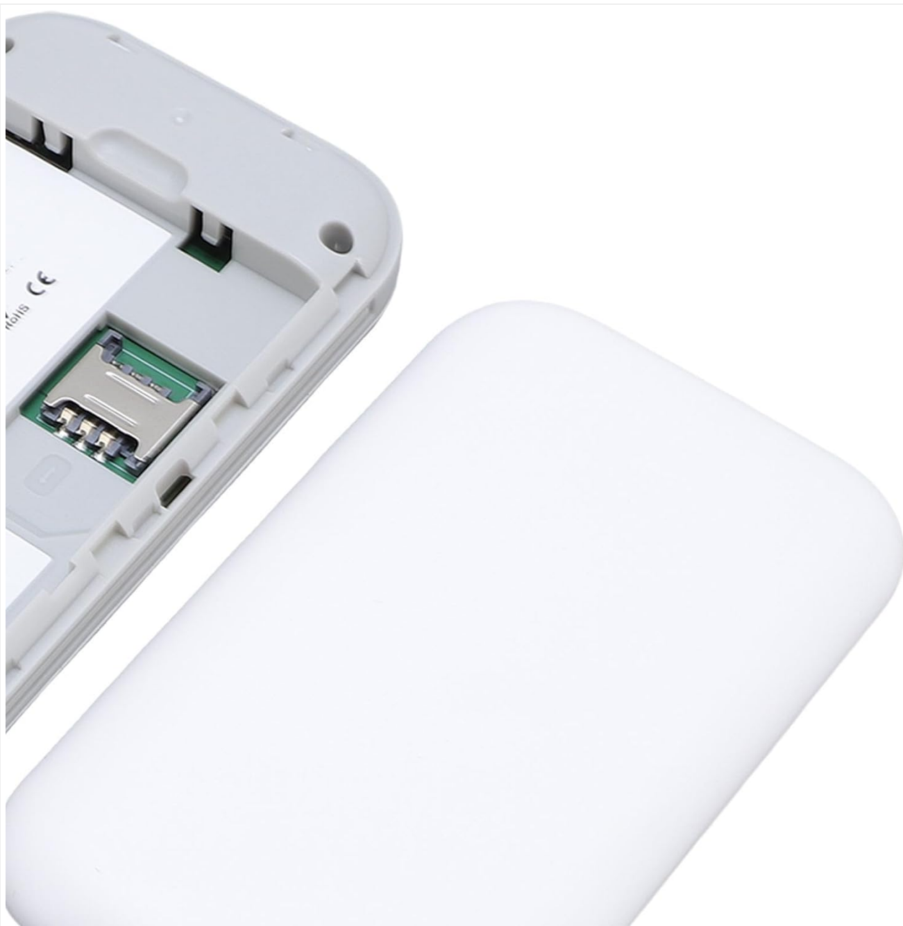
Figure 5.1: View of the SIM card slot, showing where to insert the SIM card.