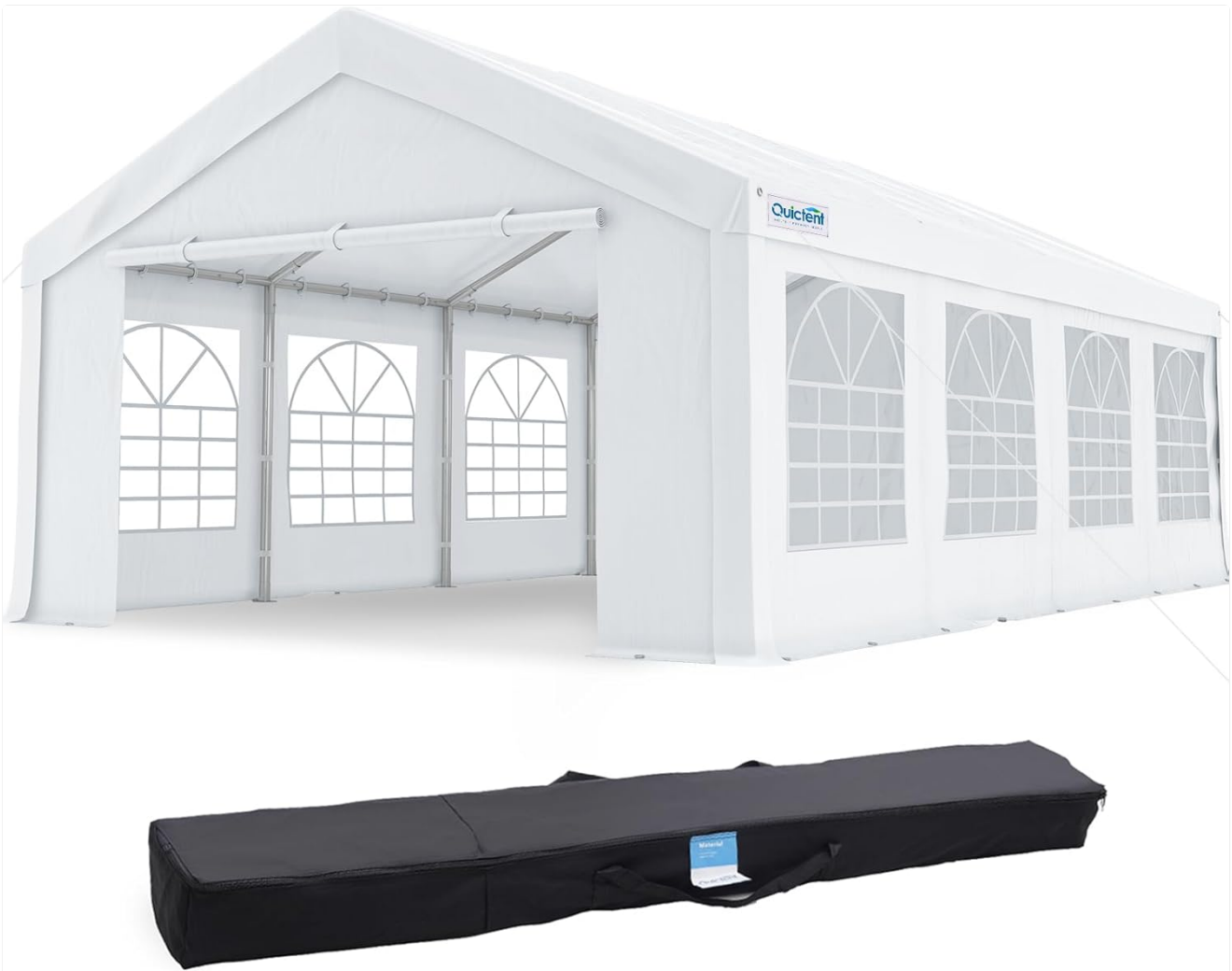
Image: The Quiccent 13'x26' Party Tent fully assembled, providing shelter for an outdoor gathering.

Your browser does not support the video tag.