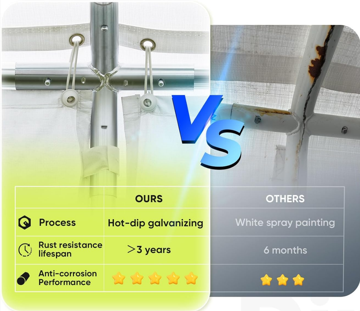
Image: Illustration of the hot-dip galvanizing technology used for the tent frame, which provides superior rust resistance and anti-corrosion performance compared to standard spray painting.