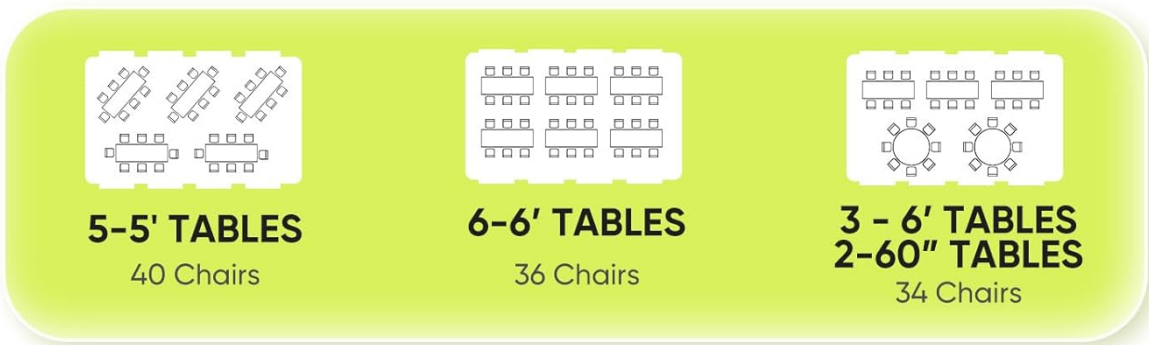
Image: Product dimensions and capacity guide for the 13'x26' tent, indicating it accommodates over 4 tables and up to 30-40 people.