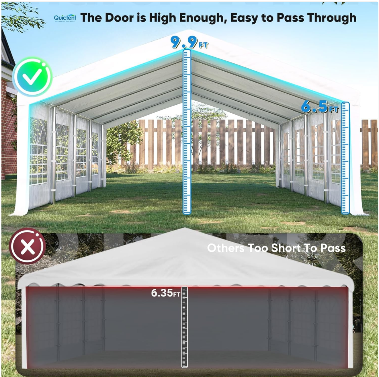
Image: A visual comparison illustrating the ample door height of the Quictent tent (9.9 ft) for easy passage, contrasting with shorter alternatives.