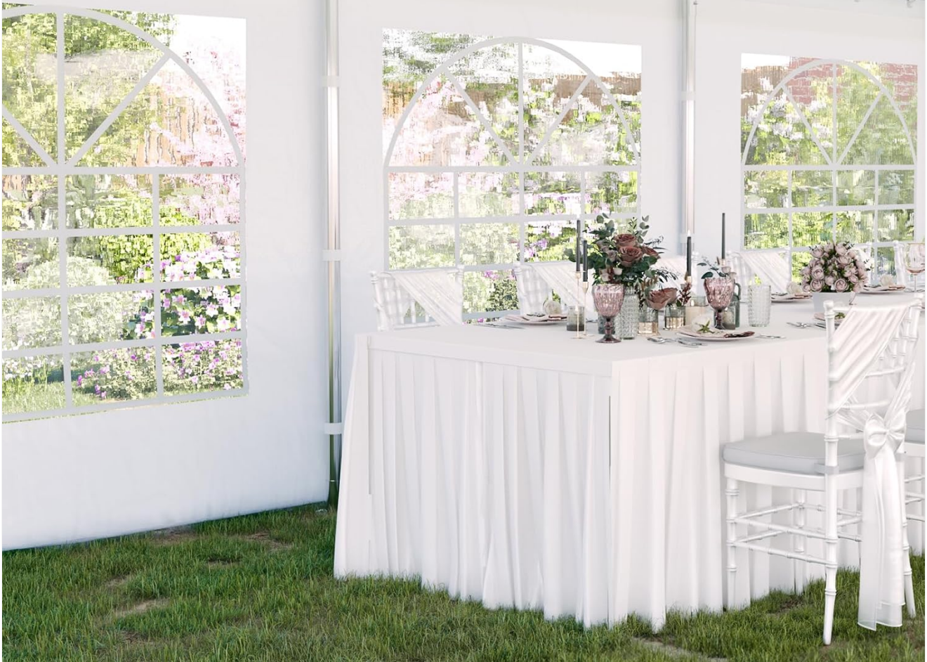
Image: Interior view highlighting the elegant church-style windows on the sidewalls, designed to offer scenic views.