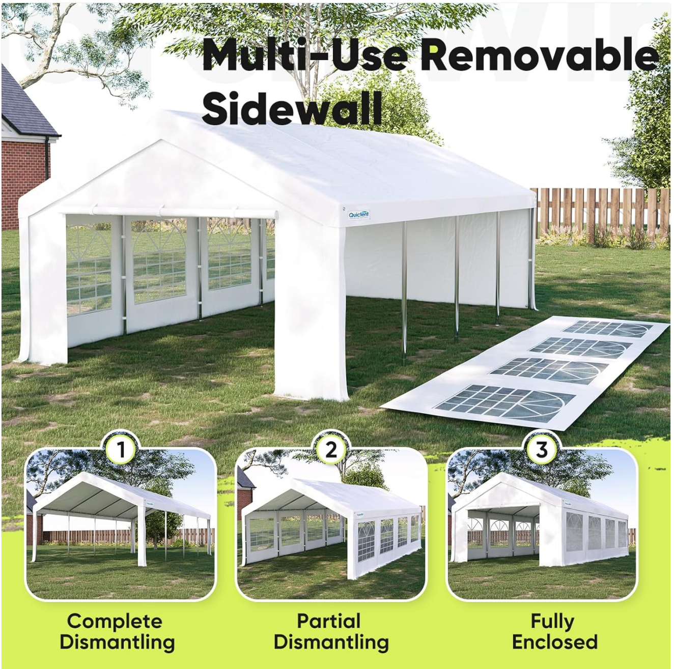
Image: Visual representation of the tent's versatility with removable sidewalls, allowing for fully enclosed, partially open, or completely open configurations.

The zippered doors can be rolled up and secured to provide wide entryways and enhance ventilation. The chapel windows offer natural light and scenic views while maintaining protection from elements.