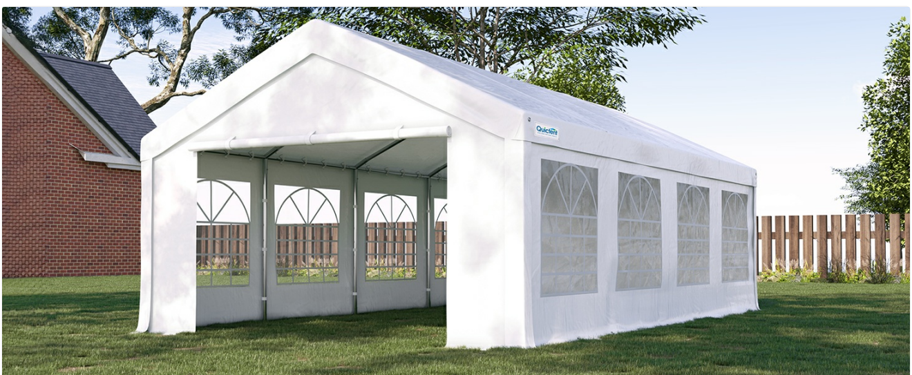
Image: A zippered door rolled up and secured, demonstrating easy access and ventilation options.