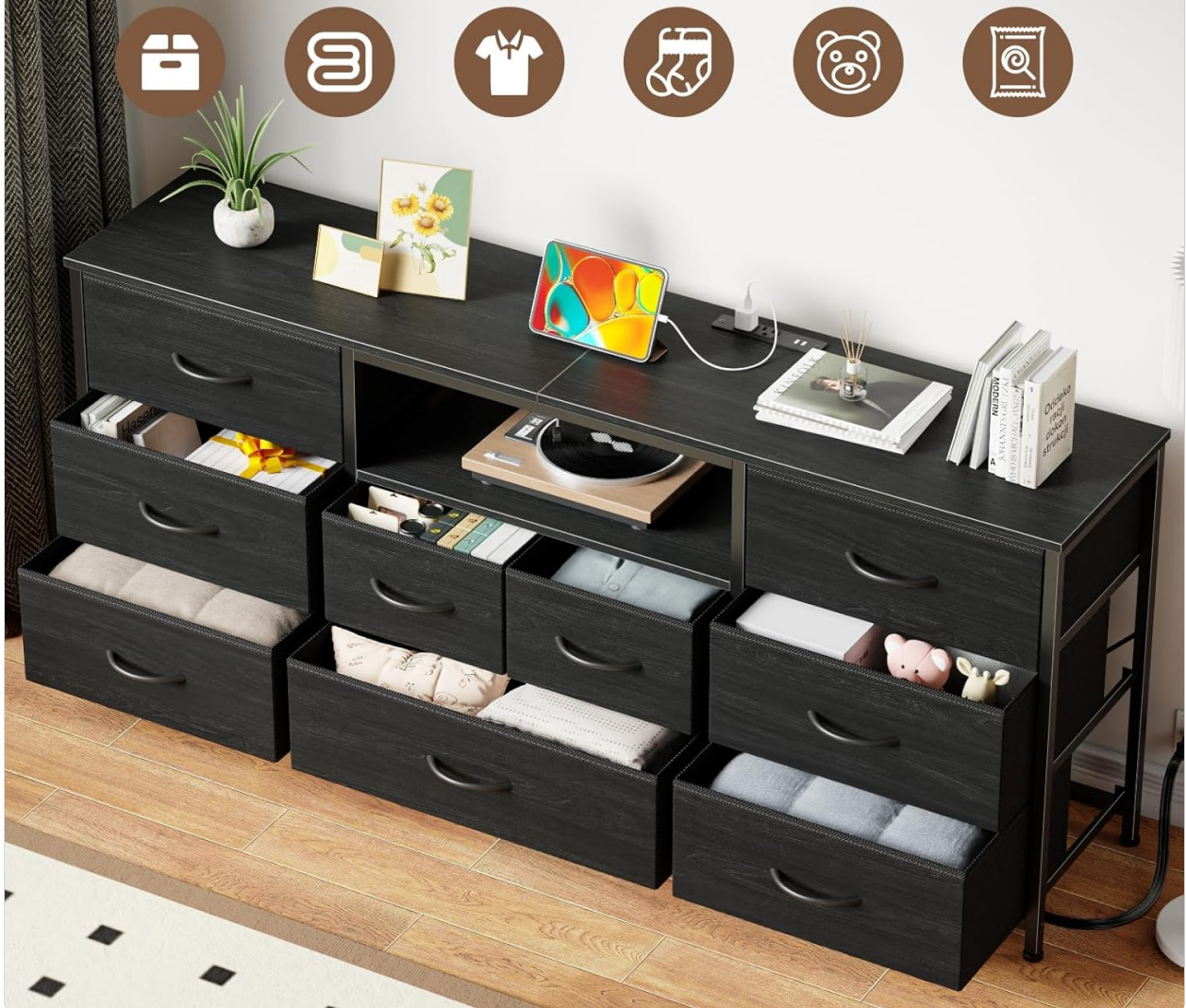
Figure 6: Overview of the 2-tier shelf and 9 storage drawers.