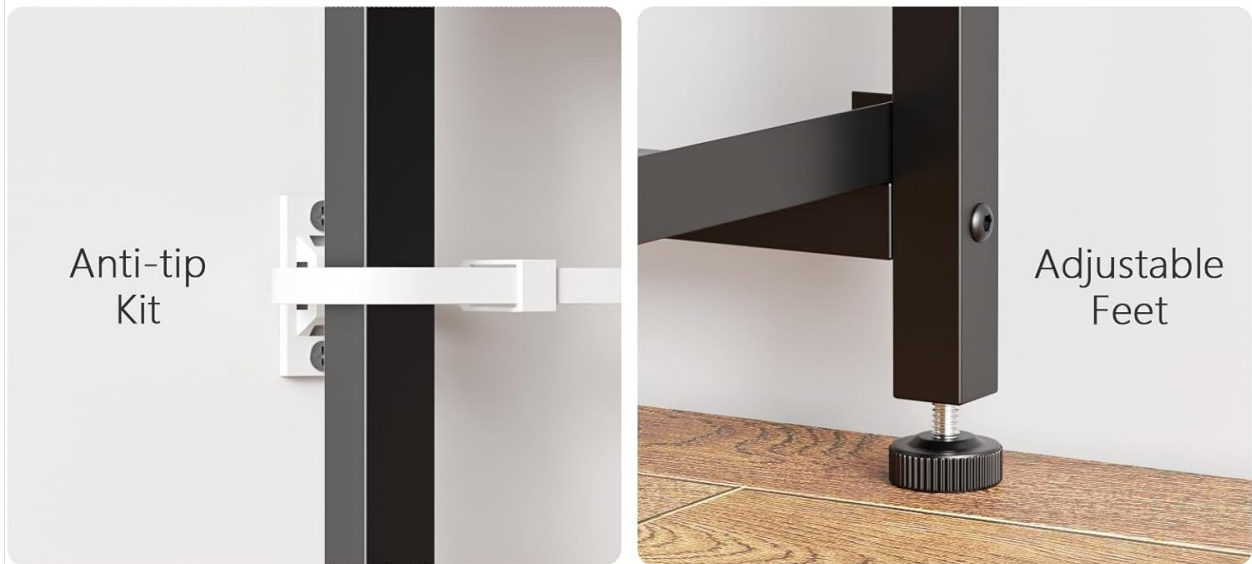
Figure 2: Stability features including supporting steel bar, anti-tip kit, and adjustable feet.