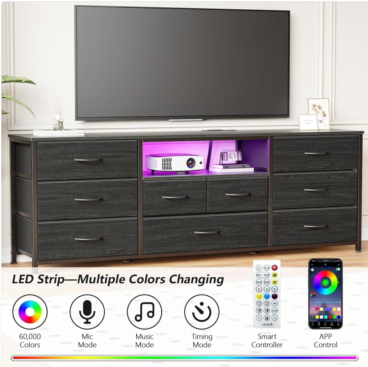
Figure 4: LED light strip with remote and app control options.