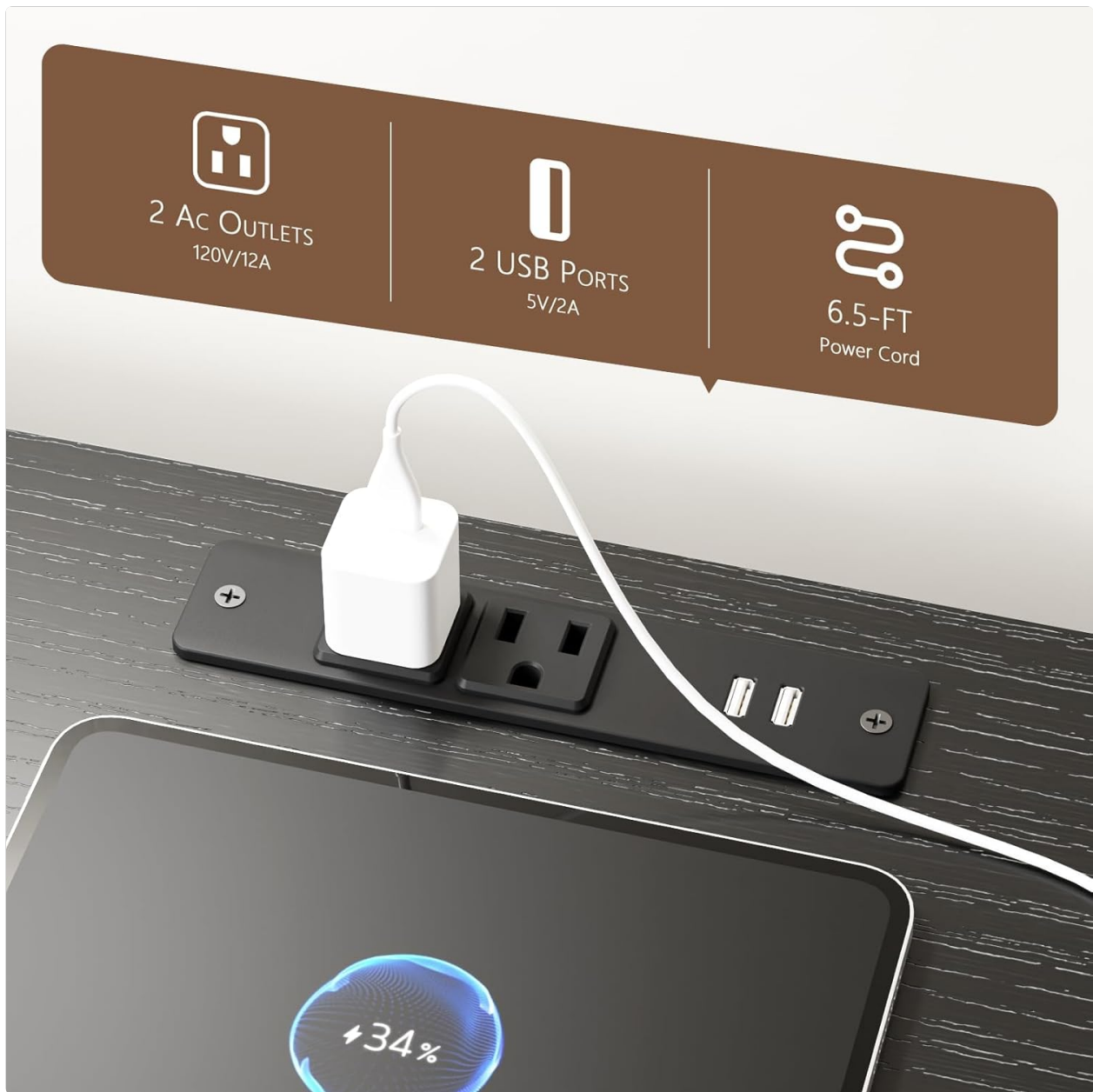
Figure 3: Integrated power outlet and USB charging ports.