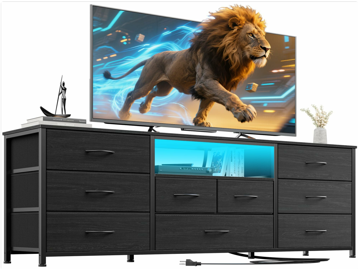
Figure 1: Furnulem 63-inch 9-Drawer Dresser and TV Stand.