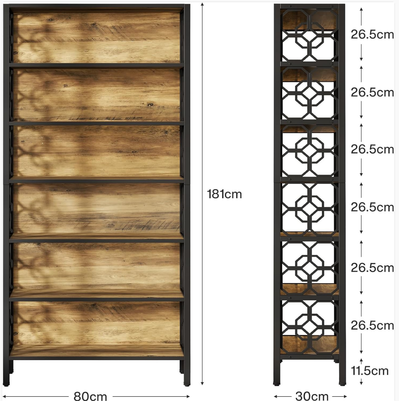
Figure 3: Product Dimensions Overview.