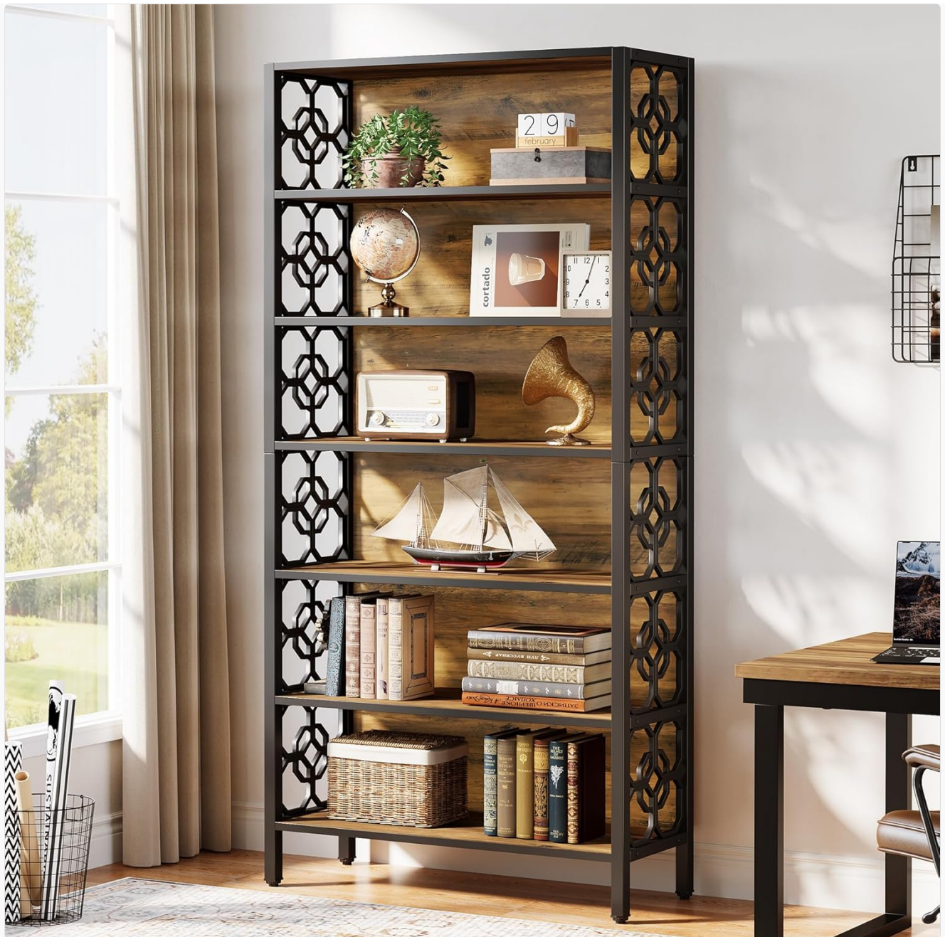
Figure 1: Tribesigns 6-Tier Industrial Bookshelf (Model LD0020)